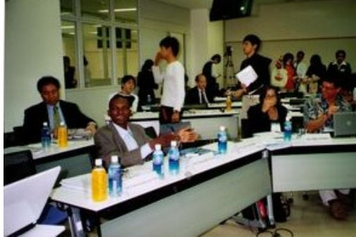
Speaker from Kenya