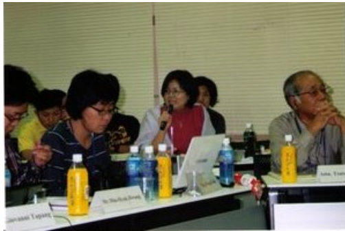
Speaker from Japan