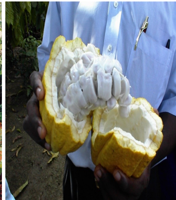
Fresh Cocoa Pod and seeds