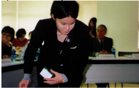
Support Staffs at Okinawa