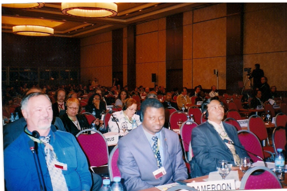
FEEDAR & HR Director in Plenary.