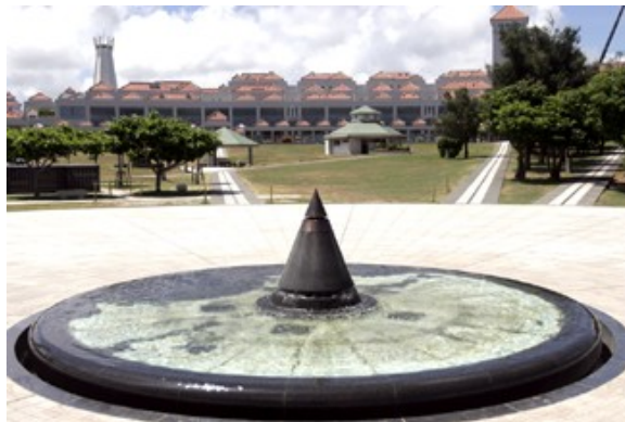
Okinawa peace monument.

The Peace Monument in Okinawa is like a dream, but it is a reality when you see the millions of peoples name on the walls and the cliff where millions committed suicide. See full report of conference on http://www.unep.org/law/About_prog/introduction.asp