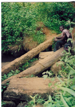
Broken foot bridge