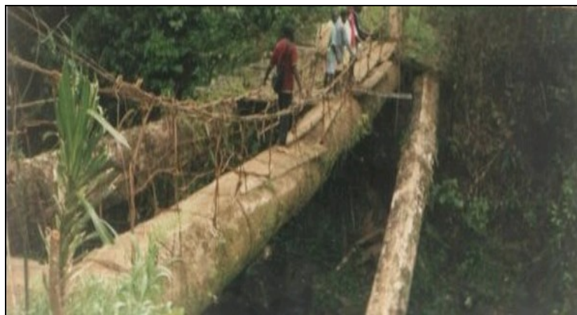
In Meme River Forests Reserve and Meme River Community Forests