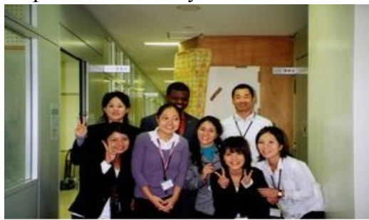
NFINN and Conference Staffs at Okinawa