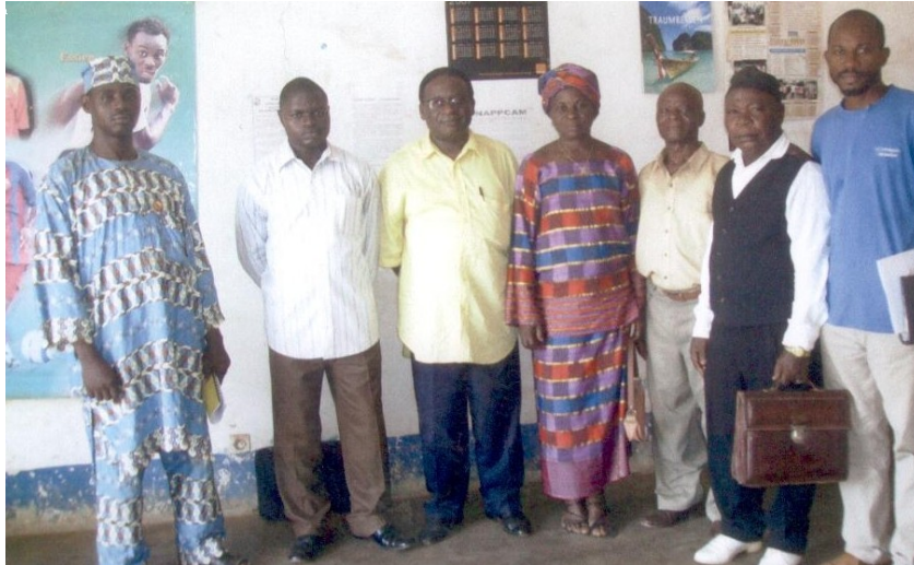
Centre Yellow shirt COFTA member and FEEDAR & HR Board members

Prior to becoming COFTA member a formal application was submitted to World Fair trade Organization where as the principle apply, an existing COFTA member was sent to FEEDAR & HR head office where an exclusive meeting was held on the possible membership Co-operation.