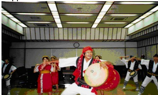
Animation at the opening ceremony