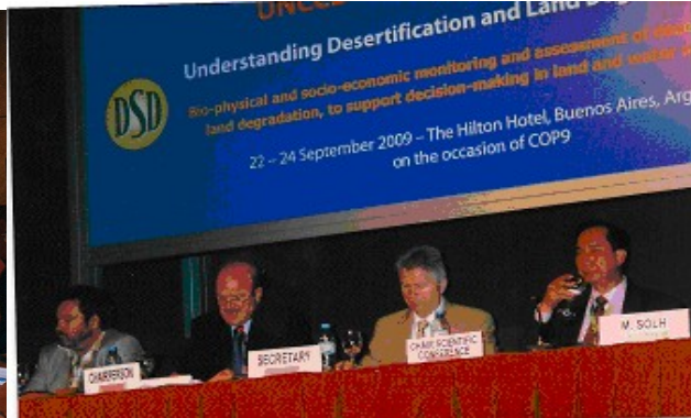
Main Speakers and Penalists