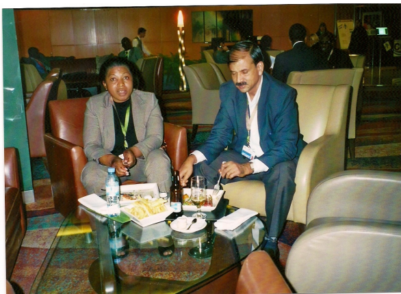
UN staffs at the Lobby after a long working day