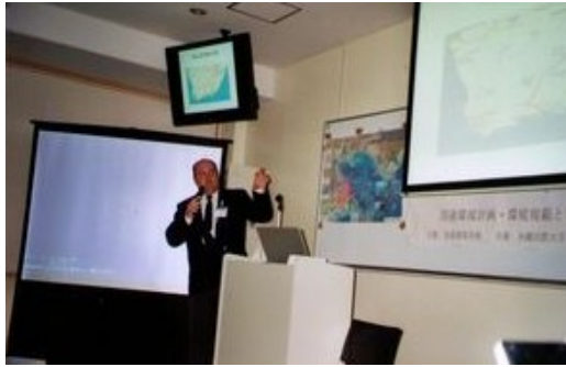
Poster Presentation from South Africa