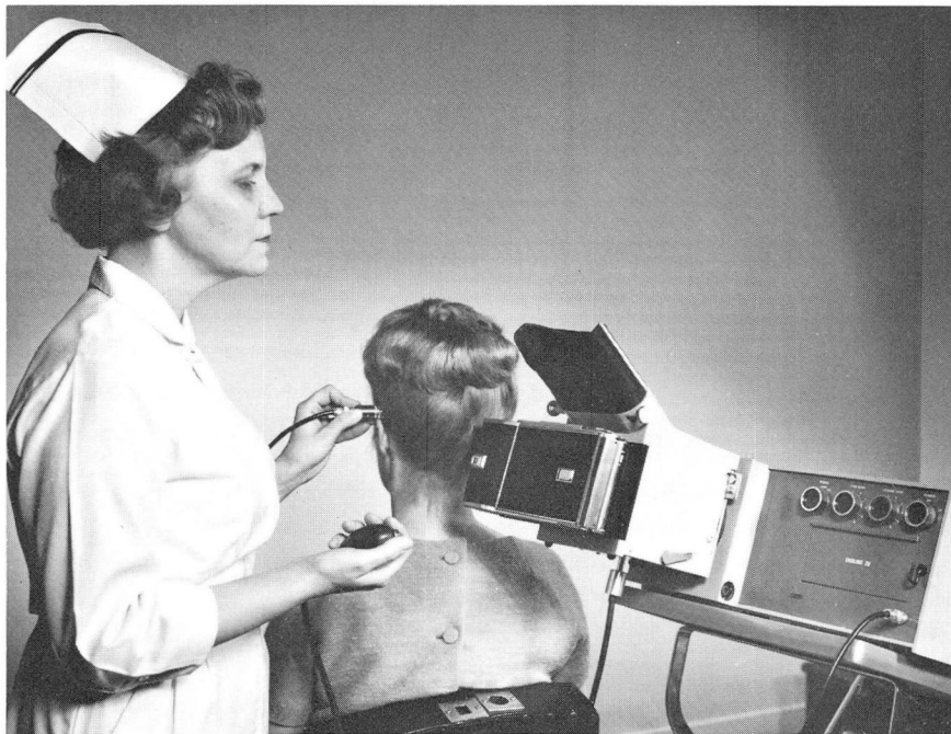
Fig. 1. Photograph showing the application of the transceiver probe of the Ekoline 20 unit to the skin over the ear, and the camera unit that photographs the oscilloscope tracing.

tion of a head injury. Two months previously he had had muffled hearing and tinnitus; examination by a specialist revealed fluid behind the ear drum.