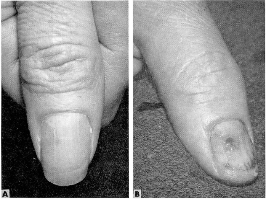
Fig. 2. A, the small, round area of discoloration beneath the woman's thumbnail presents the typical appearance of a glomus tumor. B, after careful complete avulsion of the nail, the extent of the lesion is obvious and total excision of the tumor is readily accomplished.

the tumor area, or with changes in temperature. Rarely the attacks of pain arise spontaneously.