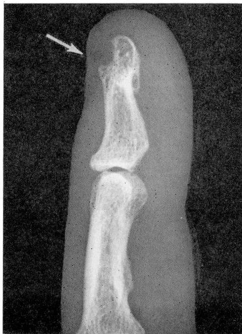
Fig. 4. A roentgenogram of the lateral view of the distal phalanx, index finger. The arrow points to a region of bone erosion, in the tuft of the distal phalanx, produced by pressure of a subungual glomus tumor.