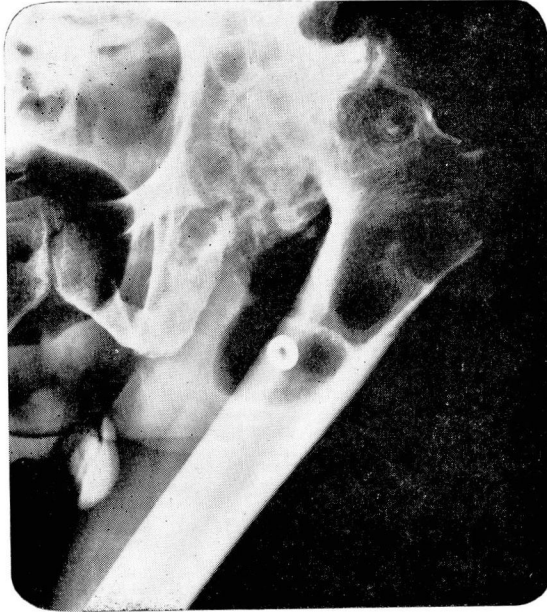
Fig. 1. Plain roentgenogram of the left hip. Note evidence of gas-filled area in region of proximal femur.