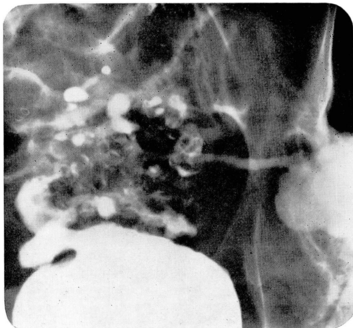
Fig. 3. Close-up of fistulous formation from perforated diverticulitis.

satiety, and had lost more than 30 pounds. He had not experienced a "change in bowel habits," and there was no history of gastrointestinal bleeding. There was no significant abdominal pain and there was no fever or dysuria. He was treated symptomatically, and had improved somewhat and was transferred to the Cleveland Clinic Hospital for further evaluation and therapy of diverticulitis.