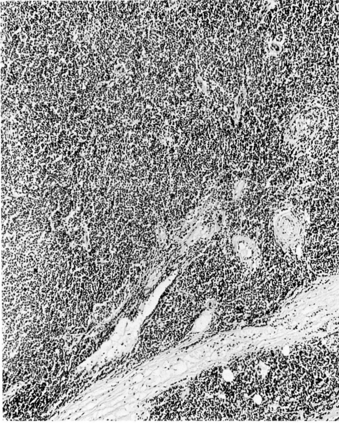
Fig. 1. Histology of a supraclavicular lymph node. Normal architecture of the lymph node is replaced by a uniform population of lymphocytes which infiltrate through the capsule into the surrounding adipose tissue. Hematoxylin and eosin, \times 80 .

IgG and reacted with antisera specific for IgG and Fc* fragment, but did not react to \kappa , \lambda , Fab \kappa or Fab \lambda † antisera (Fig. 3). Immuno-electrophoretic comparison with whole human serum indicated an \alpha -globulin mobility. A repeat lymphocyte transformation to PHA was 39%. The urine continued to contain a heavy chain fragment.