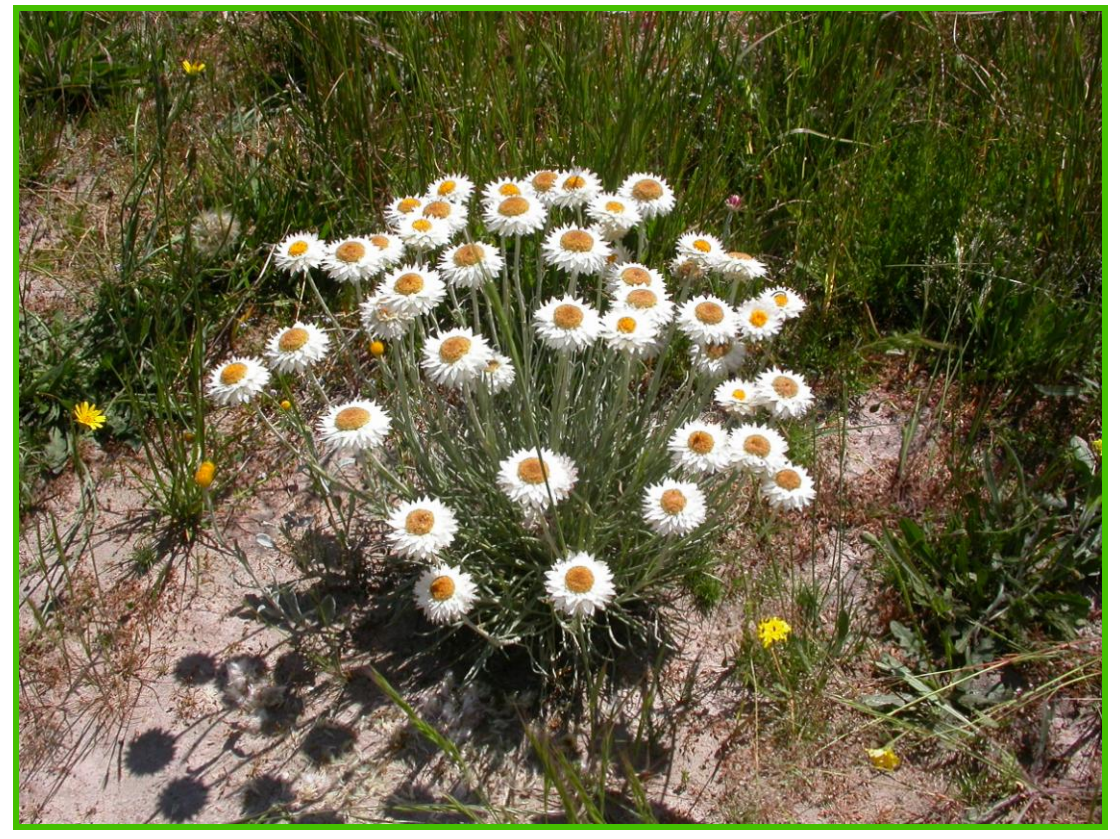
Figure 5: The nationally threatened species Leucochrysum albicans subsp. albicans var. tricolor has successfully been reintroduced to six GGRP sites.