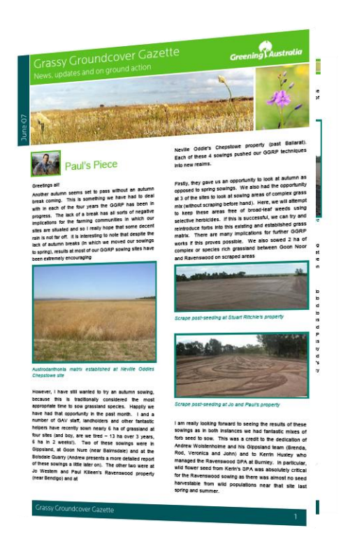
Figure 8: Sample of the Grassy Groundcover Gazette, editions May 06 and June 07