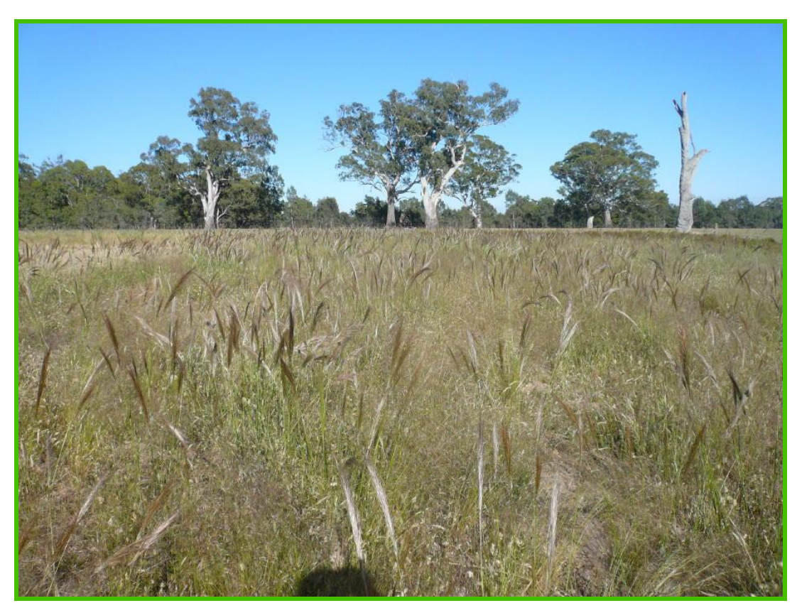
Figure 4: Impressive establishment of species on a scalped section within the GGRP Laharum sowing site twelve months after sowing (Wimmera CMA region). Note higher sward of Austrostipa mollis. A large number of other grass and forb species are also present.