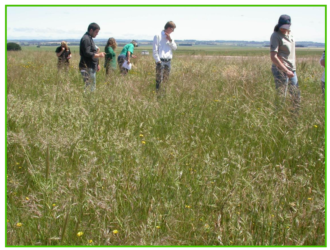
Figure 7: A number of field day participants are shown through a sward of grassland twelve months after sowing. This site was situated on the Dennis property out of Colac (Corangamite CMA region).

To-date, Greening Australia (Victoria) has received backing to initiate two related grassland/grassy understorey reconstruction projects based on the successes of the GGRP. The first, backed by the East Gippsland CMA, will reinstate 3 ha of redgum grassland near Bairnsdale, while a partnership with Alcoa Australia (at its Point Henry Plant near Geelong), aims to reconstruct 200 ha of redgum grassland over a 10-15 period.