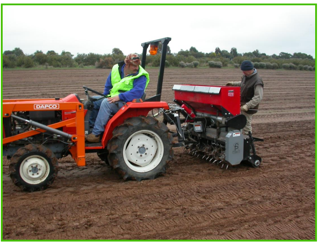
Figure 3: The modified turf seeder which allows the sowing of multiple species in one pass in action at the GGRP Chatsworth site (Glenelg-Hopkins CMA region).

At a time when climatic conditions (i.e. drought), were amongst the most challenging in living history, the GGRP sowings have established thirteen ha of species rich grassland. Most encouragingly, our results suggest that it is possible to use mechanized equipment (Figure 3), to sow complex combinations of grassland species under field conditions, and achieve high levels of establishment (between 40 and 100 sown plants m<sup>-2</sup>) (Figure 4 & Table 3 & 4). Among these are many locally, regionally and nationally threatened species. We have also noted high levels of subsequent recruitment of second generation individuals from many species established in each of the first two annual sowings.