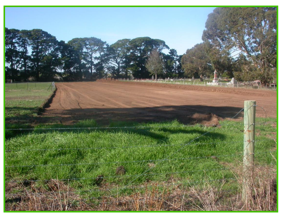
Figure 6: A 2000 m<sup>2</sup> scalped zone ready for seeding at the GGRP Beeac Cemetery site (Corrangamite CMA region). This approach was found to significantly reduce subsequent weed competition from non-sown species.

The GGRP has undertaken a number of extension activities during the funding period. The project received considerable coverage in both regional and non-regional press (electronic and print). Over 30 papers have been presented to technical and scientific forums on the undertakings of the project. Perhaps the most successful extension vehicle was the electronic newsletter entitled the Grassy Gazette. This quarterly publication reached an extremely large subscribership. Finally, the GGRP ran six field days across the southwest of the state. Each field day was oversubscribed, with in many cases, participants travelling from interstate to attend (Figure 7).