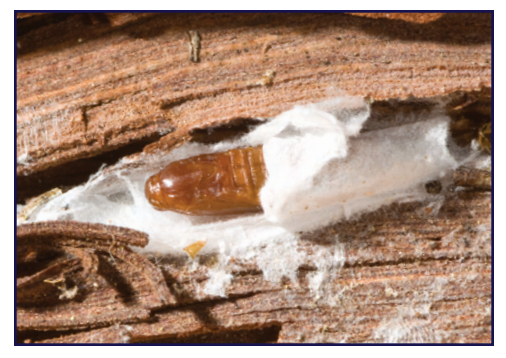
Pupa: ½ inch long inside a grayish white silken cocoon.