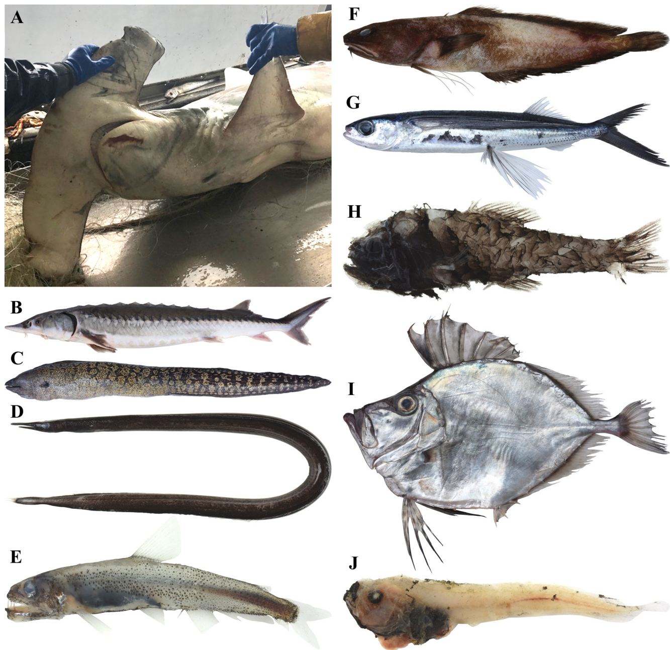
Figure 2. – Significant French ichthyological records for 2017. A: Sphyrna zygaena, ~250 cm, 18 Sep. 2017, B: Acipenser sturio, 922 mm TL, 22–23 Apr. 2017, MNHN-IC 2019-0092; C: Muraena helena, 1153 mm TL, 11 Feb. 2017, MNHN-IC 2019-0093; D: Nessorhamphus ingolfianus, 460 mm TL, 29 Oct. 2017, MNHN-IC 2019-0094; E: Evermannella balbo, 123 mm TL, 29 Oct. 2017, MNHN-IC 2019-0095; F: Raniceps raninus, 118 mm TL, 22 Nov. 2017, MNHN-IC 2019-0096; G: Cheilopogon heterurus, 370 mm TL, 23 June 2017, MNHN-IC 2019-0097; H: Scopelogadus beanii, 97 mm TL, 29 Oct. 2017, MNHN-IC 2019-0098; I: Zenopsis conchifer, 245 mm TL, 10 Oct. 2017; J: Eutelichthys leptochirus, 68 mm TL, 22 June 2017, MNHN-IC 2019-0099.