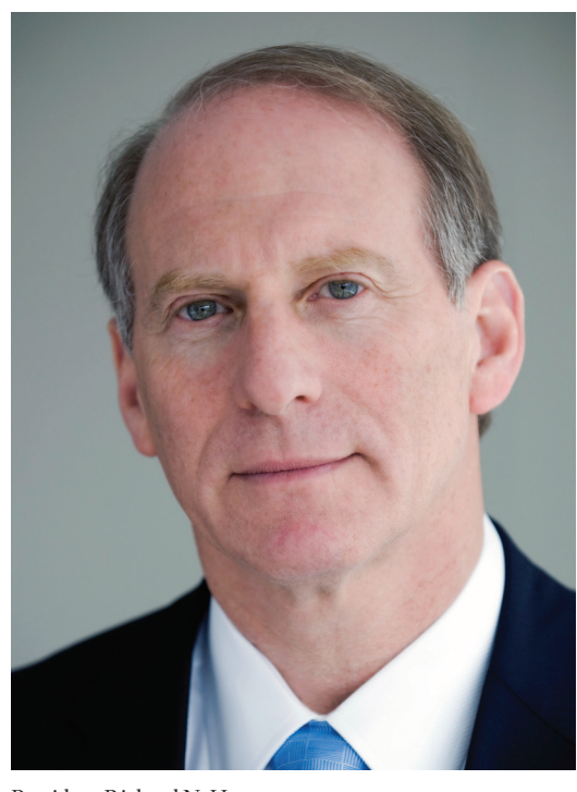
President Richard N. Haass

For nearly a century, CFR scholarship has covered traditional foreign policy topics, such as national security, trade, and diplomatic relations, along with the most important and, in many cases, most volatile regions and countries. We continue to study these issues, but we have also expanded our intellectual agenda to address matters such as child marriage; girls' education; cybersecurity; the domestic underpinnings of U.S. power, including debt and deficits, immigration, infrastructure,