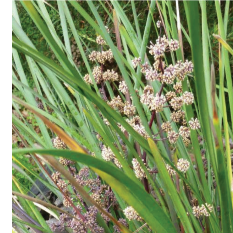
Lomandra multiflora ssp dura Stiff Mat Rush H: 0.2-0.6m W: 0.6-1m