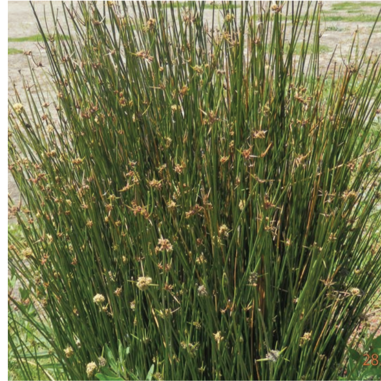
Cyperus gymnocaulos Spiny Flat Sedge H: 0.5-1m W: 0.5-1m