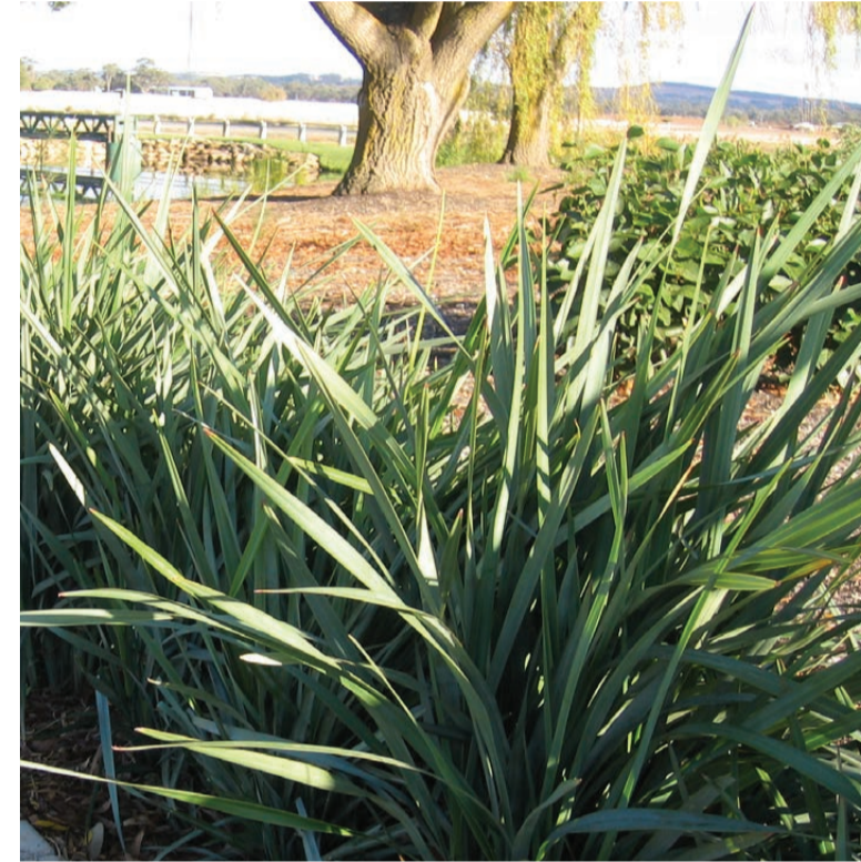
Dianella revoluta Black Anther Flax Lily H: 0.3-1m W: 0.5-2m