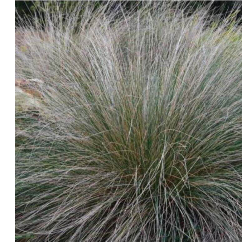
Poa poiformis Coastal Tussock Grass H: 0.6-1m W: 0.5-1m