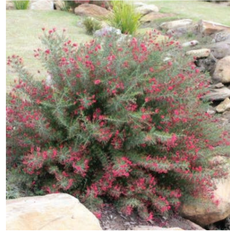
Grevillea rosmarinifolia 'Crimson Villea' Crimson Villea H: 0.8m W: 0.8m