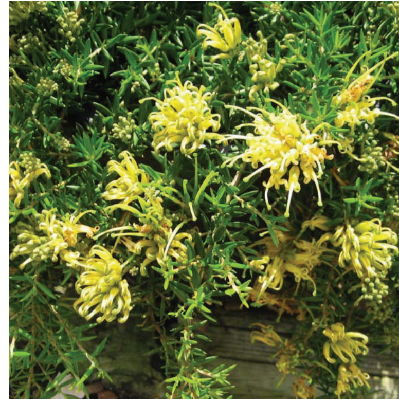
Grevillea juniperina 'Gold Cluster' Gold Cluster H: 0.3m W: 1m