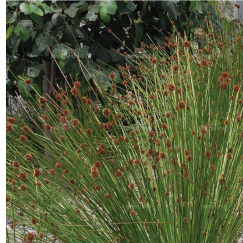
Ficinia nodosa Knobby Club Rush H: 0.5-1.5m W: 0.5-2m