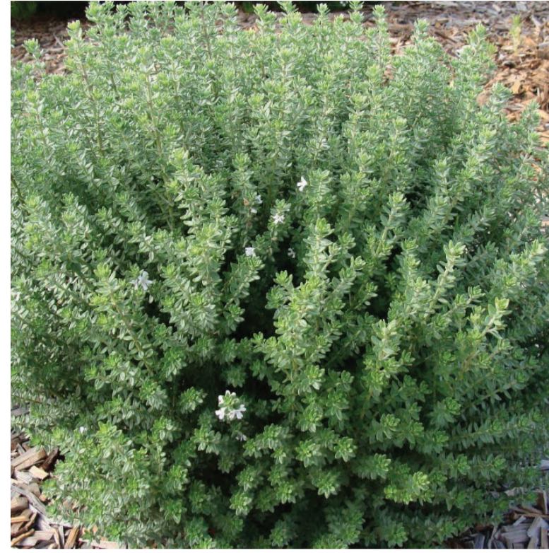
Westringia fruticosa 'Grey Box' Grey Box H: 0.4m W: 0.4m