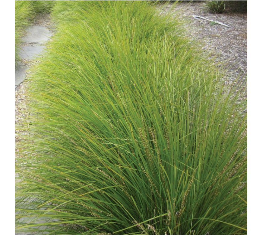
Lomandra longifolia 'Tanika' Tamika Lomandra H: 0.6m W: 0.6m