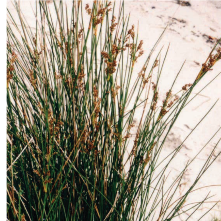
Juncus kraussii Sea Rush H: 0.5-1m W: 0.5-1.5m