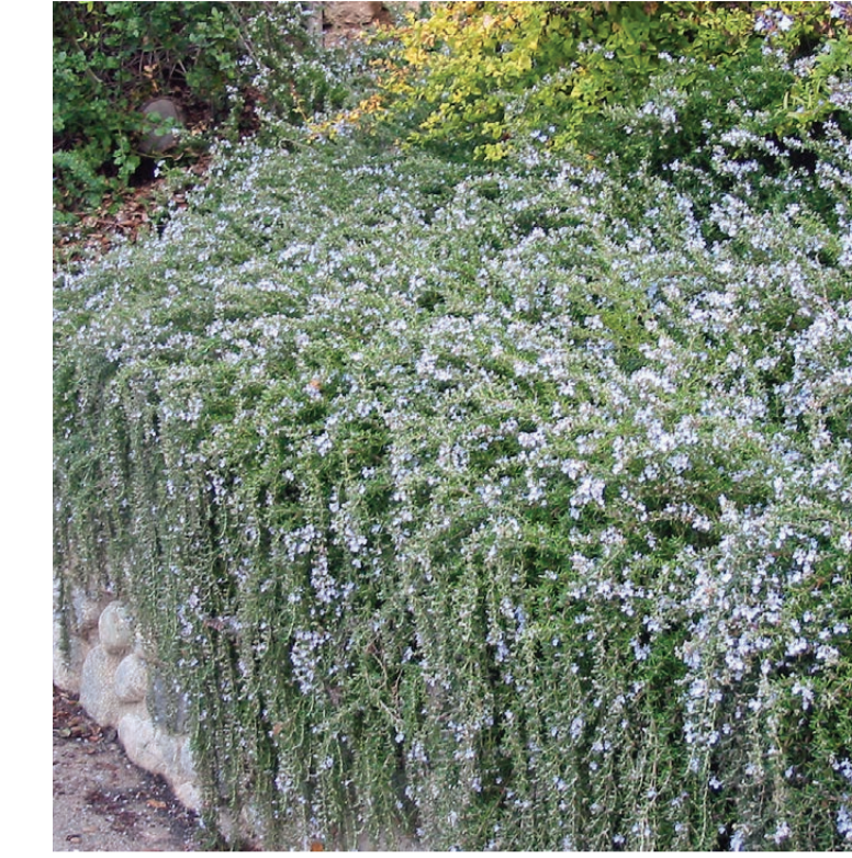
Rosmarinus officinalis 'Prostrate' Prostrate Rosemary H: 0.5m W: 2m