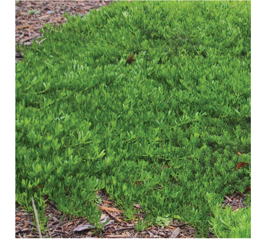
Myoporum parvifolium Creeping Boobialla H: 0.2m W: 2m