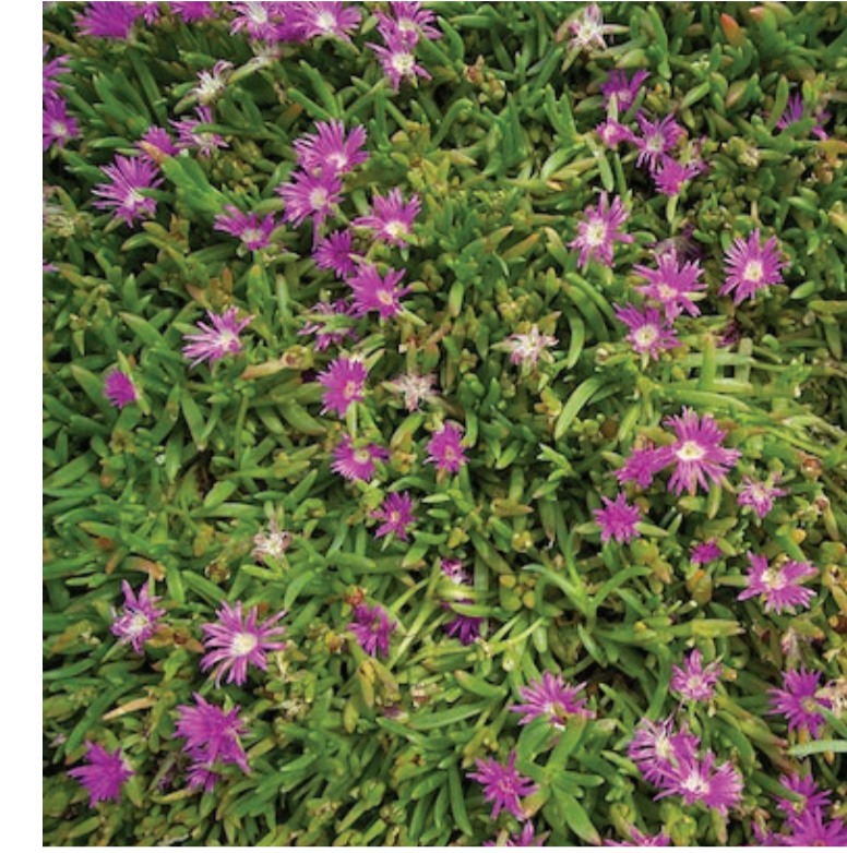
Disphyma crassifolium Round Leaved Pigface H: 0.3m W: 1-2m