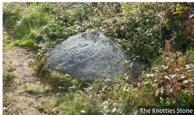
The Knotties Stone