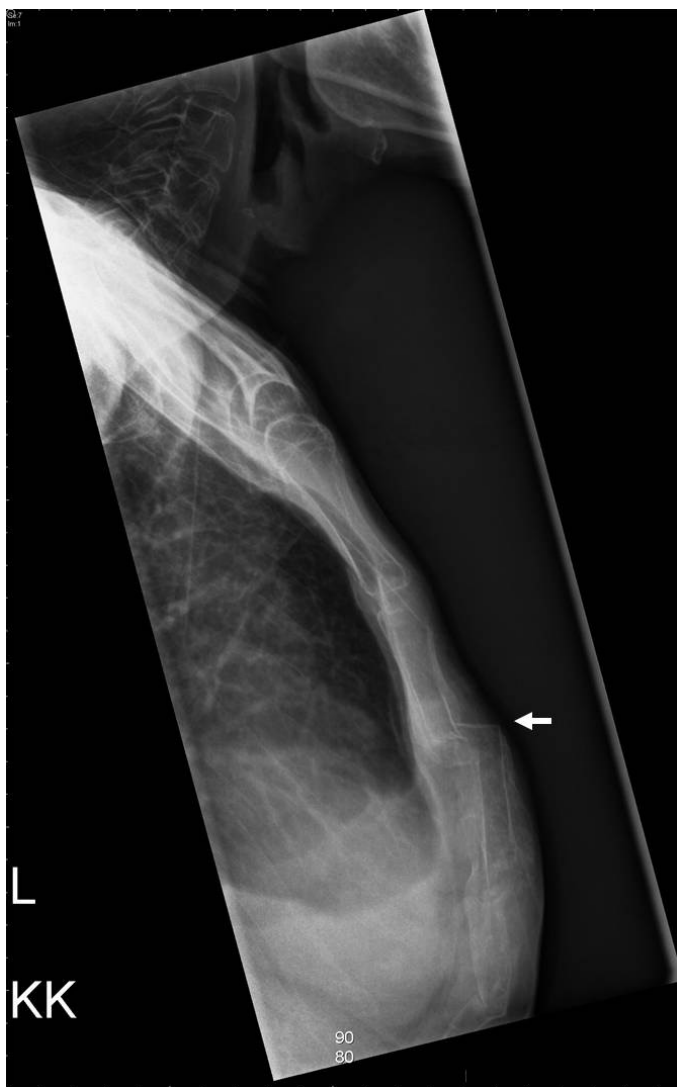
Figure 1: Lateral spot-view radiograph of the sternum reveals fracture of the sternal body. There is interval development of a new fracture in the proximal portion of the sternal body (arrow).

level. The patient used a cane minimally and was slow in ambulation due to postural imbalances related to his severe kyphosis. Light palpation of mid-sternum in the anterior-to-posterior direction revealed crepitation and reproduced the chest pain. Sternal radiographs revealed a fracture subluxation with slight step deformity in mid-portion of the sternum, corresponding to the painful area