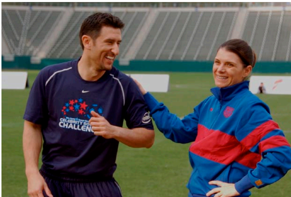
Nomar Garciaparra and Mia Hamm, at the 2010 Mia Hamm & Nomar Garciaparra Celebrity Soccer Challenge, benefiting the Mia Hamm Foundation and Childrens Hospital Los Angeles