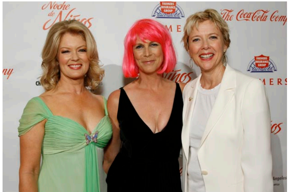
Childrens Hospital Los Angeles Trustee and New Hospital Building Campaign Co-Chair Mary Hart (left), 2009 Courage to Care recipient Jamie Lee Curtis, and Annette Bening at the 2009 Noche de Niños gala