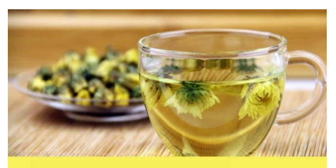
Brewed Cup of Chrysanthemum Tea

Personally I would avoid eating or making tea from any chrysanthemum in my garden due to the amount of pesticides that we use. (This may be no more than what is applied to some of the fruit and vegetables that we buy, especially tomatoes.)