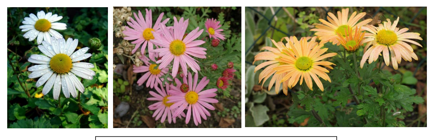
Three colour varieties of Chrysanthemum zawadskii .

two or more species. In the case of C. x morifolium, C. indicum is generally agreed to be one ancestor with the other(s) the subject of debate. Barrie Machin writing in the 1993 NCS(UK) Yearbook states that C. x morifolium was developed from two Chinese species, "probably" C. indicum and C. zawadskii . These two species are widespread through East Asia. Another source nominates C. indicum and C. japonense as the progenitors, despite the fact that C. japonense is confined in its natural distribution to Japan. For we humble gardeners it matters little, except to say that there are no large flowered chrysanthemum species, so that our modern cultivars, "of staggering immensity", are all the result of growers selecting for larger size during more than three thousand years of cultivation. In 1961 our chrysanthemums were renamed as Dendranthema x grandiflorum <sup>5</sup> but were then transferred back to Chrysanthemum in 1999.<sup>6</sup>