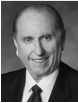
NguMongameli uThomas S. Monson