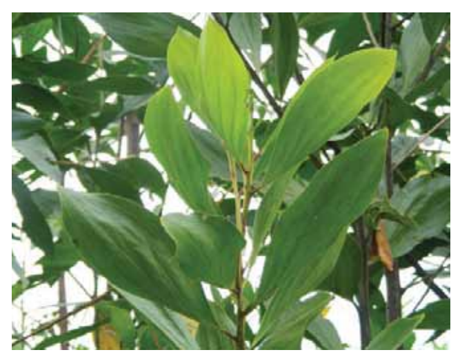
Figure 4. Phyllodes of A. mangium