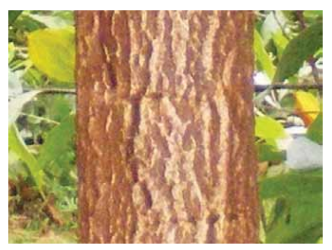
Figure 1. Bark of young A. mangium tree

Acacia mangium trees are generally large and can grow to a height of 30 m, with a straight bole that may be more than half of the total tree height. Trees with a diameter at breast height (DBH) of more than 60 cm are rare; however, stem diameters of up to 90 cm have been measured in the natural forests of Queensland and Papua New Guinea (National Research Council 1983). On relatively poor sites, the trees may resemble a large shrub or small tree with an average height between 7 and 10 m (Turnbull 1986). The stem has longitudinal furrows. Bark in young trees is smooth (Figure 1) and greenish; fissures begin to develop at 2–3 years. Bark in older trees is rough (Figure 2), hard and fissured near the base, and coloured brown to dark brown (Hall et al. 1980).