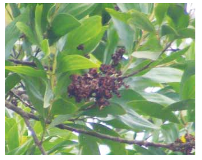
Figure 6. Mature blackish-brown A. mangium pods