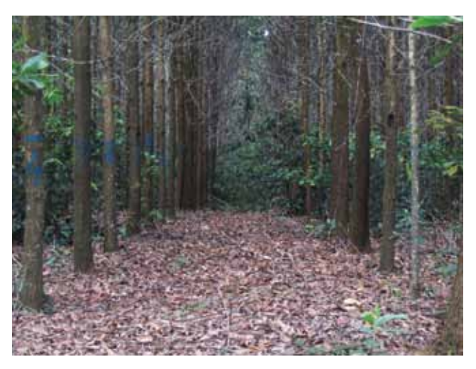
Figure 9. Three-year-old A. mangium trees planted with a spacing of 3\times 3 m in large-scale plantations in South Sumatra

Acacia mangium seedlings grown in fairly open conditions and on good sites often develop multiple leaders (Figure 10). In addition, the species has a poor self-pruning ability. Therefore, singling and pruning are necessary in an early stage of stand development if the aim is to maintain full growth potential and produce good-quality timber (Mead and Speechly