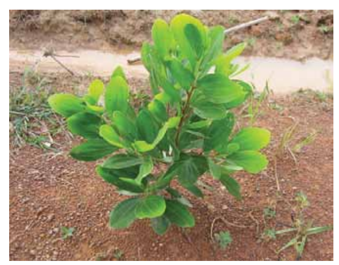
Figure 3. Juvenile leaves of A. mangium seedling

Acacia mangium originates from the humid tropical forests of north-eastern Australia, Papua New Guinea and the Molucca Islands of eastern Indonesia (National Research Council 1983). Since its successful introduction into Sabah, Malaysia, in the mid 1960s, it has been widely introduced into many countries, including Indonesia, Malaysia, Papua New Guinea, Bangladesh, China, India, Philippines, Sri Lanka, Thailand and Vietnam. In Indonesia, A. mangium was first introduced into regions other than the Molucca Islands in the late 1970s as a species for reforestation (Pinyopusarerk et al. 1993).