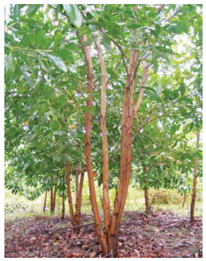
Figure 10. Multi-stemming tendency of A. mangium trees

In general, A. mangium is relatively free from serious diseases and pests (Mead and Miller 1991). Surveys to evaluate diseases in tropical Acacia plantations have concluded that heart rot, root rot and phyllode rust (i.e. fungal infections of heartwood, roots and leaves, respectively) are the main threats (Old et al. 2000). Heart rot does not kill trees, but the quality of wood decreases; the wood becomes whitish, spongy or fibrous and is surrounded by a dark stain. Heart-rot fungi are wound basidiomycete parasites that enter