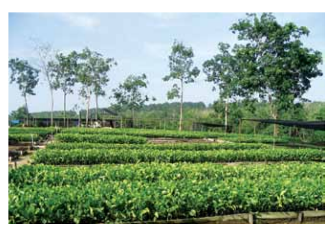
Figure 7. Nursery and seedling production of A. mangium in Riau, Sumatra

Seedlings are planted manually during the rainy season on freshly prepared sites, on which the recommended spacing has been marked out. Seedlings are planted in contour lines on slopes and in straight lines on flat areas. After its polythene bag is removed, each seedling is carefully placed into a planting hole of about 13 cm in diameter and 20 cm in depth (Srivastava 1993). See Section 5.2 for fertilisers used during planting.