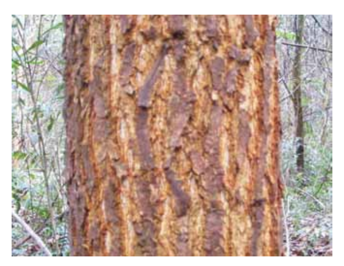
Figure 2. Bark of old A. mangium tree