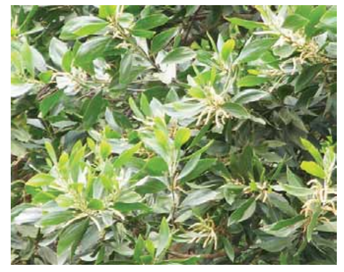
Figure 5. Inflorescence of A. mangium