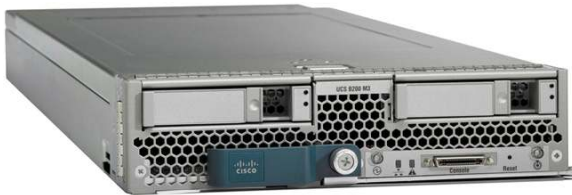
Figure 1. Cisco UCS B200 M3 Blade Server

The Cisco UCS B200 M3 Blade Server continues Cisco's commitment to delivering uniquely differentiated value, fabric integration, and ease of management that is exceptional in the marketplace. The Cisco UCS B200 M3 further extends the capabilities of Cisco UCS by delivering new levels of manageability, performance, energy efficiency, reliability, security, and I/O bandwidth for enterprise-class applications: