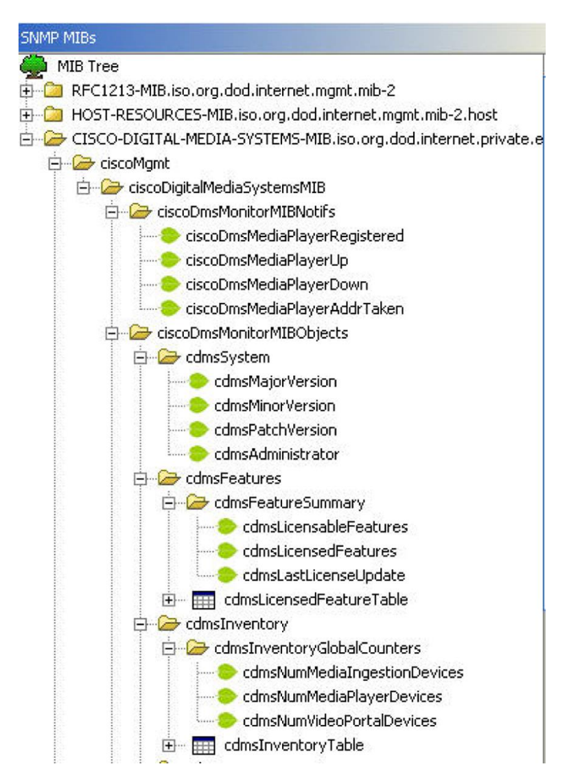
Figure 1. Cisco SNMP Notification Module MIBs

You can obtain this information from a variety of network management applications and PC-based SNMP MIB browsers.