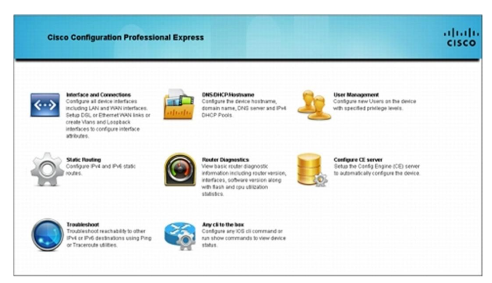
Figure 3. Cisco Configuration Professional: Wizard-Based Management

Group-based management features allow administrators to design security policies and authentication methods for each group, a feature that is essential when extending network resources to non-corporate-managed users and endpoints.