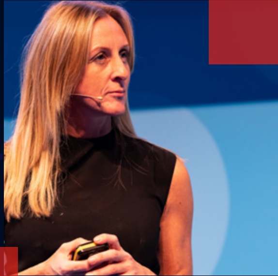
Influence through speaking opportunities