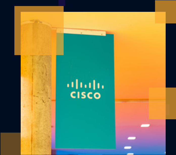
Amplify your company brand alongside Cisco