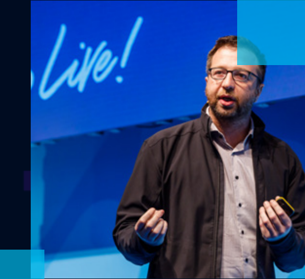
Engage with your customers and prospects