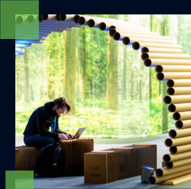
Connect with IT professionals and decision makers