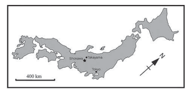
Fig. 1. Map of Japan showing the location of Shokawa and Takayama City.

Prefecture, Japan (Fig. 1). The Mitarai Formation was previously assigned to the Middle Jurassic on the basis of a single ammonite species, Lilloetia sp. (Sato and Kanie, 1963), or to the Upper Jurassic by Komatsu et al. (2001) based on bivalves. However, the discovery of new ammonites (berriasellids) and a revision of the formerly described species suggest that the formation is, in fact, Tithonian–Berriasian (Sato et al. , 2003). Radiometric U-Pb dating of zircons within tuff beds from the Mitarai Formation give an absolute date of 129.8 \frac{1}{2} 1.0 Ma, that is, Hauterivian–Barremian (Kusuhsahi et al. , 2006). This data and the recent discovery of a single ammonite, Neocosmoceras sp., that was likely to have been collected from the Mitarai quarry suggests a Berriasian age (Sato et al. , 2008), although further evidence is needed to corroborate this determination.