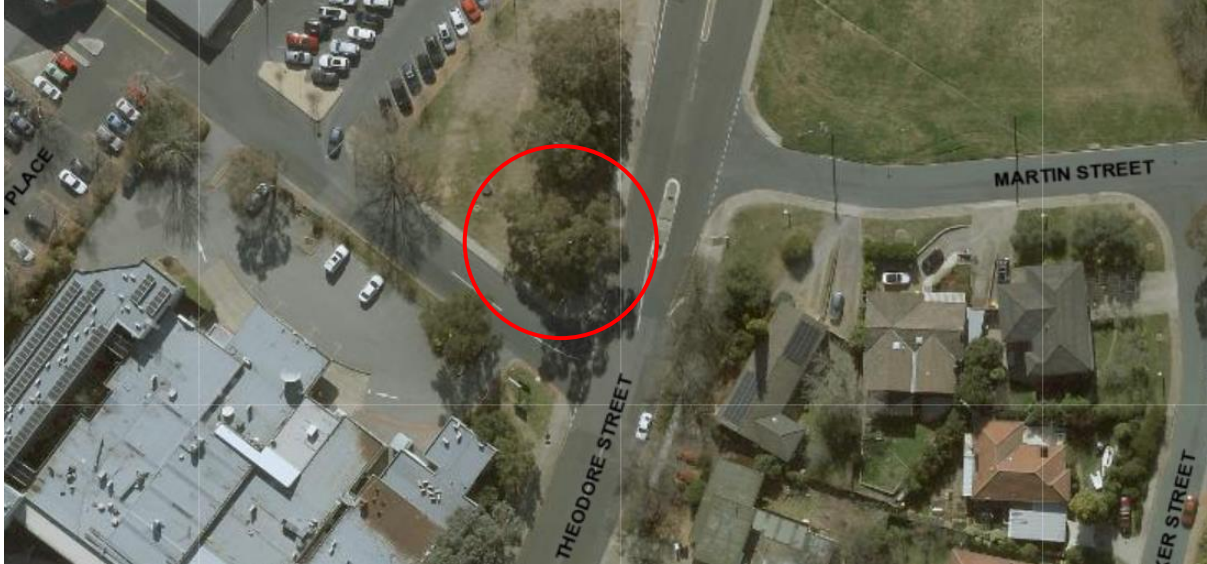
Location of Eucalyptus mannifera RT1134 in Curtin