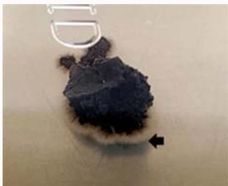
Figure 3: Macromorphology of Sporothrix schenckii , creamy colonies (arrow) forming brown-black color colonies.