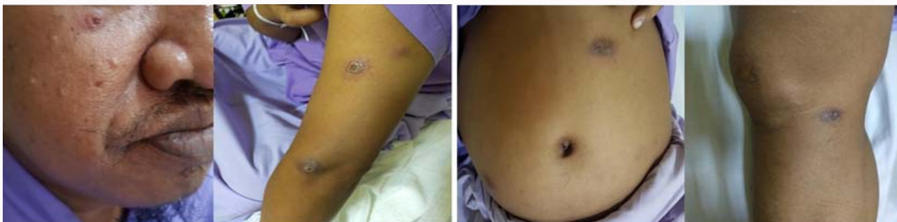
Figure 1: A). Multiple erythematous tender ulcerated papule on the cheek, B) Ulcerated nodules on left upper limb. C) Abdomen. D) Right lower limb.