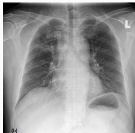
Figure 4: Chest X-ray noted multiple new centrilobular lung nodules at right upper lung zone.

Chest X-ray demonstrated multiple centrilobular lung nodules at right upper lung zone (Figure 4). CT scan of thoracic, abdomen and pelvis showed consolidations over peribronchovascular right upper lobe, irregularity of the apical branch of right upper lobe bronchus and right hilar lymphadenopathy (Figure 5). Otherwise, there was no intra-abdominal collection. Bronchoscopy revealed swollen, irregular and inflamed mucosa over segmental bronchus of right upper lobe. Fungal culture from bronchoalveolar lavage also grew Sporothrix schenckii . Hence, diagnosis of systemic sporotrichosis with cutaneous and pulmonary involvement was made.