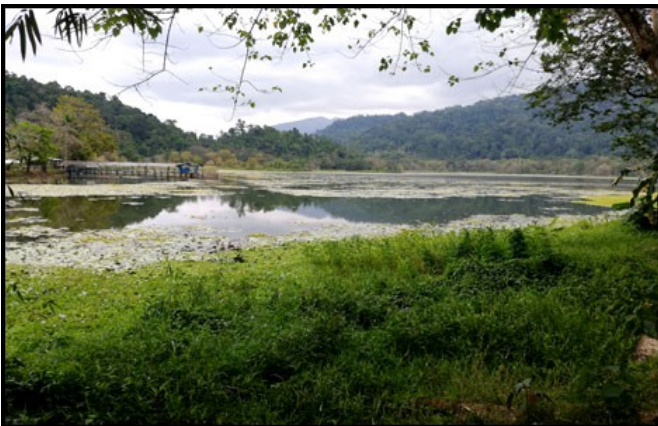
Lake Libuao, Sablayan, Mindoro.