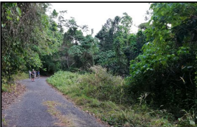
Subic Bay Freeport Zone, Luzon.