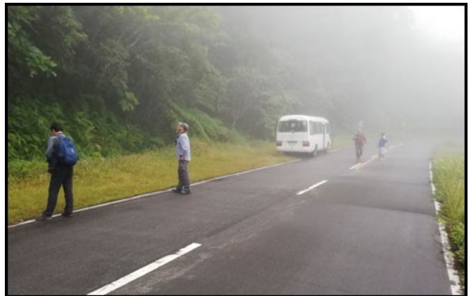
Waiting for Whiskered Pitta, Infanta Rd, Luzon.