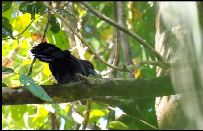
Black-hooded Coucal, Sablayan, Mindoro. MG.

On two different days we tried to watch waders at mudflats close to Puerto Princesa. The first place was restricted private site which Bram had access to, it was south of the airport (9.727198, 118.771208), there was a good selection of shorebirds including many Grey-tailed Tattlers, Greater and Lesser Sand Plovers, Red-necked Stints and Pacific Golden Plovers. Immediately close to the Airport there are some easily accessible mudflats (9.739248, 118.772276) where we found a feeding Chinese Egret upon arrival. Shorebirds were more distant here and disappeared due to rising tide.