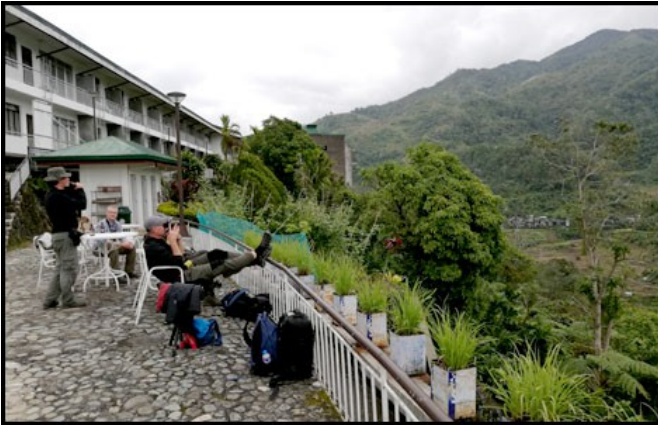
Scanning from Banaue Hotel, Cordilleran Mts, Luzon.