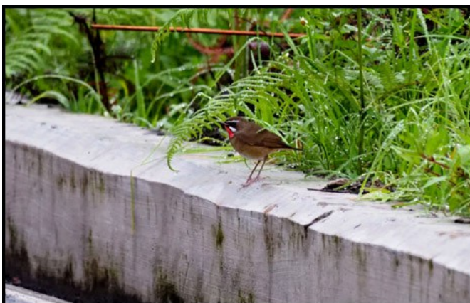
Male Siberian Rubythroat, Mt Polis. MG.