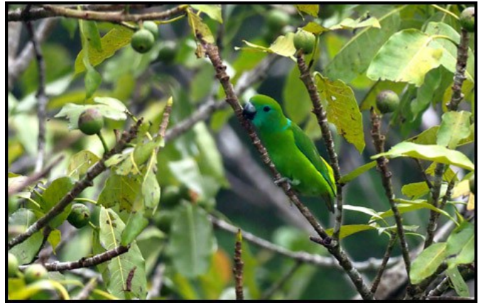
Guaiabero, Infanta Rd. MG.