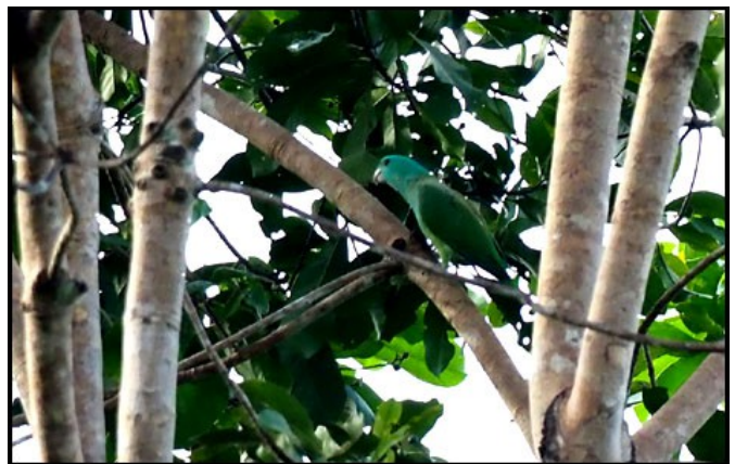
Blue-headed Racket-tail, Sabang. MG.