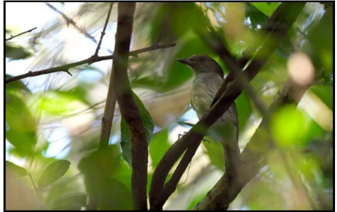
Green-backed Whistler (ssp. mindorensis), Sablayan, Mindoro. MG.