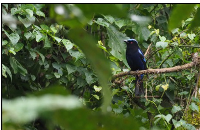
Philippine Fairy-bluebird, Infanta Rd. MG.