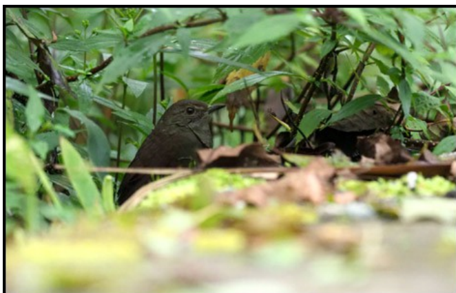
Long-tailed Bush Warbler (ssp. caudata), Mt Polis. MG.