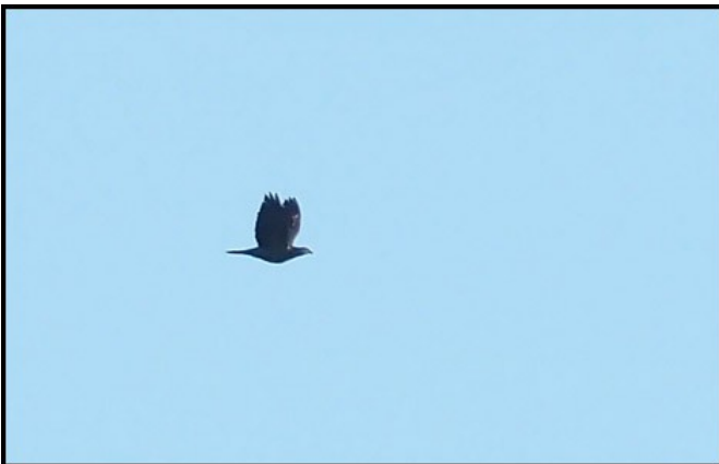
Metallic Pigeon, Sablayan. MG.