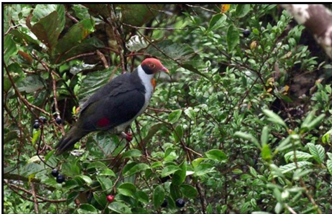
Flame-breasted Fruit Dove, Mt Polis. MG.