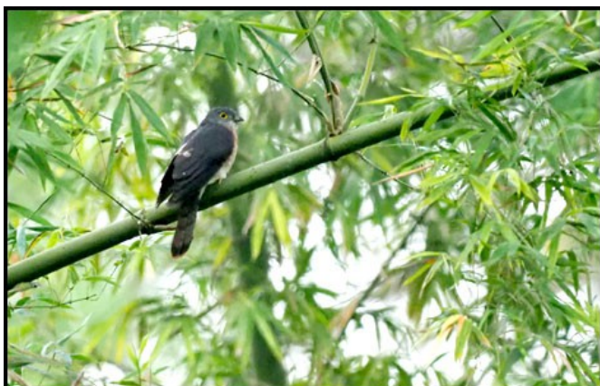
Philippine Hawk-Cuckoo, Sablayan.