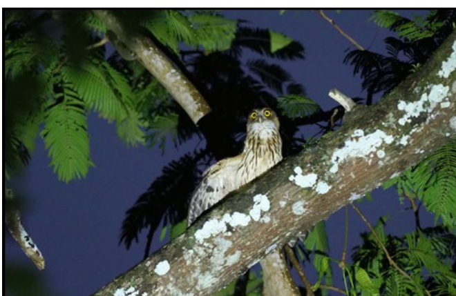
Philippine Eagle-Owl, Mt Makiling.