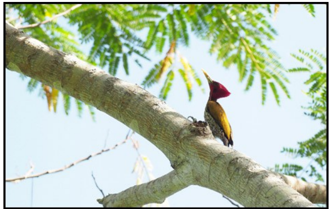
Red-headed Flameback, Sabang. MG.