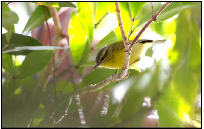
Negros Leaf Warbler (ssp. peterseni), Mt Victoria. MG.