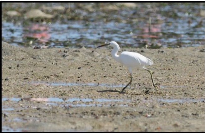
Chinese Egret, Puerto Princesa. MG.