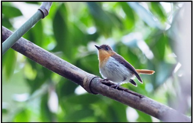
Palawan Flycatcher, Mt Victoria.