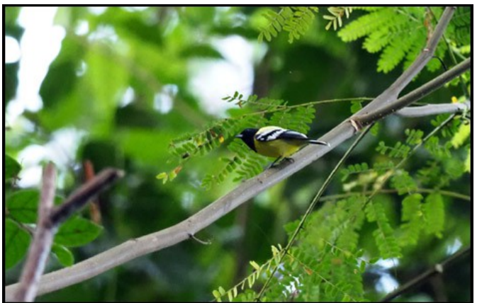
Palawan Tit, Sabang.