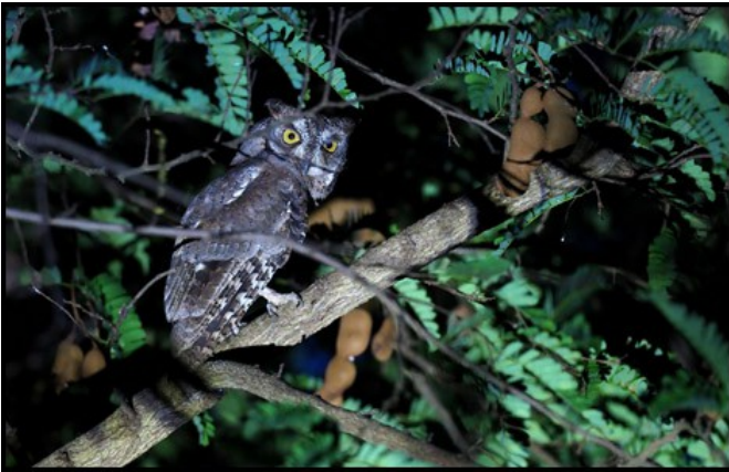
Mantanani Scops Owl, La Cania Island. MG.