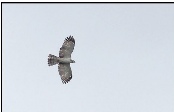
Juvenile Oriental Honey Buzzard, Makiling Botanical Gardens. MG.