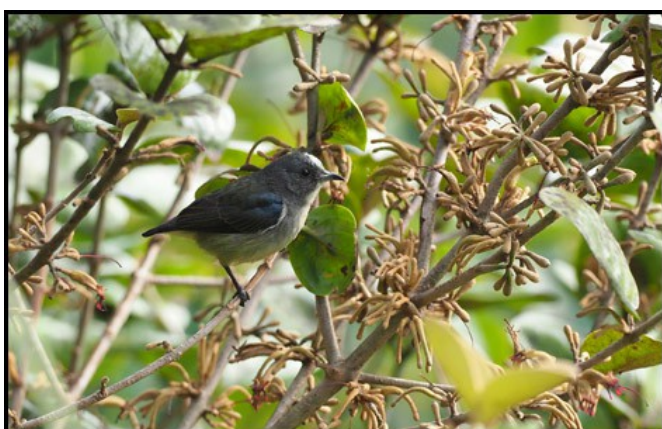
Pygmy Flowerpecker (ssp. pygmaeum), Dalton Pass, Luzon.