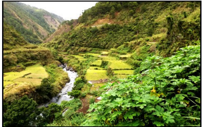
Bay-yo, Mt Polis, Luzon.