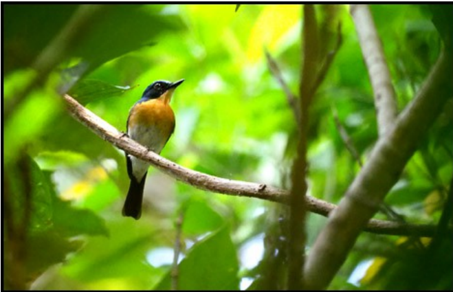
Palawan Blue Flycatcher, Sabang. MG.