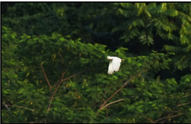
Red-vented Cockatoo, Sabang. MG.