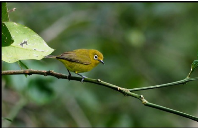
Yellowish White-eye, Banaue Hotel.

Jan26 Late arrival at Manila. Meet up! Jan27 Candaba Marsh via Solano to Mt Polis Jan28 Mt Polis Jan29 Mt Polis Jan30 Dalton Pass, to Subic Bay (Apallin, Nabasan Trail) Jan31 Subic Bay (Oriza, Hospital Rd, Nabasan Rd), late pm to Manila. Feb1 To Palawan. Irawan Ecopark, Badjao Seafront, Liyang Lookout, Sabang. Feb2 St Paul's, Sabang Road, ATV-trail Feb3 N Liyang/Sabang Road, Pandan Island, Puerto Princesa mudflats, to Narra Feb4 Mt Victoria hike to base camp and above Feb5 Mt Victoria to Narra. Evening at La Cania Island (Puerto Princesa Bay) Feb6 Irawan Ecopark, Iwahig ricefields, Airport mudflats. Afternoon flight to Manila. Feb7 Morning flight to Mindoro. To Sablayan. Lake Libuao Feb8 Lake Libuao, trail behind sub-prison, Yapan bridge, Sablayan Feb9 Mindoro to Manila. Transport to Los Baños. Botanical Gardens, fields at Los Baños. Feb10 Mt Makiling, Botanical Gardens, IRRI, Los Baños Feb11 Infanta Rd (km 97-108) Feb12 Infanta Rd (km 97-98). Evening flight home.