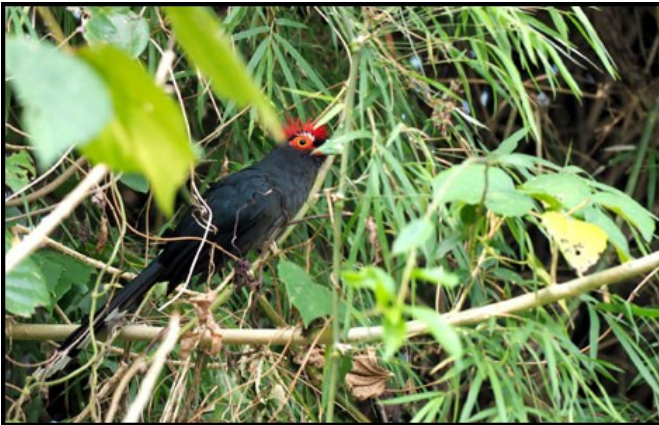
Rough-crested Malkoha, Subic Bay. MG.