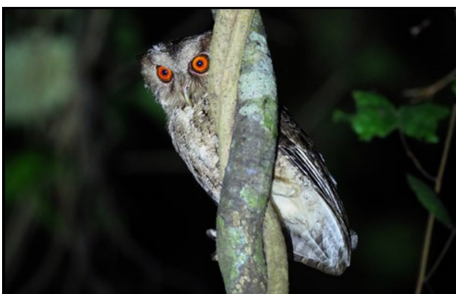
Philippine Scops Owl, Subic Bay. MG.