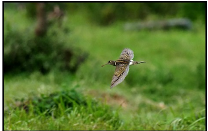
Greater Painted Snipe, IRRI, Los Baños. MG.