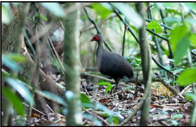
Tabon Scrubfowl, St Paul's. MG.