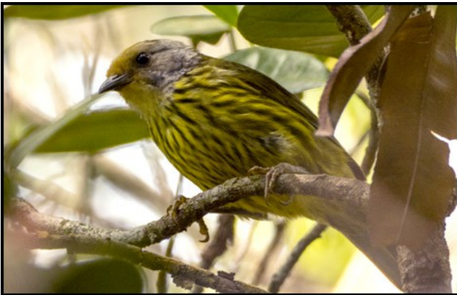
Palawan Striped Babbler, Mt Victoria.