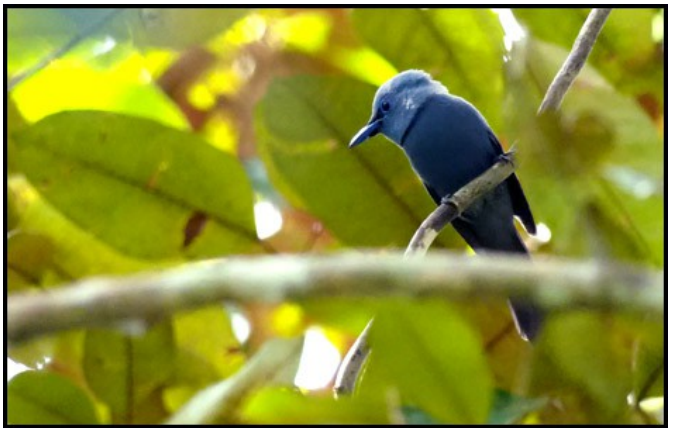
Blue Paradise Flycatcher, Irawan Ecopark. MG.