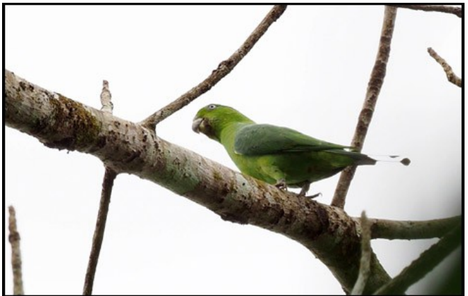
Mindoro Racket-tail, Sablayan. MG.