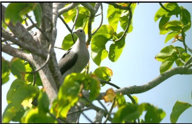
Grey Imperial Pigeon, Pandan Island. MG.