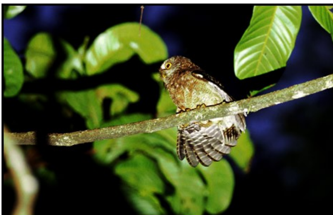
Mindoro Hawk-Owl, Sablayan.