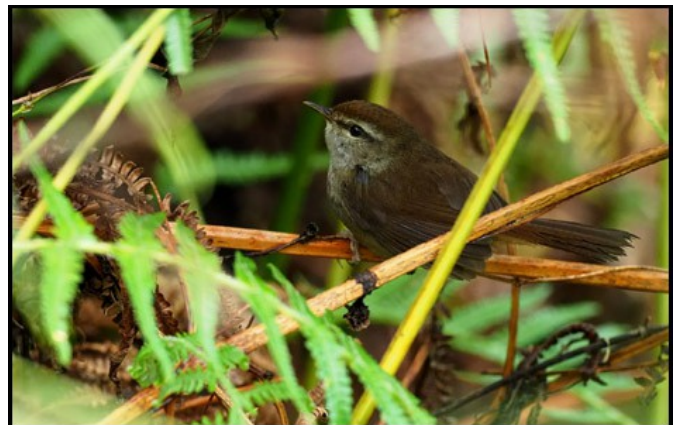
Philippine Bush Warbler, Mt Polis. MG.