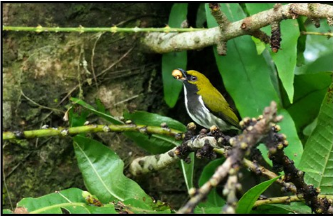
Olive-backed Flowerpecker (ssp. parsonsi), Infanta Rd. MG.