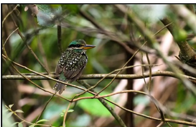
Female Spotted Wood Kingfisher, Dalton Pass, Luzon. MG.