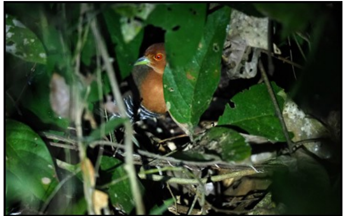
Slaty-legged Crake, Subic Bay. MG.