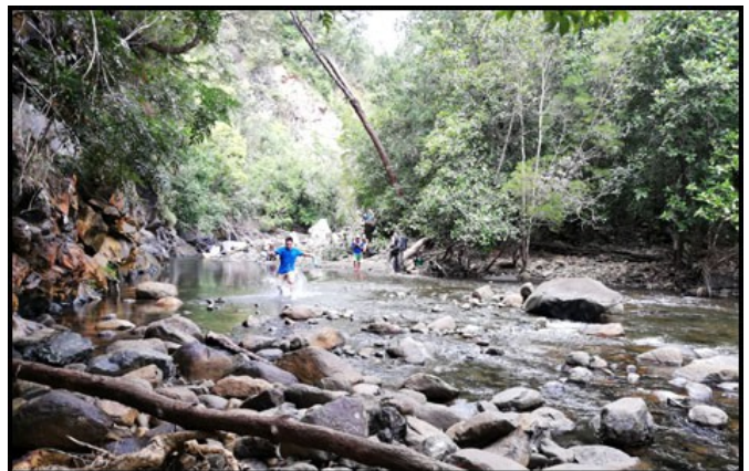
Trek to Mt Victoria, Palawan.