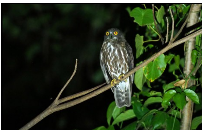
Chocolate Boobook, Subic Bay. MG.