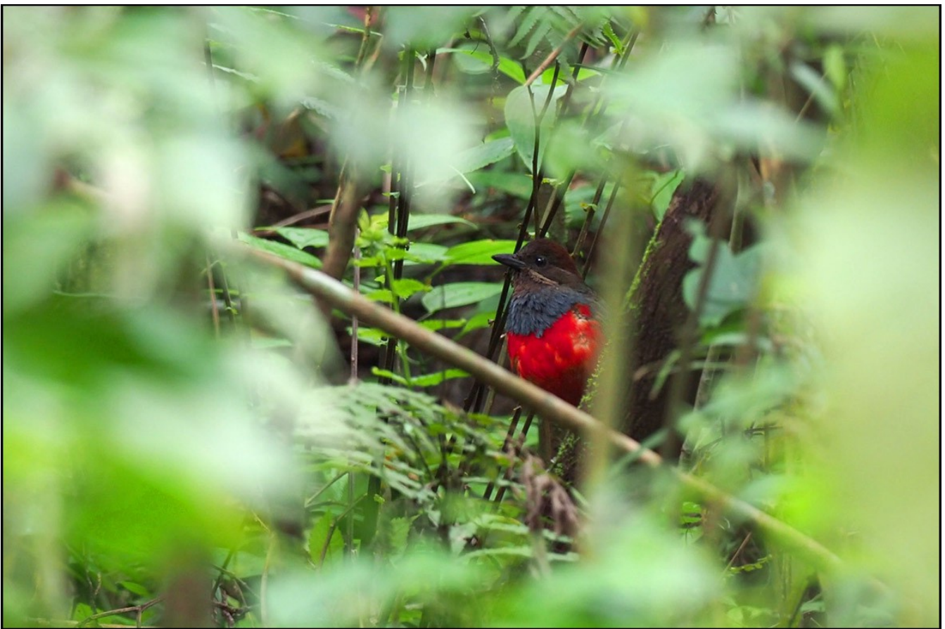
Bam! Whiskered Pitta Erythropitta kochi, Infanta Rd. MG.