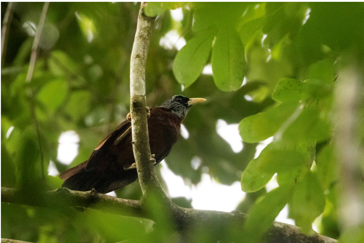
Capuchin Babbler