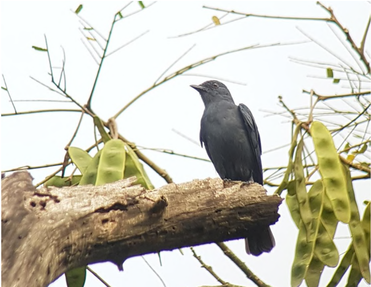
Nimba Flycatcher