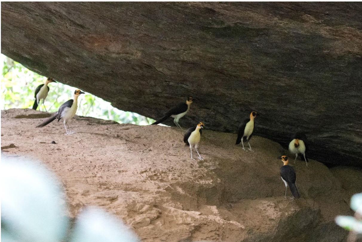
White-necked Rockfowl, 7 out of 10 birds in total