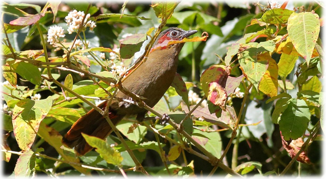
204. RED-FACED LIOCICHLA Liocichla phoenicea 2-4 birds, Dec 5 th and 3 on 7 th along the Frogmouth Trail at Mt Victoria.