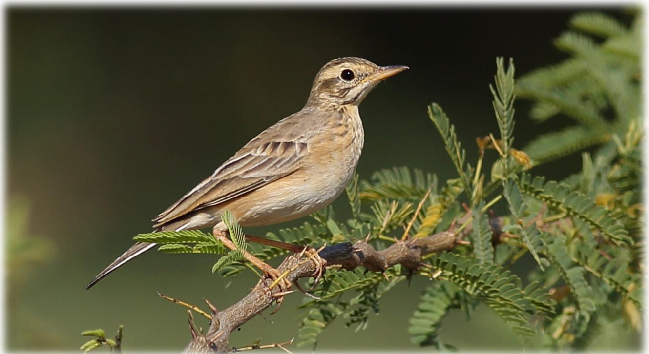
259. Paddyfield Pipit Anthus rufulus Common at Bagan.