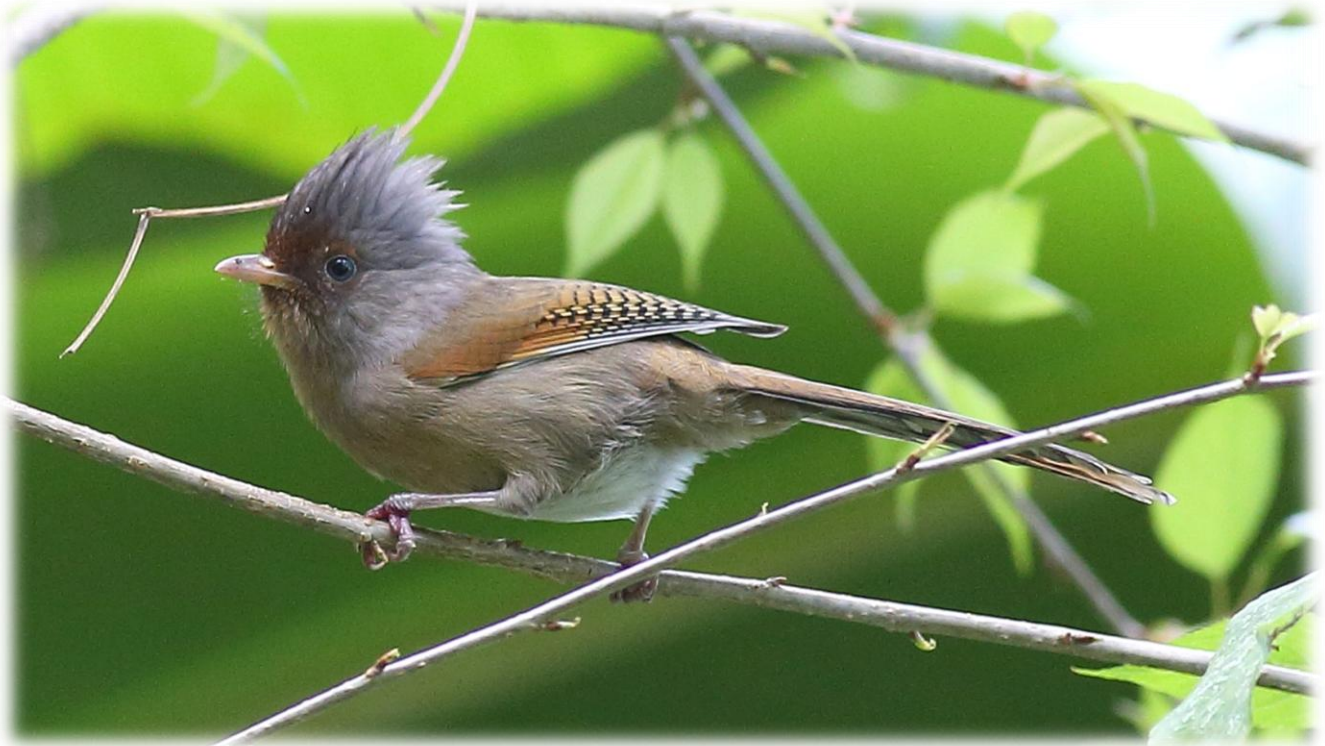
207. Rusty-fronted Barwing Actinodura egertoni 20+, Dec 4 th to 7 th , Mt Victoria.