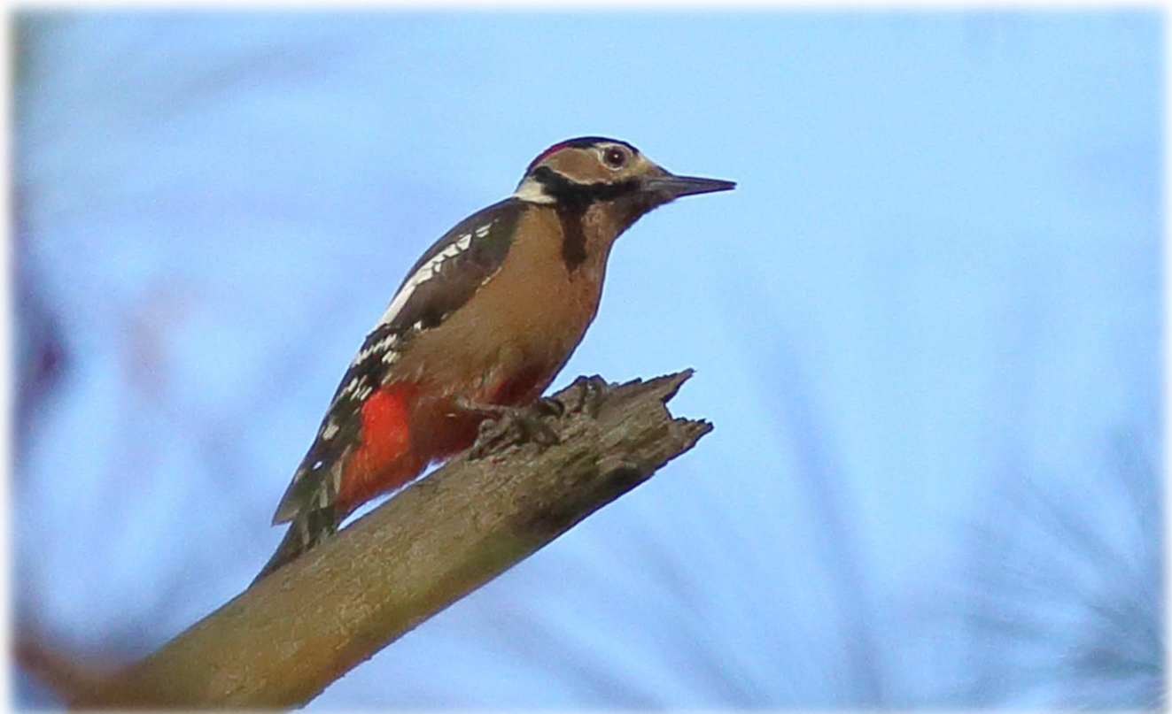
86. Great Spotted Woodpecker Dendrocopos major 1, Nov 29 th walking to Ye Aye Lake, Kalaw. Thought to be of ssp cabanisi Chinese Great spotted Woodpecker showing the dark greyish buff underparts and cheeks with a hint of red on the breast centre.