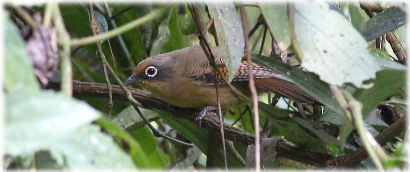
208. EASTERN SPECTACLED BARWING Actinodura radcliffei radcliffei 2, Nov 28 th and 29 th Kalaw at the same place. Located by voice, these were very skulking for the most part.

HBWA states; Hitherto treated as conspecific with A. ramsayi, but differs in its;