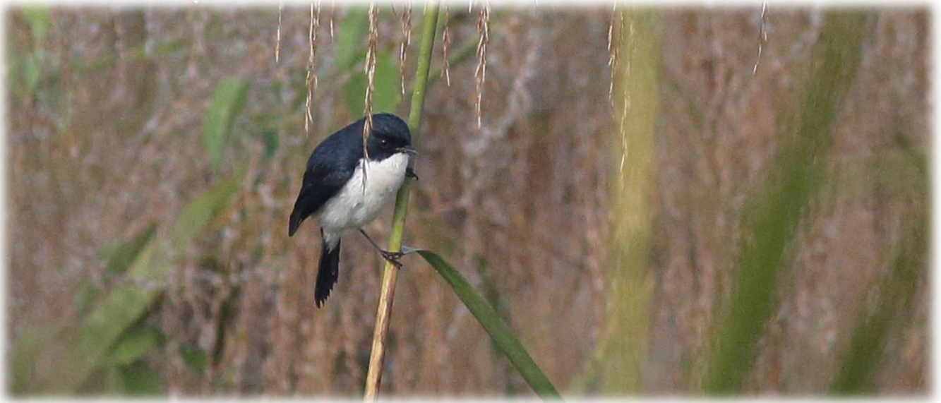
235. Jerdon's Bushchat Saxicola jerdoni 6+ birds at Inle Lake.