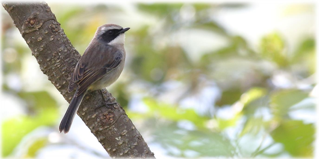
236. Grey Bushchat Saxicola ferreus Common at Mt Victoria at the lower altitudes near cultivation.