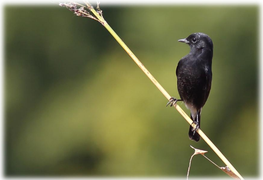
237. Pied Bushchat Saxicola caprata Common in the lowlands especially Bagan.