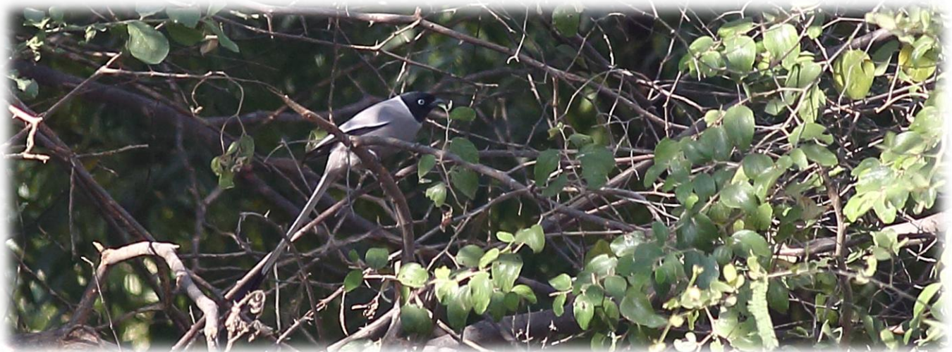
110. HOODED TREEPIE Crypsirina cucullata MYANMAR ENDEMIC 3 single birds seen in all around Bagan Dec 1 st , 2 nd and 9th. None of them showed for long and all were moving pretty fast through the trees staying quite well hidden.