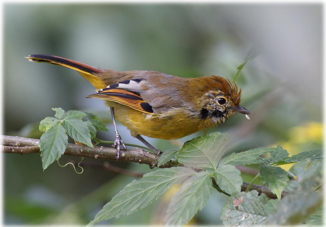
206. Bar-throated Minla Chrysominla strigula 24 birds noted in all on Mt Victoria.