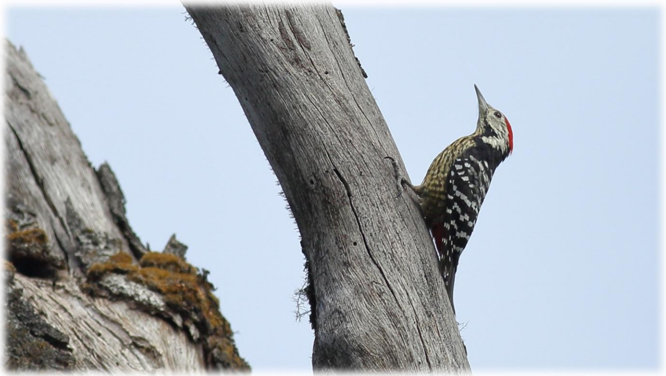
85. Stripe-breasted Woodpecker Dendrocopos atratus 2, Mt Victoria at c 2600m.