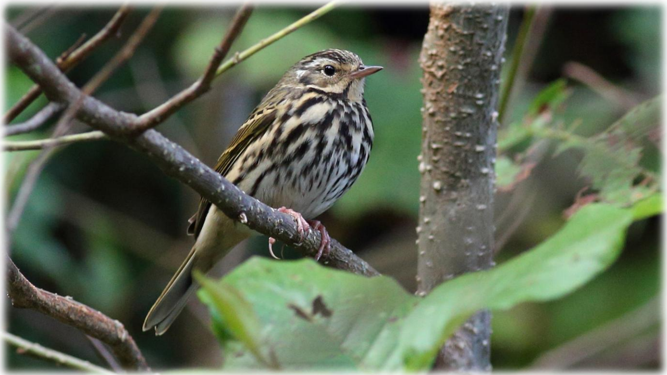
257. Olive-backed Pipit Anthus hodgsoni Small groups at most sites, but commonest at Mt Victoria where photod.