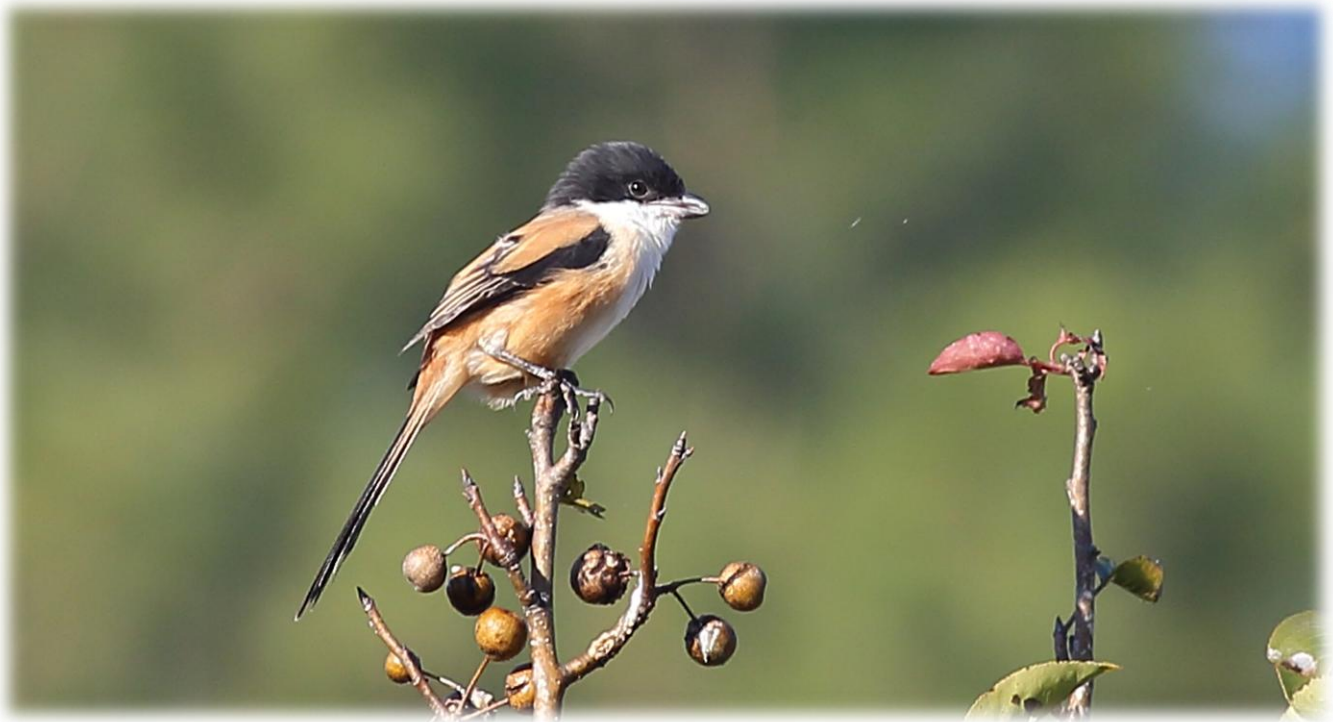
108. Long-tailed Shrike Lanius schach C10 birds in all including this bird at Kalaw, probably ssp tricolor.