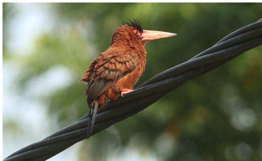
Purus Jacamar Galbalcyrhynchus purusianus

Breakfast at nearby hotel Hiuta at 6.30 am. From 7.30 to 10 am we birded the area of La Cachuela. Finally great opportunities to photograph Purus Jacamar .