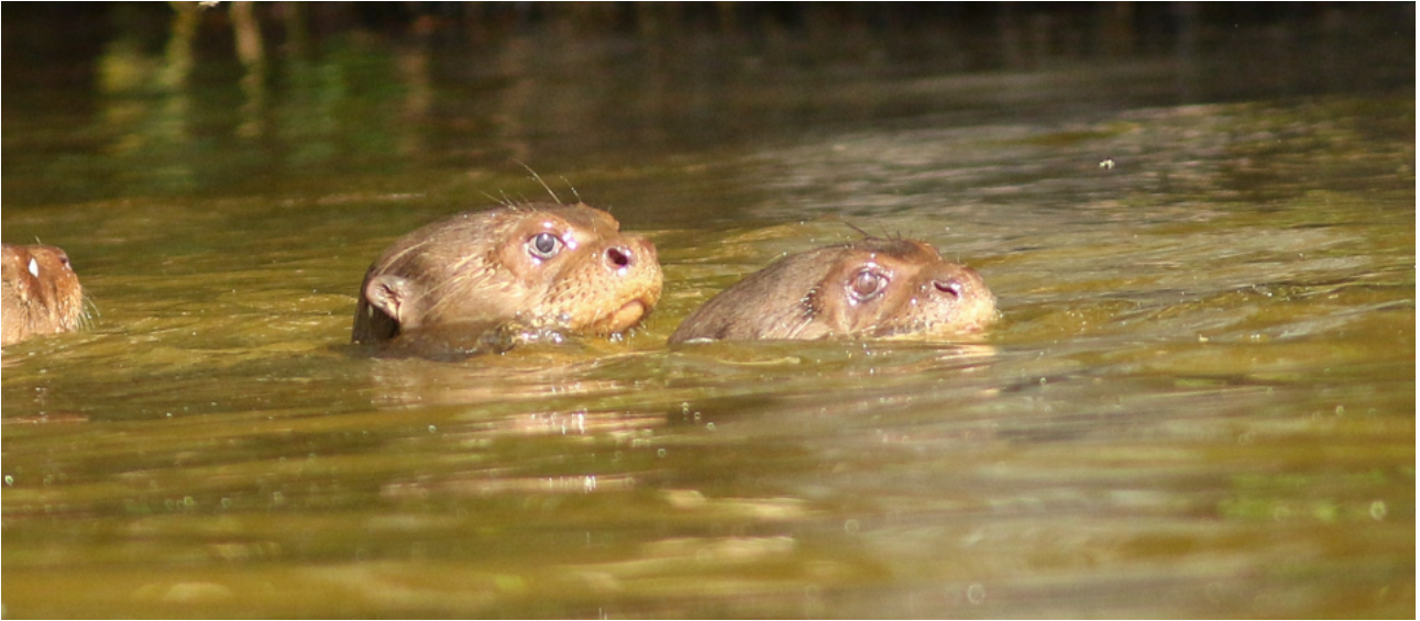
Giant River Otter