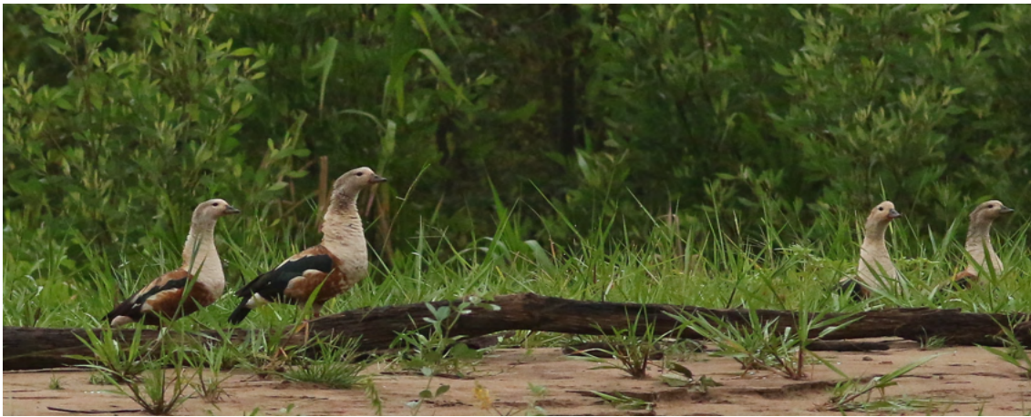
Orinoco Goose Neochen jubata

At dawn we took a boat upstream to a clay lick area. Along the way we observed some heron species but the highlight, at least for me, was a family of Orinoco Geese on a sand bank along the river.