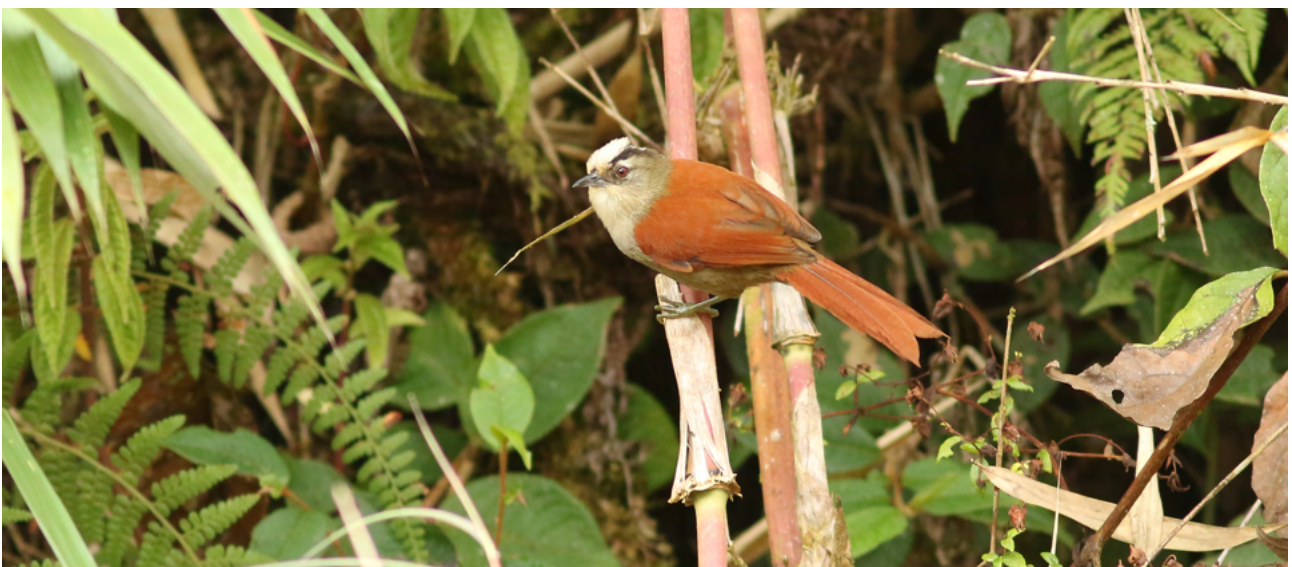
Marcapata Spinetail Craniol e uca marcapatae weskei – Peruvian endemic The subspecies weskei differs significantly from the nominate form.