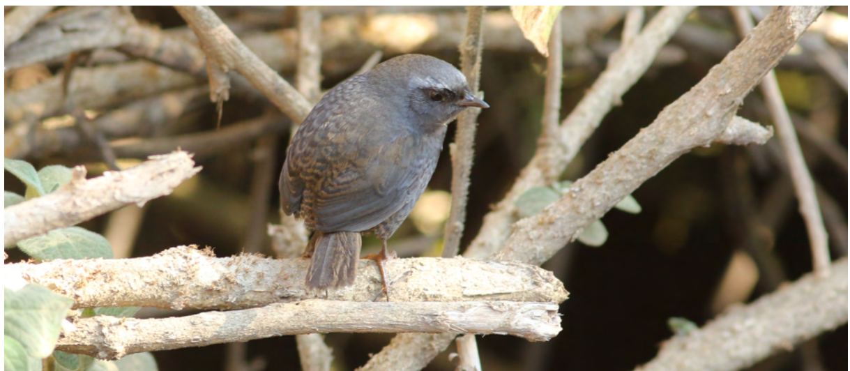
Ampay Tapaculo Scylatopus whitneyi – Peruvian endemic