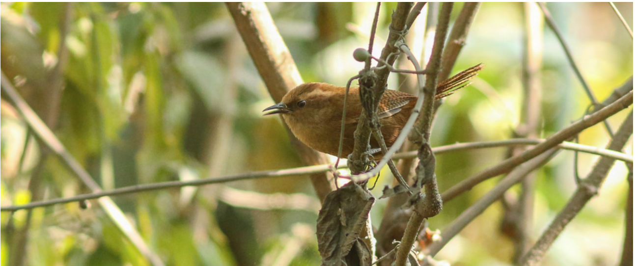
Fulvous Wren Cinnycerthia fulva