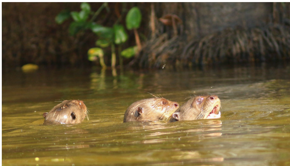
Giant River Otter – Pteronura brasiliensis