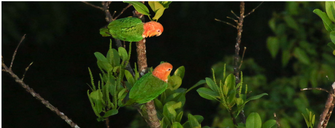
White-bellied Parrot Pionites leucogaster