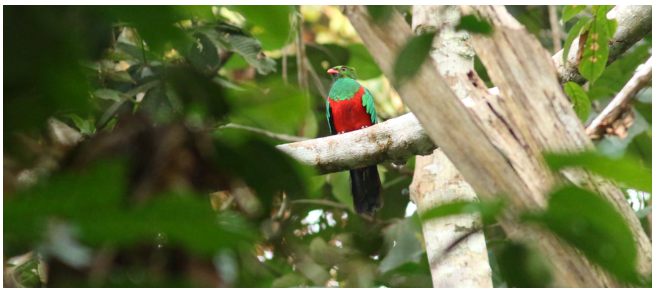
Pavonine Quetzal Pharomachrus pavoninus

When we hit the trails again after lunch we encountered two most-wanted species. First we observed a Peruvian Recurvebill , perched in a thick bamboo patch and only from a certain point you had unobstructive views of the bird. Late afternoon Alex suddenly heard a Pavonine Quetzal call and soon we had great views of a male in the canopy. (-12.5623, -70.0934)