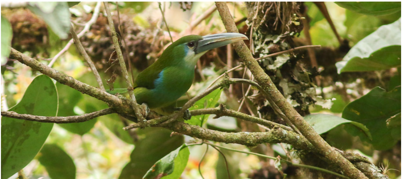
Blue-banded Toucanet – Aulacorhynchus coeruleicinctis