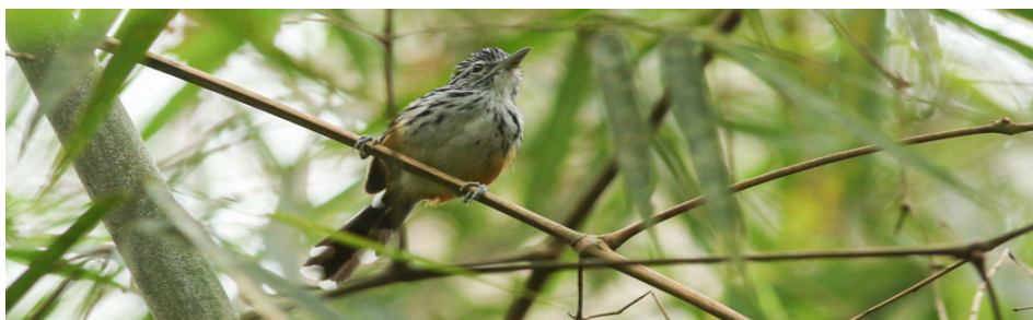
Striated Antbird Drymophila devillei

After lunch we spent all afternoon on the trails around Chunchu Lodge. A Tinamou flushed just next to the trail was most likely a White-throated Tinamou according to Alex. During our walk we found a very responsive Striated Antbird which showed itself beautifully but the highlight this afternoon were not doubt the Black-spotted Bare-eyes we saw. No less than four birds were seen and this normally rather skulking species gave some astonishing views.