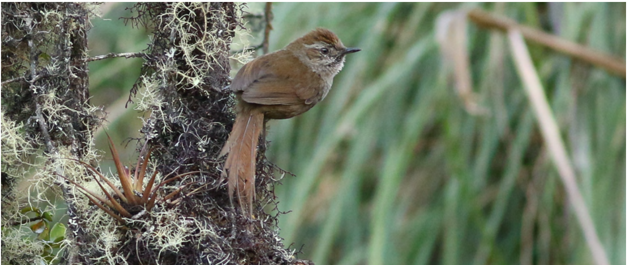
Puna Thistletail Schizoeaca helleri