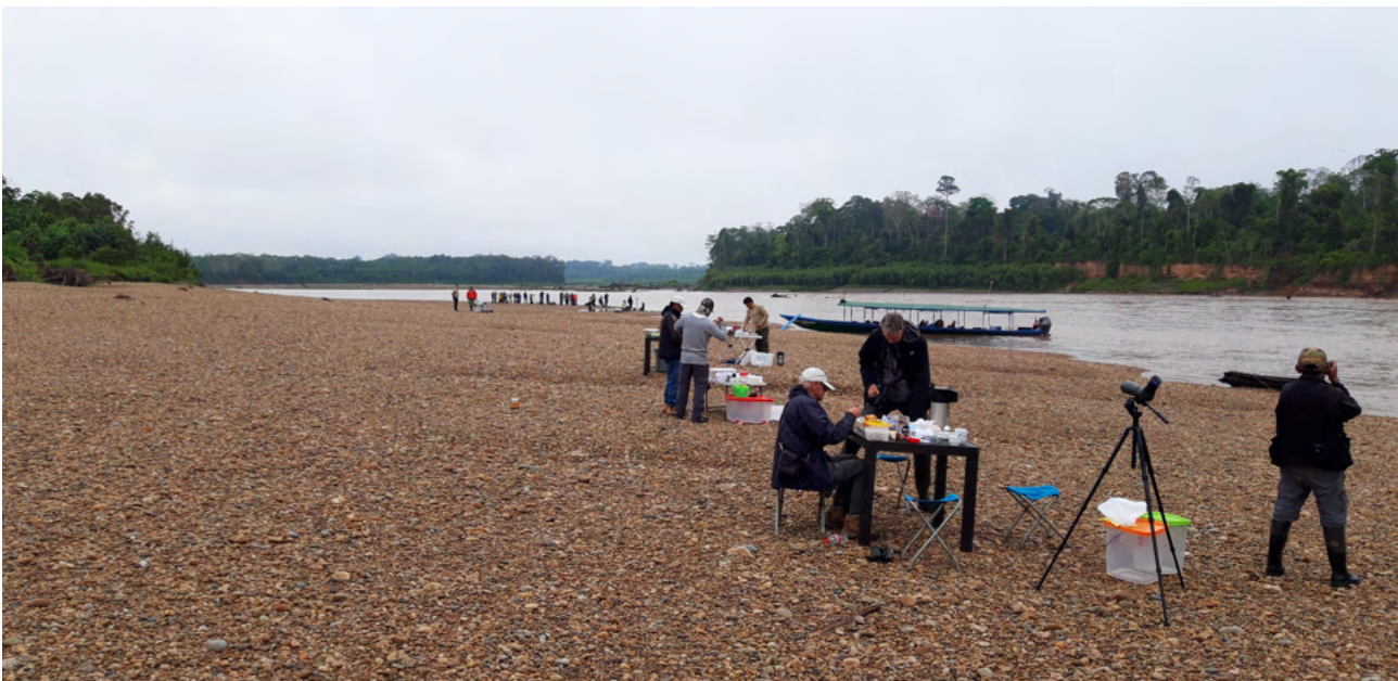
Gravel bank opposite of the clay lick

We arrived at a gravel bank where we embarked from our boat. Just opposite of the gravel bank was the clay lick area for visiting parrot and macaw species. One of the crew members on board loaded a table and some chairs from the boat on the gravel bank and prepared our breakfast while we put up our scope on to the clay lick area. What a luxury. The next hour more boats with tourists arrived on the scene to witness the spectacle of parrots and macaws visiting the clay lick area.