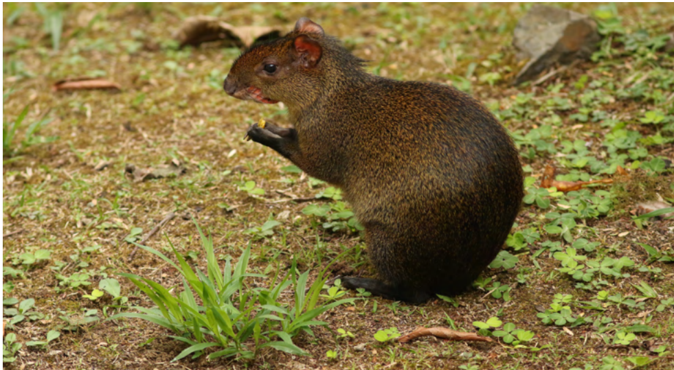
Brown Agouti – Dasyprocta variegata