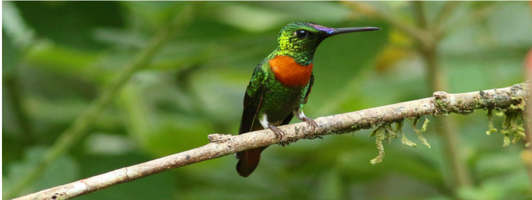
Gould's Jewelfront Heliodoxa aurescens