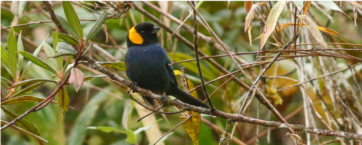
Yellow-scarfed Tanager Iridosornis reinhardti – Peruvian endemic