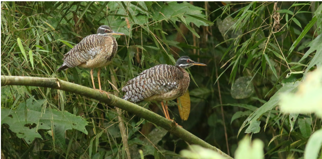
Sunbitters Eurypyga helias

After lunch we spent all afternoon on the trails around Chunchu Lodge. A Tinamou flushed just next to the trail was most likely a White-throated Tinamou according to Alex. During our walk we found a very responsive Striated Antbird which showed itself beautifully but the highlight this afternoon were not doubt the Black-spotted Bare-eyes we saw. No less than four birds were seen and this normally rather skulking species gave some astonishing views.