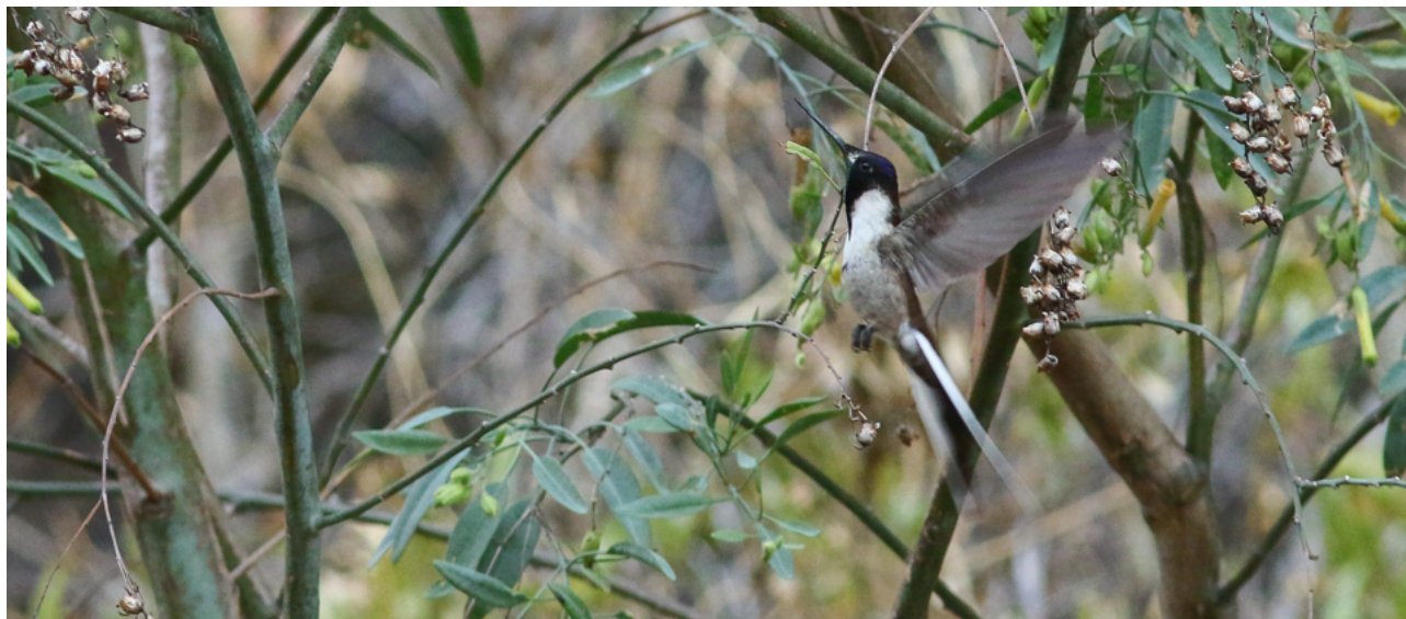
Bearded Mountaineer Oreonympha nobilis – Peruvian endemic