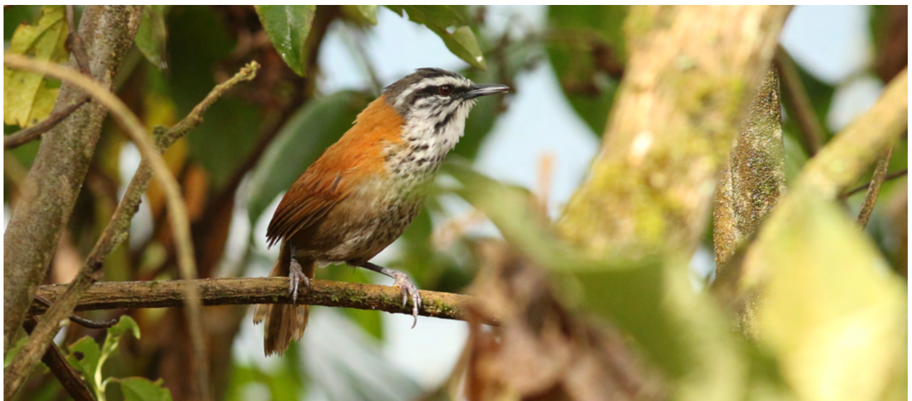
Inca Wren Thryothorus eisenmanni