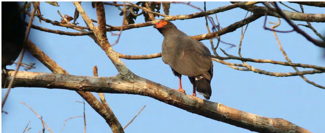
Slate-colored Hawk Leucopternis schistaceus

From the tower we observed some parrot and macaw species at eye-level, a pair of Slate-colored Hawks , Black-tailed Tityra and Yellow-tufted Woodpecker .