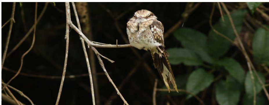
Ladder-tailed Nightjar Hydropsalis climacocerca

In the morning we walked to an oxbow lake and made a boat trip on this lake. We had fantastic views of Ladder-tailed Nightjar along the edge of the lake. (-12.5709, -70.0809)