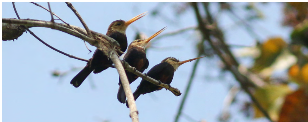
White-throated Jacamar Brachygalba albogularis

After lunch we birded the area around the guesthouse. We had fine views of a White-bellied Tody-Tyrant and around the lodge we observed a family of White-throated Jacamars .