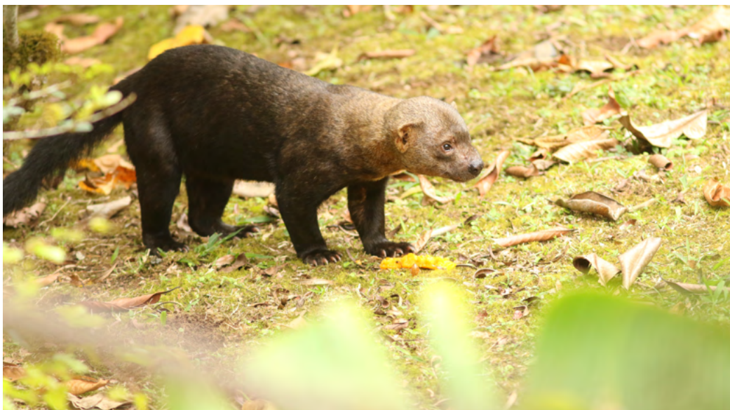
Tayra – Eira barbara