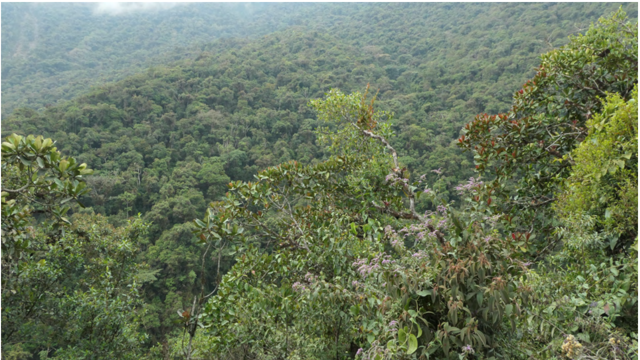
Undisturbed habitat along Manu Road.

Night: Cock-of-the-Rock Lodge, Manu Road.