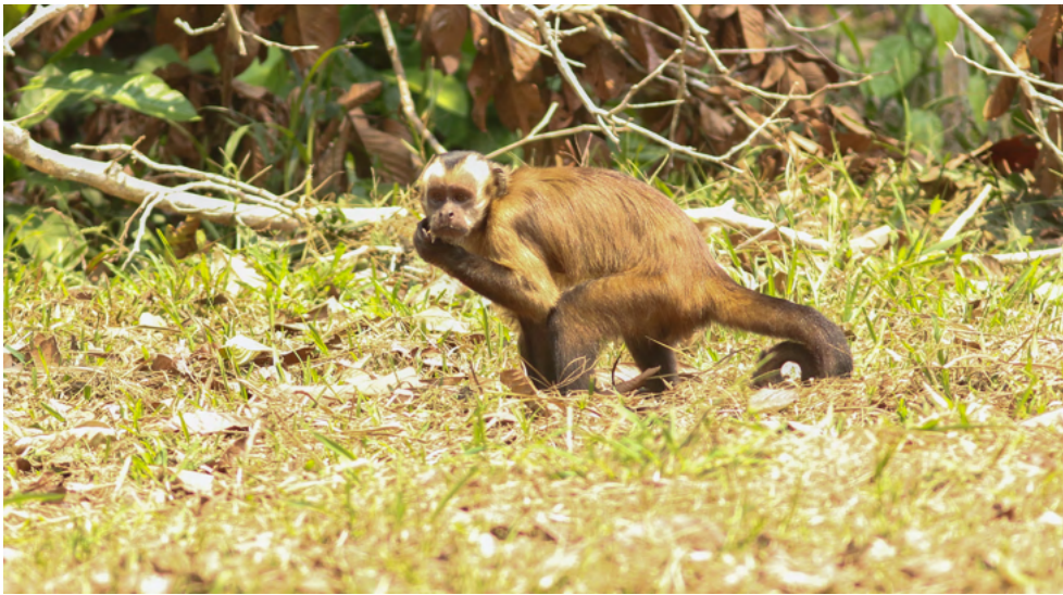
Black-capped (Brown) Capuchin Monkey – Sepajas apella