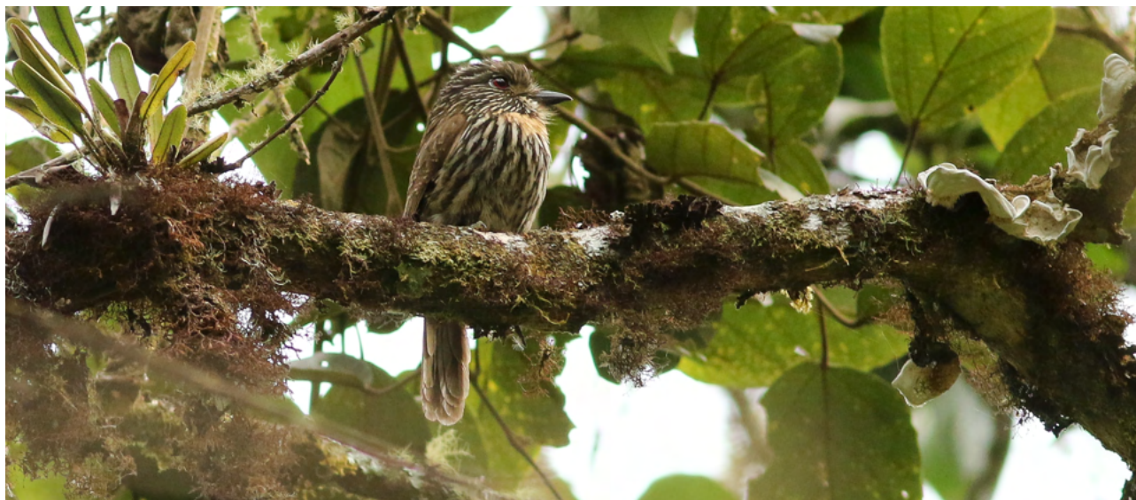
Black-streaked Puffbird Malacoptila fulvogularis

A highlight was the splendid observation of a Black-streaked Puffbird . (-12.9750, -72.5302)