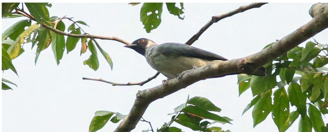
Black-faced Cotinga Conioptilon mcilhennyi

It did not take long before we scored one of our main targets of the area, Black-faced Cotinga . (-12.5694, -70.0976)