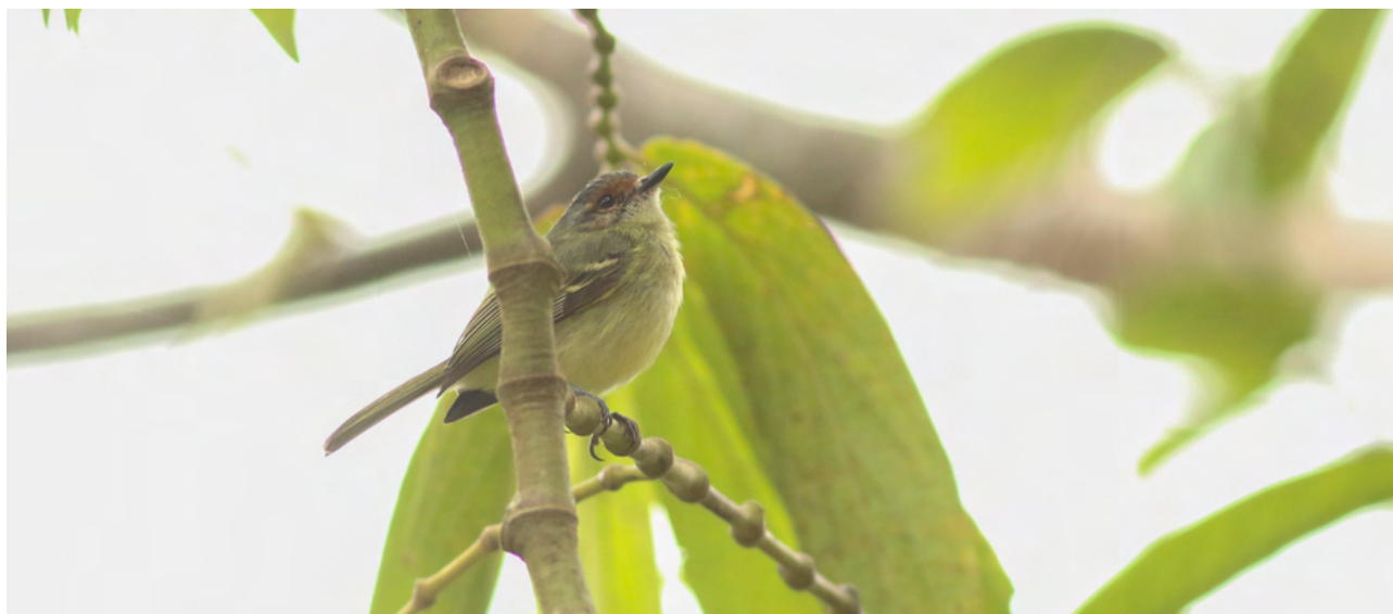
Cinnamon-faced Tyrannulet Phylloscartes parkeri

Best species seen that morning was a Cinnamon-faced Tyrannulet (-71.5324) which gave great views and two Red-tailed Tyrants .