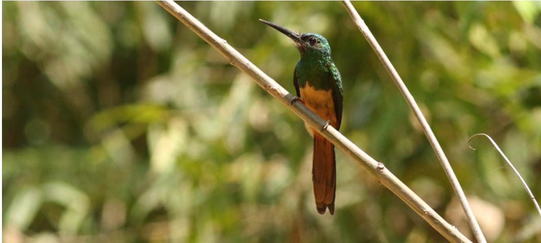
Bluish-fronted Jacamar Galbula cyanescens