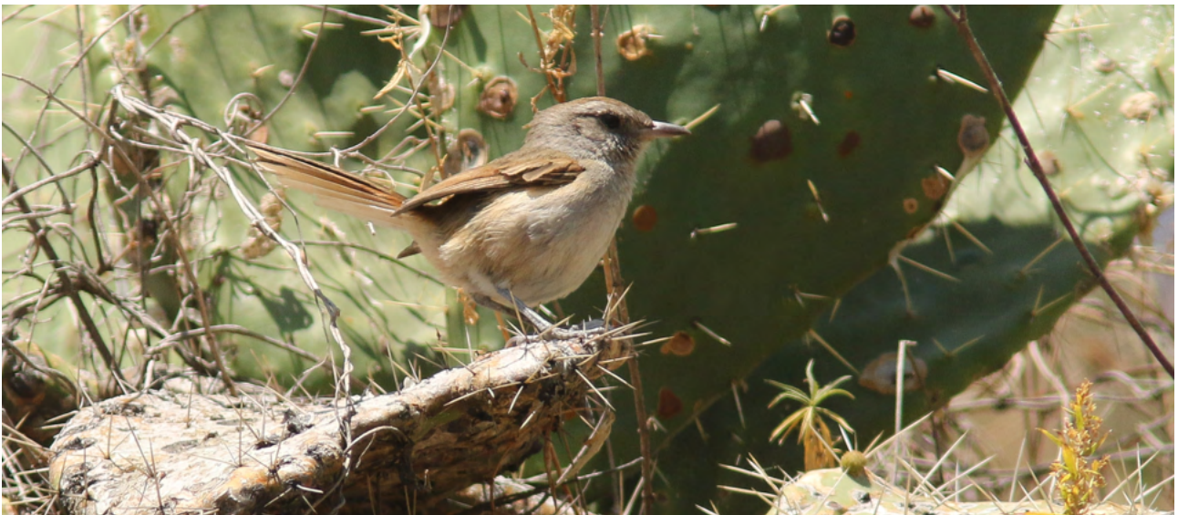
Pale-tailed Canastero Asthenes huancavelicae usheri – Peruvian endemic

It did not take long before we had great views of our main target, the "white-tailed form" of the Pale-tailed Canastero . (-13.5040, -72.4731)