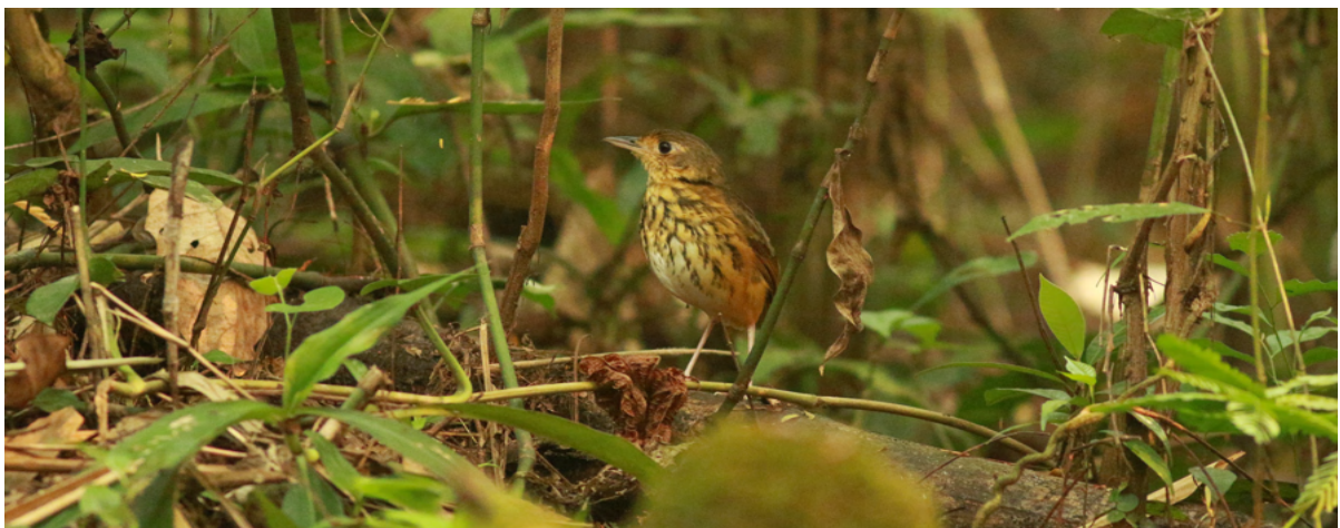
Amazonian Antpitta Hylopezus berlepschi

When we were all in position the owner started to play the advertising call of the antpitta and it did not take long before we had great views of an individual which walked in to feast on the exposed worms.