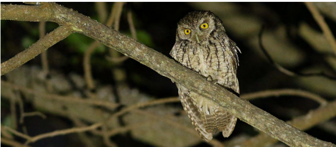
Koepcke's Screech Owl Megascops koepckeae hockingi