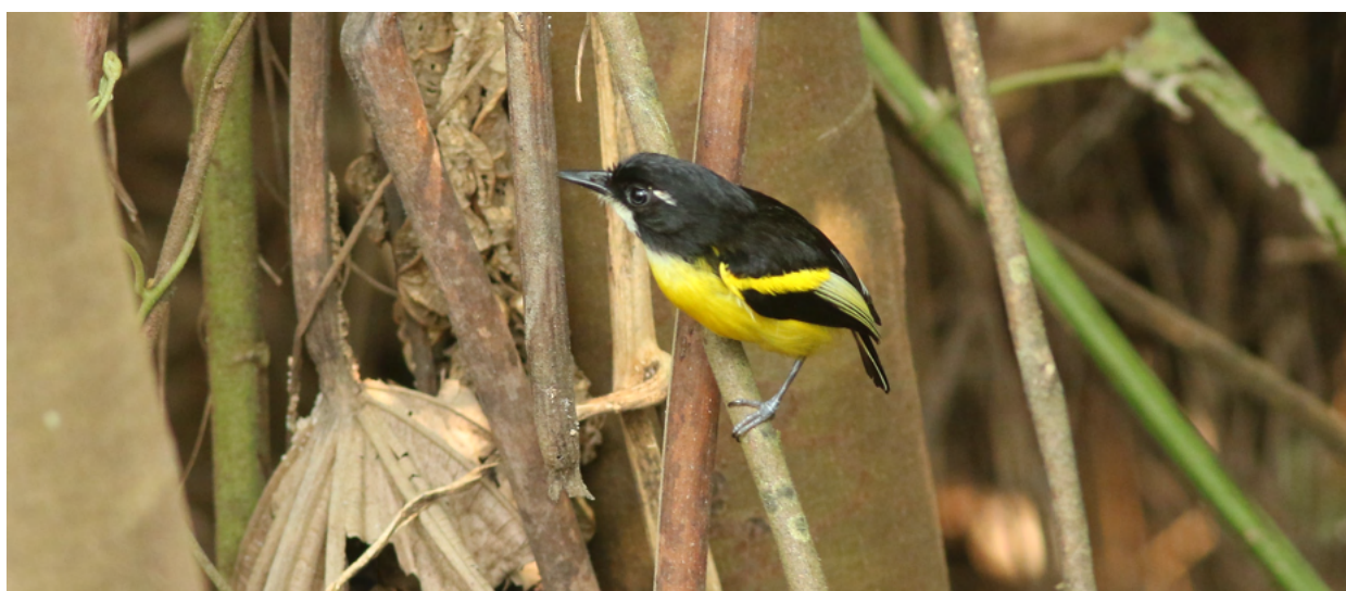
Black-backed Tody Flycatcher Poecilatriccus pulchellus – Peruvian endemic

And some time later we had brief but fine views of a skulking Black-backed Tody Flycatcher in another bamboo patch along the road.