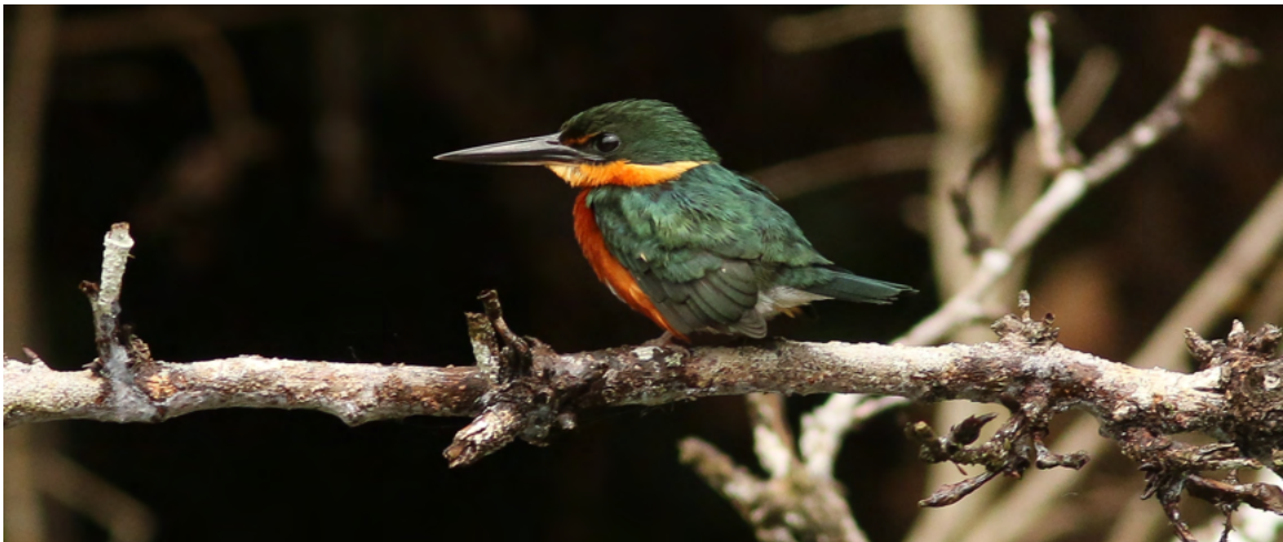
American Pygmy Kingfisher Chloroceryle aenea

We observed some waterbirds and heron species. Fine views of Green Ibis , Hoatzin and an obliging American Pygmy Kingfisher .