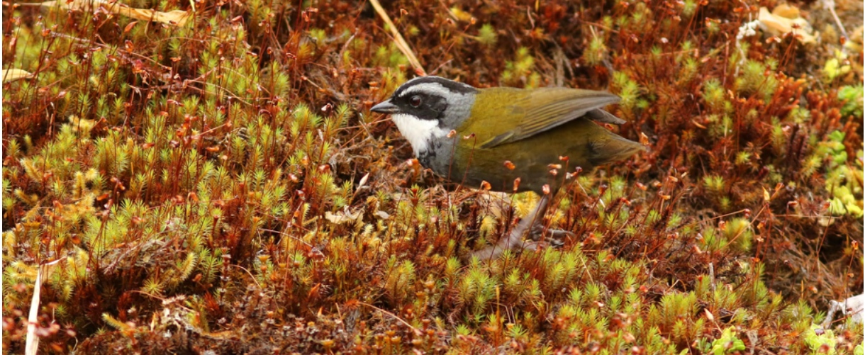
Grey-browed Brushfinch Arremon assimilis