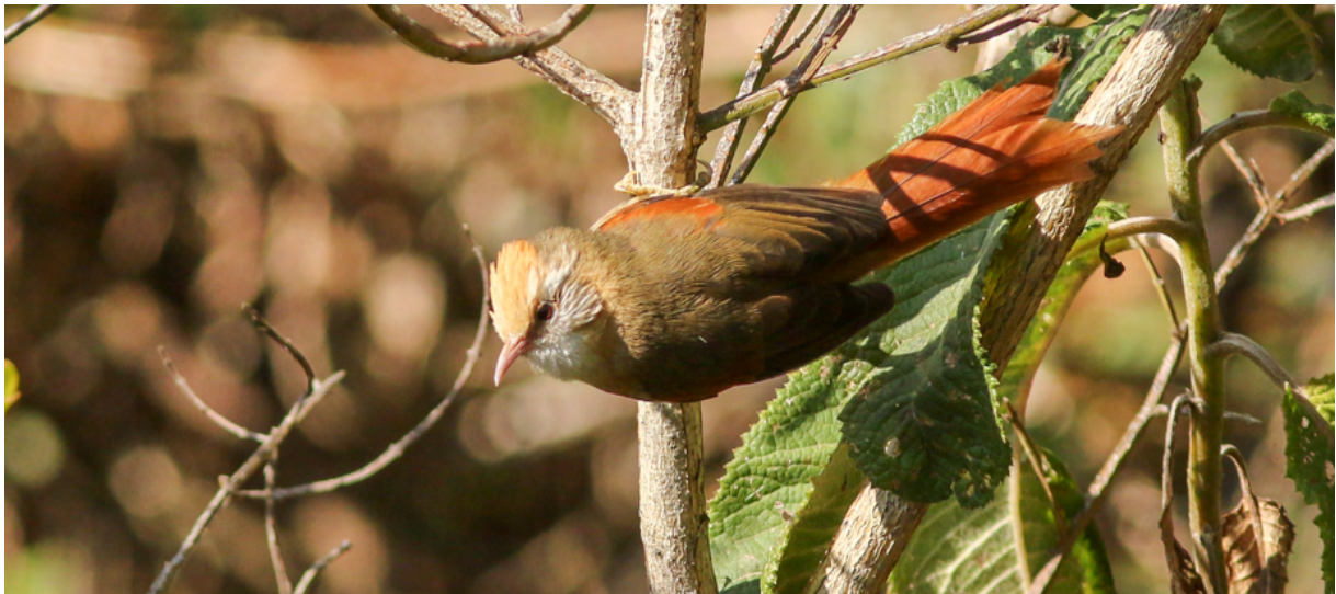
Creamy-crested Spinetail Cranioleuca albicapilla – Peruvian endemic