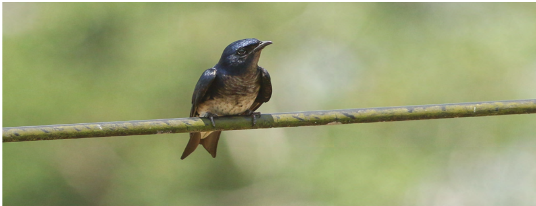
Southern Martin Progne elegans – a migrant from the south