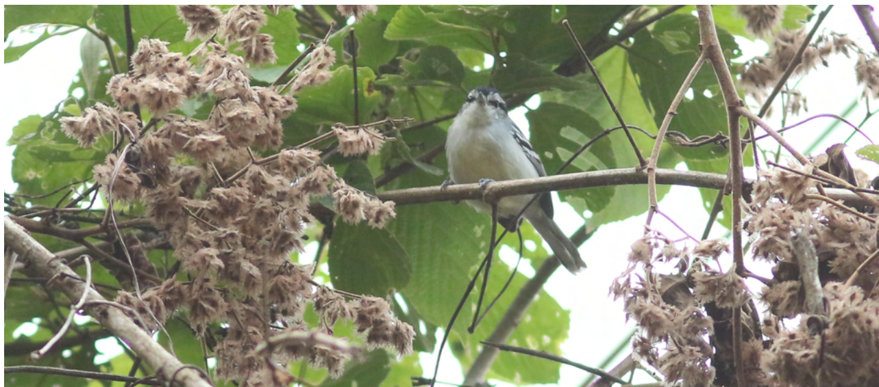
Creamy-bellied Antwren Herpsilochmus motacilloides – Peruvian endemic