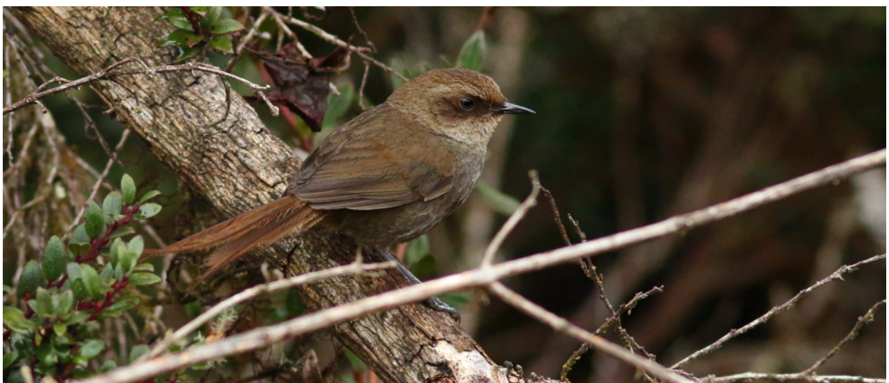
Vilcabamba Thistletail Schizoeaca vilcabambae – Peruvian endemic