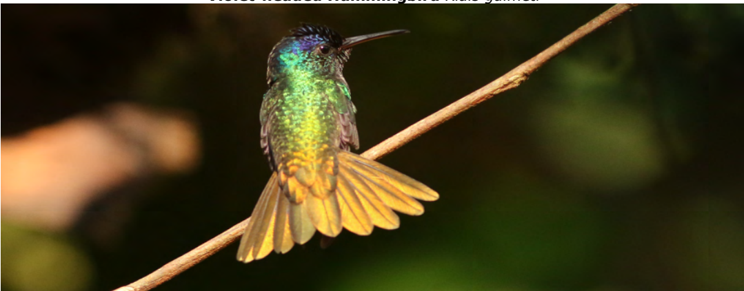
Golden-tailed Sapphire Chrysuronia oenone