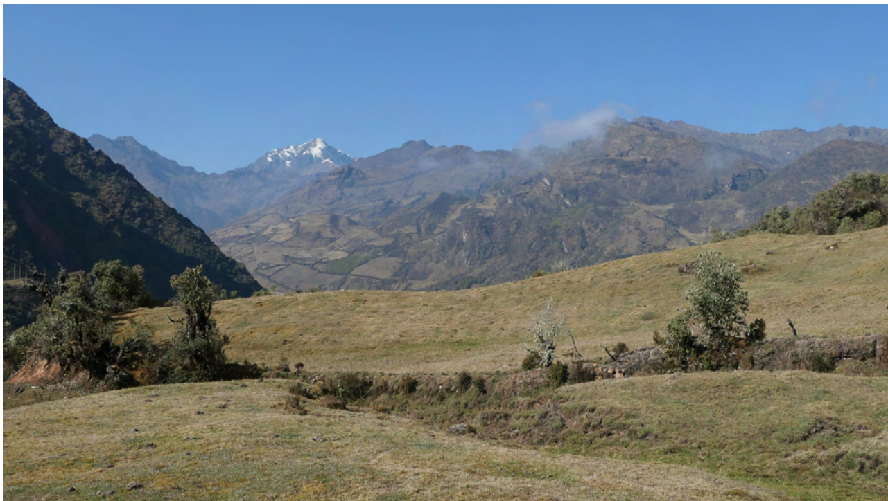
Pass above Old Vilcabamba

So after (again) an early breakfast we drove along the CU-870 with all our luggage to the pass above Old Vilcabamba.