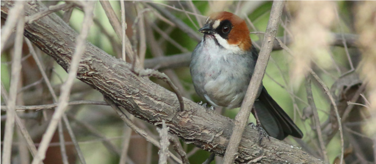
Apurimac Brushfinch – Peruvian endemic

Some other species seen that morning included Plain-breasted Hawk , the uncommon White-throated Hawk and a fine Cinereous Harrier that drifted by at close range. Some Andean Geese , Andean Lapwings , a single Spot-billed Ground Tyrant , Rufous-naped Ground Tyrant , Black-billed Shrike Tyrant and some Streak-throated Bush Tyrants were observed along the higher part of the road.