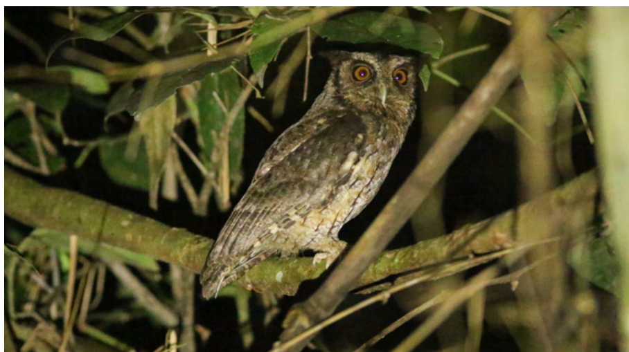
Tawny-bellied Screech-Owl Megascops watsonii

Some of the notable species seen that afternoon were Bare-necked Fruitcrow , Purple-throated Fruitcrow , a male Cinereous Mourner , and our only White-lined Tanager of the trip. We returned to the lodge at dusk and close to the lodge we had fabulous views of a (Southern) Tawny-bellied Screech-Owl . (-12.8735, -69.4980) Night: Chunchu Lodge