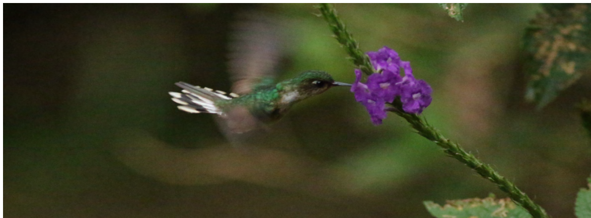
Peruvian Piedtail Phlogophilus harterti – Peruvian endemic