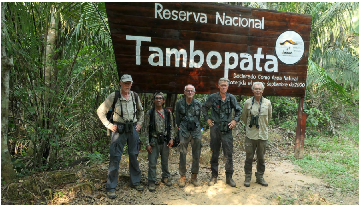
20 September 2022, Reserva Nacional Tambopata

Arrival at Schiphol Airport, Amsterdam at 4 pm. Took the train home where I arrived at 7 pm.