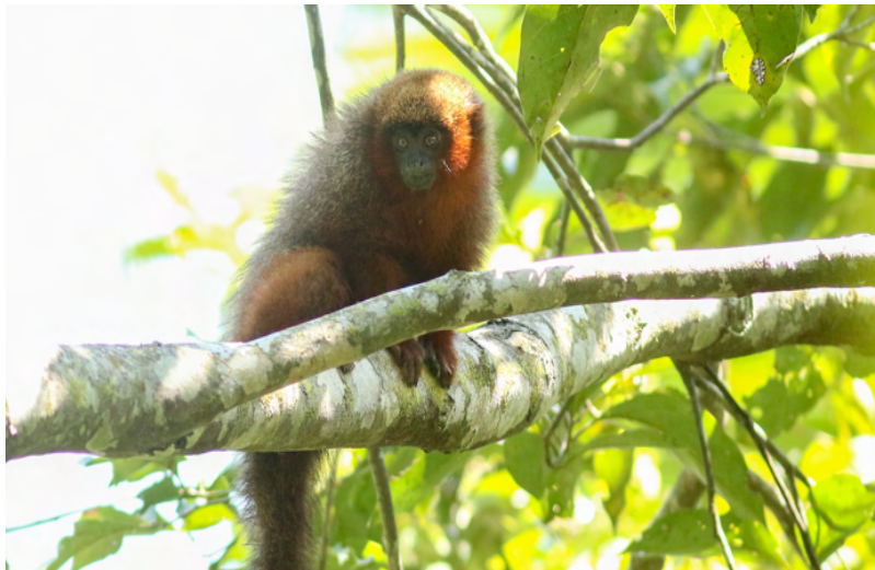
Toppin's Brown Titi-Monkey – Plecturocebus toppini