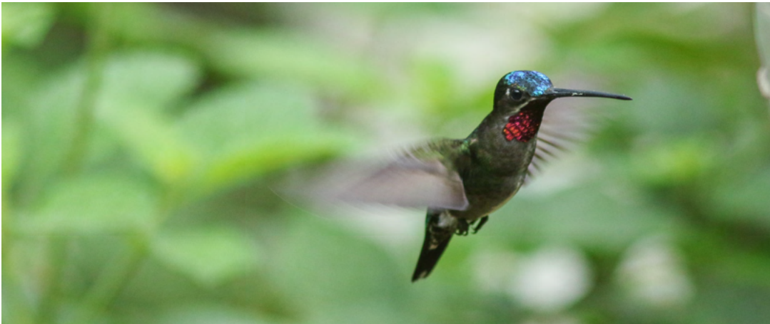
Long-billed Starthroat Heliomaster longirostris