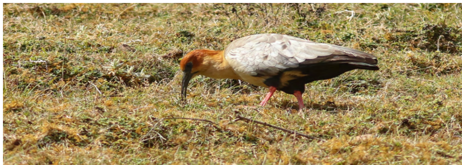
Andean Ibis Theristicus branickii

After lunch somewhere along the road we drove straight to Ipal Lodge, Sicre, where we arrived at 3 pm. From 4 to 6.45 pm we birded the same forest patch we visited on August 28.