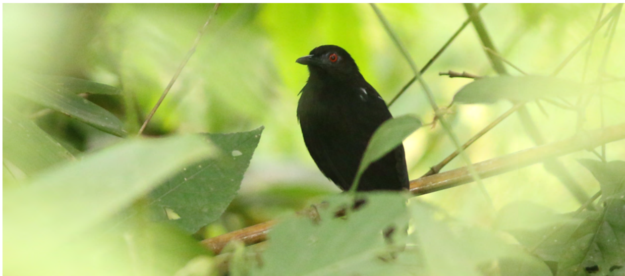
Goeldi's Antbird Myrmeciza goeldii

And some time later we had brief but fine views of a skulking Black-backed Tody Flycatcher in another bamboo patch along the road.