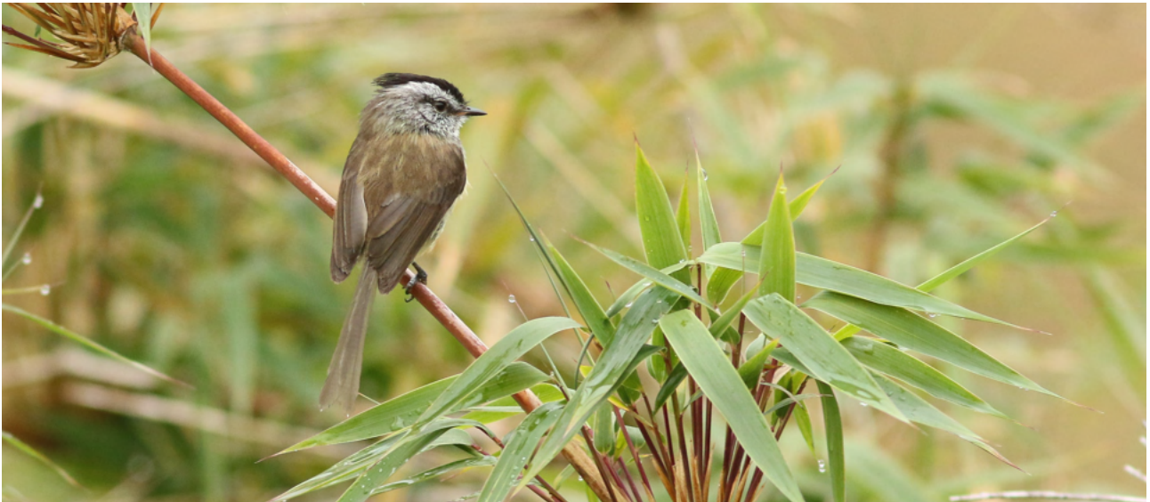
Un-streaked Tit Tyrant Anairetes agraphia – Peruvian endemic

Other nice species seen during this very productive day in the area above Vilcabamba include Great Sapphirewing , Violet-throated Starfrontlet (subspecies albicauda ), Amethyst-throated Sunangel , Sapphire-vented Puffleg (subspecies sapphiropygia ), Purple-backed Thornbill , Scaled Metaltail , Rufous-capped Thornbill , White-throated Hawk , Bar-bellied Woodpecker , the very distinctive subspecies weskei of Marcapata Spinetail , Pearled Treerunner , views of Trilling Tapaculo , fine views of Lulu's Tody-Flycatcher , Bolivian Tyrannulet , great views of the uncommon endemic Un-streaked Tit Tyrant (-12.9825, -72.9752), Ochraceous-breasted Flycatcher , Brown-backed Chat-Tyrant , Streak-throated Bush Tyrant , Red-crested Cotinga , Pale-footed Swallow , Inca Wren , Cuzco Brushfinch , Grey-browed Brushfinch , Spectacled Whitestart , Blue-backed Conebill , Grass-green Tanager , Drab Hemispingus , Three-striped Hemispingus , Rust-and-yellow Tanager , Hooded Mountain Tanager , fantastic views of a flock of Yellow-scarfed Tanagers , Chestnut-bellied Mountain Tanager , Lacrimose Tanager , Golden-collared Tanager , Tit-like Dacnis , Plushcap , Moustached Flowerpiercer , Black-throated Flowerpiercer and Masked Flowerpiercer .