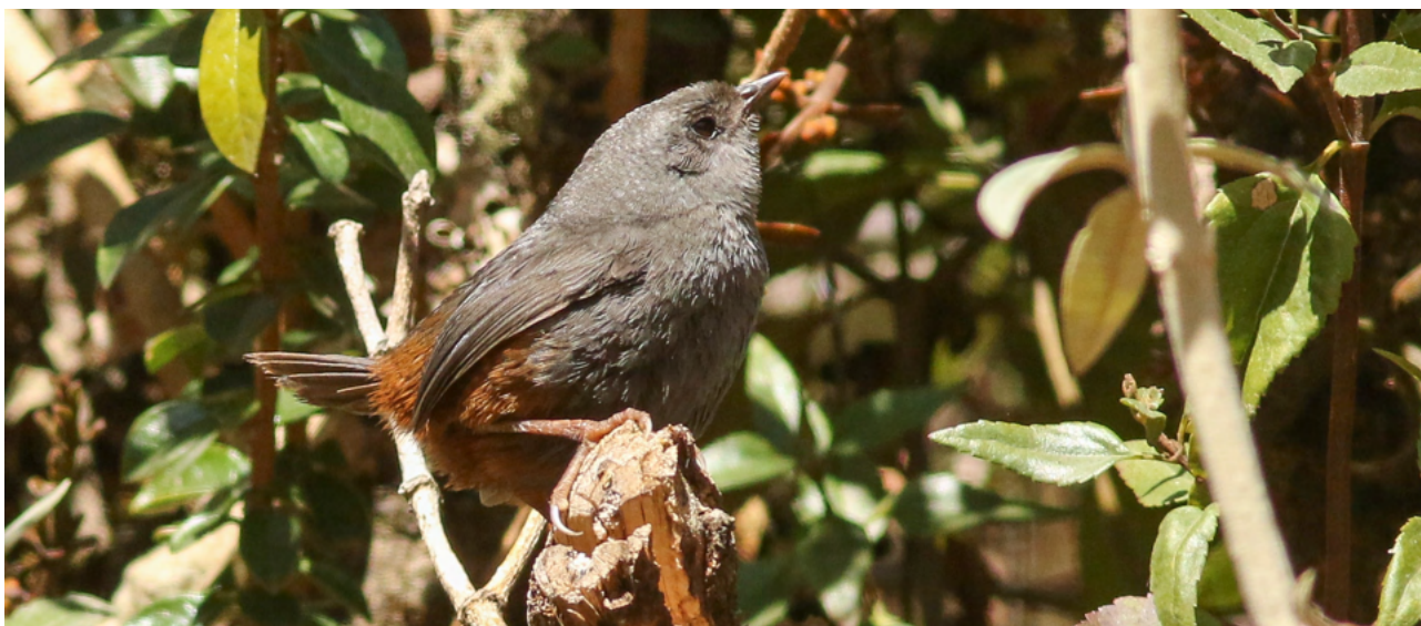
Vilcabamba Tapaculo Scytalopus urubambae -Peruvian endemic

We saw a few Peruvian Sierrafinches and a female Great Sapphirewing when we heard our main target, Vilcabamba Tapaculo . Despite the fact that many hikers (it was week-end) used the trail to walk further up into the mountains, a little playback gave an amazing response and incredible fine views of a Vilcabamba Tapaculo . (-13.3943, -72.5750) Several more birds were heard that morning along the trail. Our morning walk also gave us more common species like Cream-winged Cinclodes , Ash-breasted Sierrafinches and Plumbeous Sierrafinches .