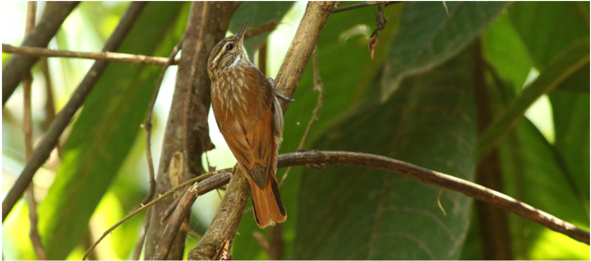
Slender-billed Xenops tenuirostris

At 9.30 we started to bird along the main road, just outside of the hummingbird garden. Here we scored two rare species. First we unexpectedly bumped into a very cooperative Slender-billed Xenops which gave amazing and close views ( -12.9034, -71.3742 ) and afterwards two Plain Softtails ( -12.9058, -71.3771 ) obliged.