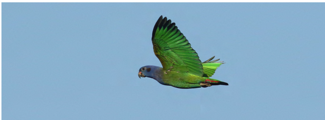
Blue-headed Parrot Pionus menstruus