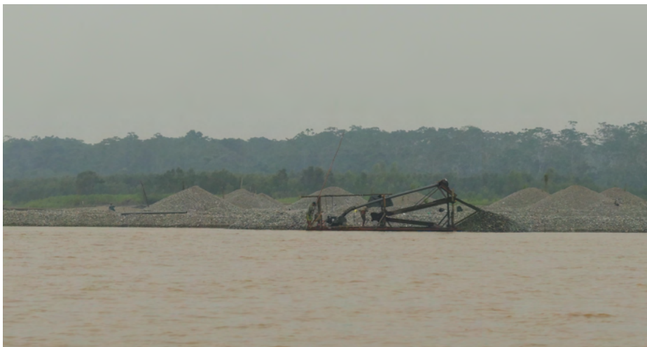
Gold digging activity along the Rio Madre de Dios.

During our boat trip to Los Amigos we witnessed the destruction of the shores of the Madre de Dios by gold diggers/miners. For me the highlight was the observation of several Sand-coloured Nighthawks .