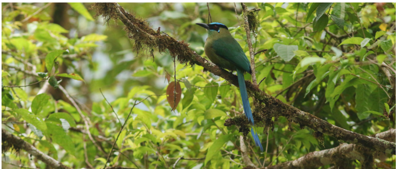
Andean Motmot – Momotus aequatorialis