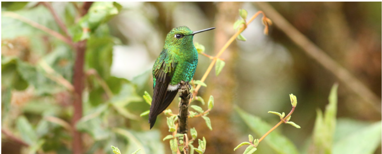
Sapphire-vented Puffleg Eriocnemis luciani sapphiropygia

White-faced Nunbird was heard but unfortunately too far to have a realistic chance to observe the bird. On our way back down to Vilcabamba suddenly a Curve-billed Tinamou crossed the road just in front of our car and was seen by the ones who were in a favourable position in the car and reacted quickly! Night: Hostal El Refugio de Manco Inka, Vilcabamba.