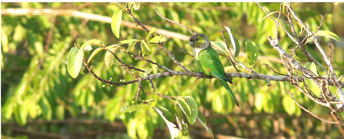
Black-capped Parakeet Pyrrhura rupicola

After our visit to the tower we walked the trails until noon. Highlight was the observation of a pair of Pale-winged Trumpeters , a most wanted species for all of us and we had low expectations that we would still encounter that species on this trip. So this was a big relief.