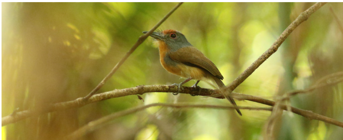
Rufous-capped Nunlet Nonnula ruficapilla

In a bamboo patch we had exceptional, close views of a Rufous-capped Nunlet low down in the bamboo and shortly after a Yellow-billed Nunbird showed up. (-12.5645, -70.0987)