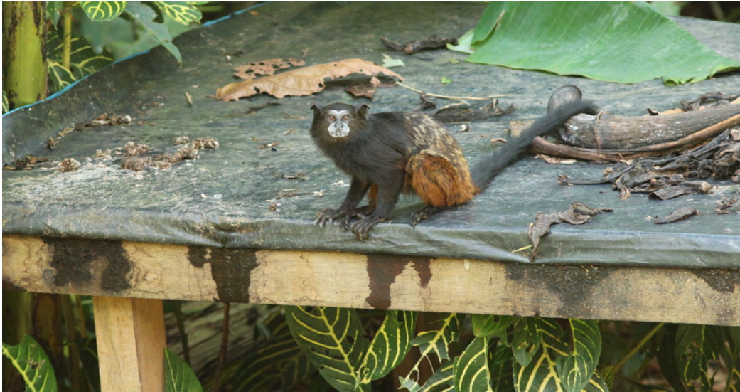
Weddel Saddle-backed Tamarin – Saguinus weddelli weddelli