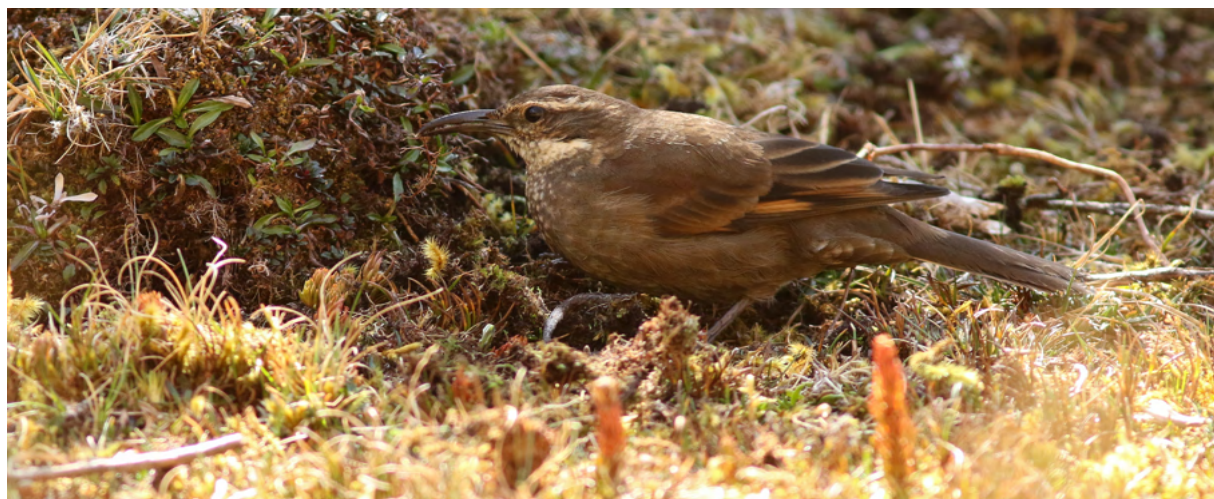
Royal Cinclodes Cinclodes aricomae

First we started with poor views of a Blue-mantled Thornbill but soon we found Line-fronted Canastero, Tawny Tit-Spintail, White-browed Tit-Spintail, Puna Tapaculo, Ash-breasted Tit Tyrant , several Stripe-headed Antpittas and best of all a Royal Cinclodes , which was located by Alex while he checked an isolated patch of polylepis forest. Slowly we crept up to the spot and we all had exceptional and close views of this rare encountered species. (-13.1469, -72.3047)