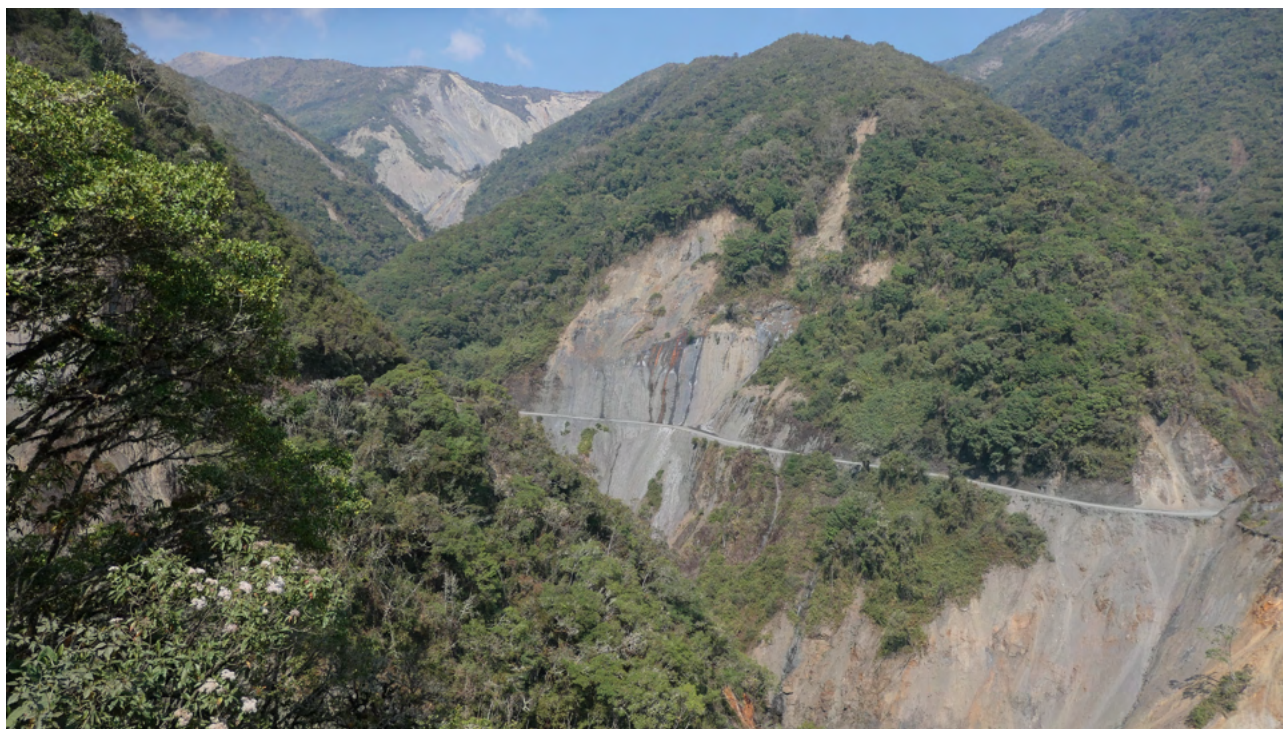
Upper part of Manu Road.

We left Waycecha Lodge at 5.30 am and we birded all day the stretch of Manu Road between Waycecha Lodge and Cock-of-the-Rock Lodge. We had lunch in the field along Manu Road.