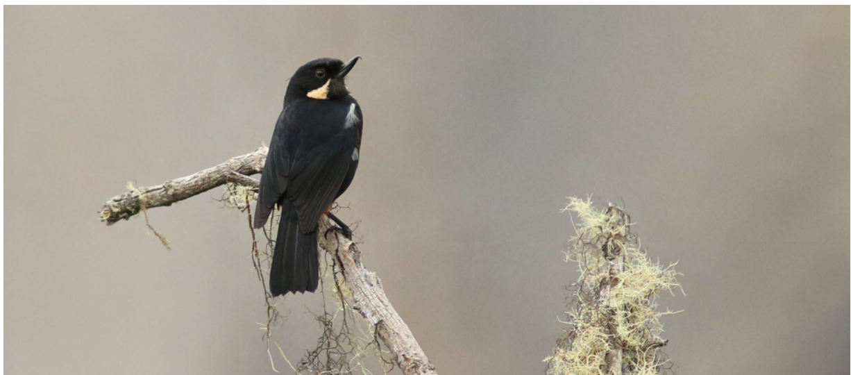
Moustached Flowerpiercer Diglossa mystacalis albilinea

Some Species photographed at the upper and middle elevations along Manu Road.