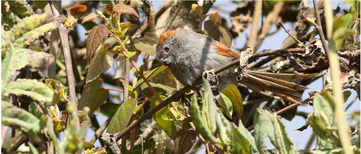
Apurimac Spinetail Synallaxis courseni – Peruvian endemic