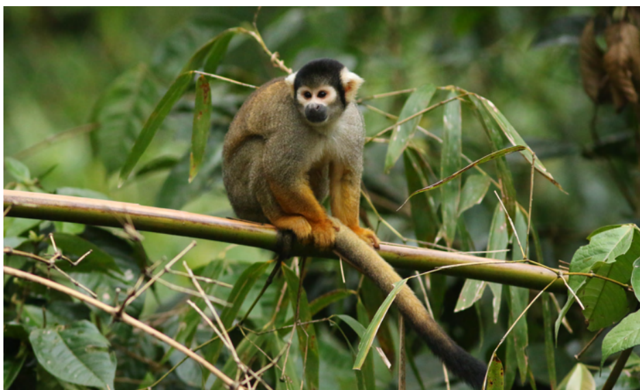
Black-capped Squirrel Monkey – Saimiri boliviensis