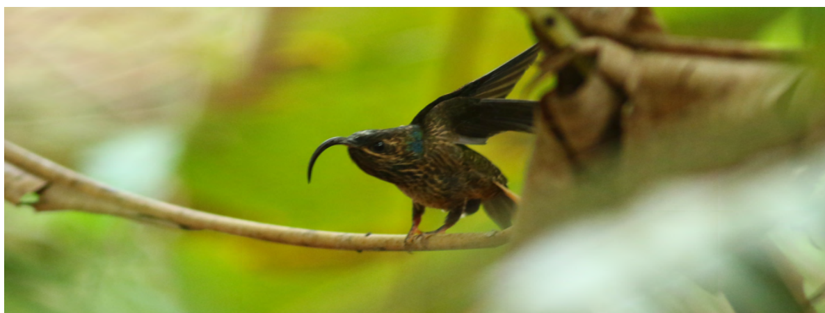
Buff-tailed Sicklebill Eutoxerescondamini – skulking in the Heliconia scrub

We had absolutely stunning views of the rare Buff-tailed Sicklebill , our main target of this site. We even observed two different birds in the Heliconia scrub. ( -12.9020 , -71.3723 )