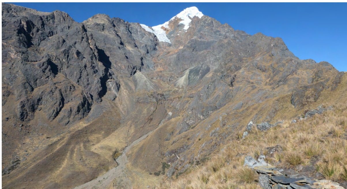
Abra Malaga with Mount Victoria in the background Down on the right side you see the polylepis forest patches where we found our targets

Around 8 am we arrived at the pass of Abra Malaga. (4300 m.alt.) From here we started to walk along the so-called Royal Cinclodes trail. Our car would drive further down the main road where we would meet again after our trekking through the valley. First we ascended up to 4600 meters before we started our descend into the next valley. The weather was outstanding, rather cold but bright and sunny. We had a great trekking in an absolutely stunning landscape with Mount Victoria towering above us, while searching for our target species.