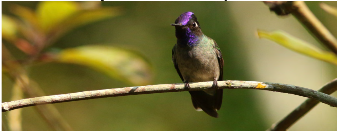
Violet-headed Hummingbird Klais guimeti