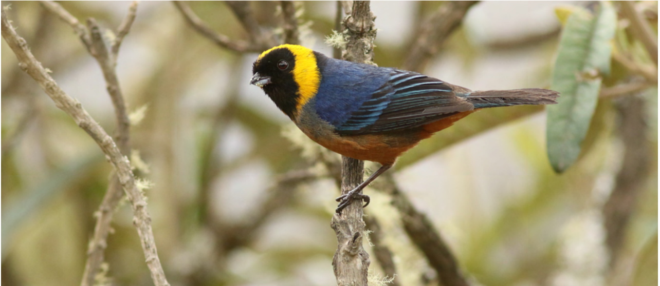
Golden-collared Tanager Iridosornis jelskii