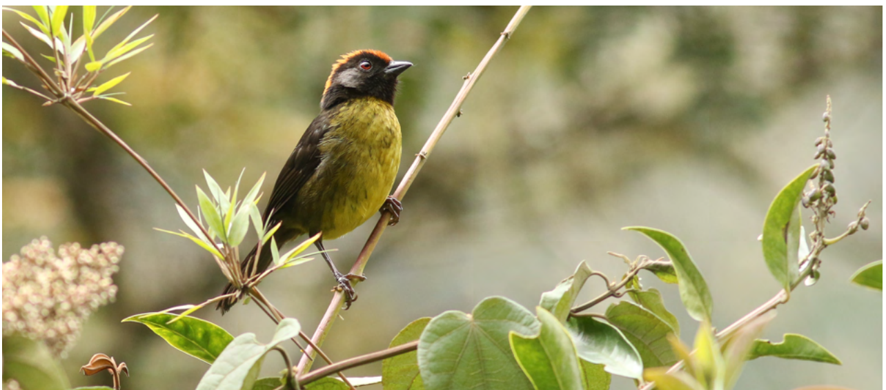
Grey-eared Brushfinch Atlapetes melanolaemus