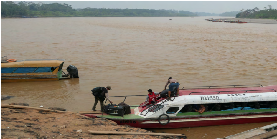
Loading our luggage on a speedboat on the rio Madre de Dios at Laberinto

After breakfast in nearby hotel Hiuta we drove (one hour) from Puerto Maldonado to Laberinto, located west of Puerto Maldonado along road 30C, the so-called Interoceánica Sur. At the "harbour" our luggage was loaded on a speedboat which connected Laberinto with several settlements along the river Madre de Dios. In fact the boat stopped at any site, riverbank along the river to drop or to pick-up passengers.