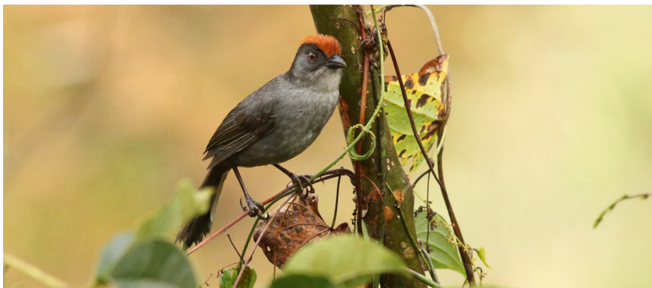
Cuzco Brushfinch Atlapetes canigenis – Peruvian endemic

It did not take long before we had excellent views of several endemic Cuzco Brushfinches , our main target for the afternoon. (-13.0456, -72.9365)