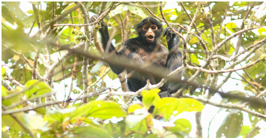
Black Spider Monkey – Ateles chamek