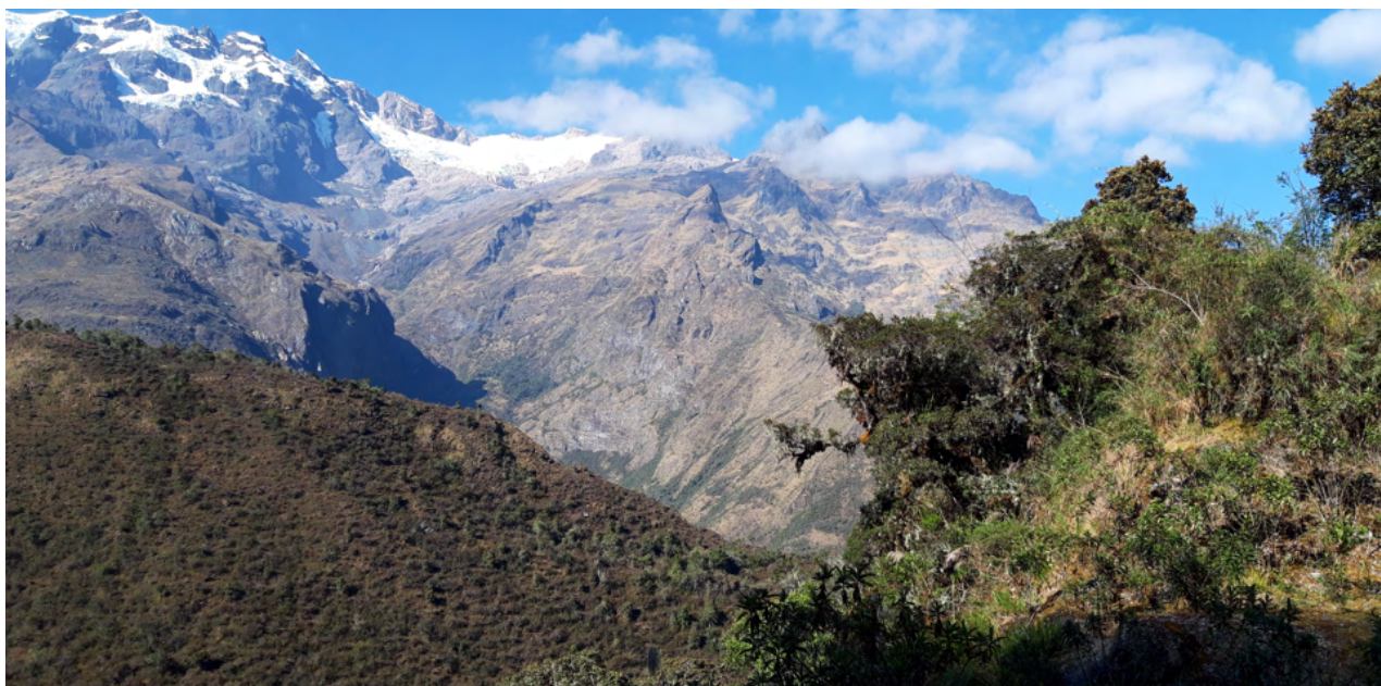
Abra Malaga Cloud Forest

We left Ollantaytambo at 5 am. After 1½ hour we crossed Abra Malaga (4316 m.alt.) and birded the temperate/cloud forest along the main road (PE-288) at the other side of the pass for several hours.