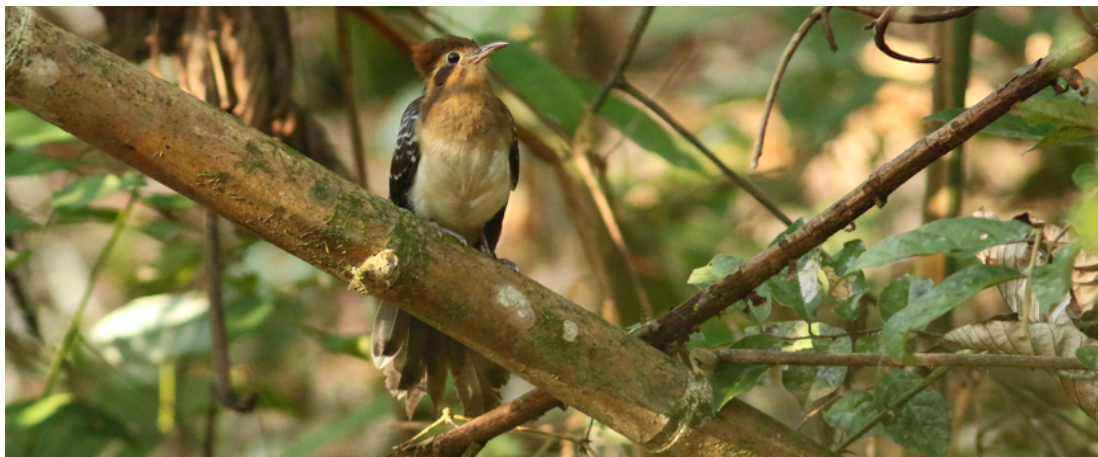
Pavonine Cuckoo Dromococcyx pavoninus

In the same patch we also heard the call of a Pavonine Cuckoo . When we scrambled a little into the bamboo we had amazing views of this rare cuckoo. It stayed at the same perch for minutes and could be observed and photographed during that period. ( -11.5028 , -69.2938 )