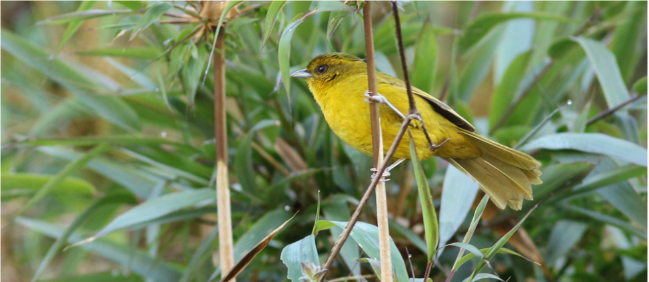
Parodi's Hemispingus Hemispingus parodii – Peruvian endemic