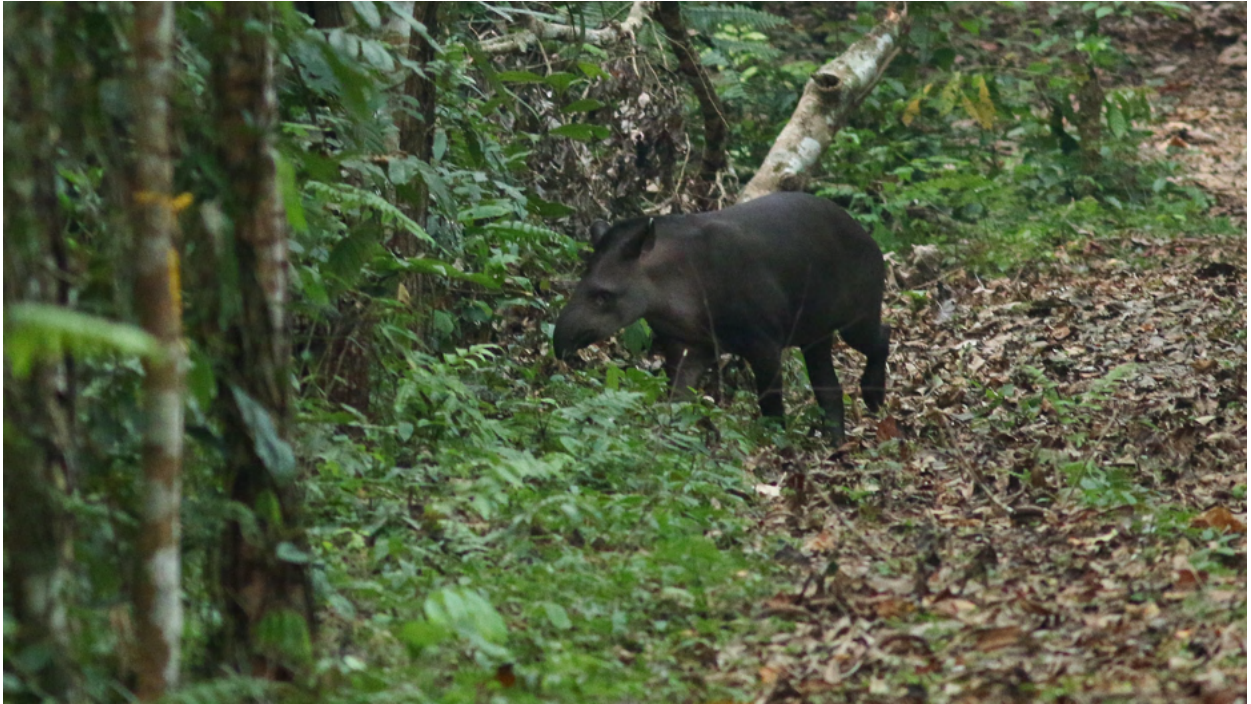
Brazilian Tapir – Tapirus terrestris