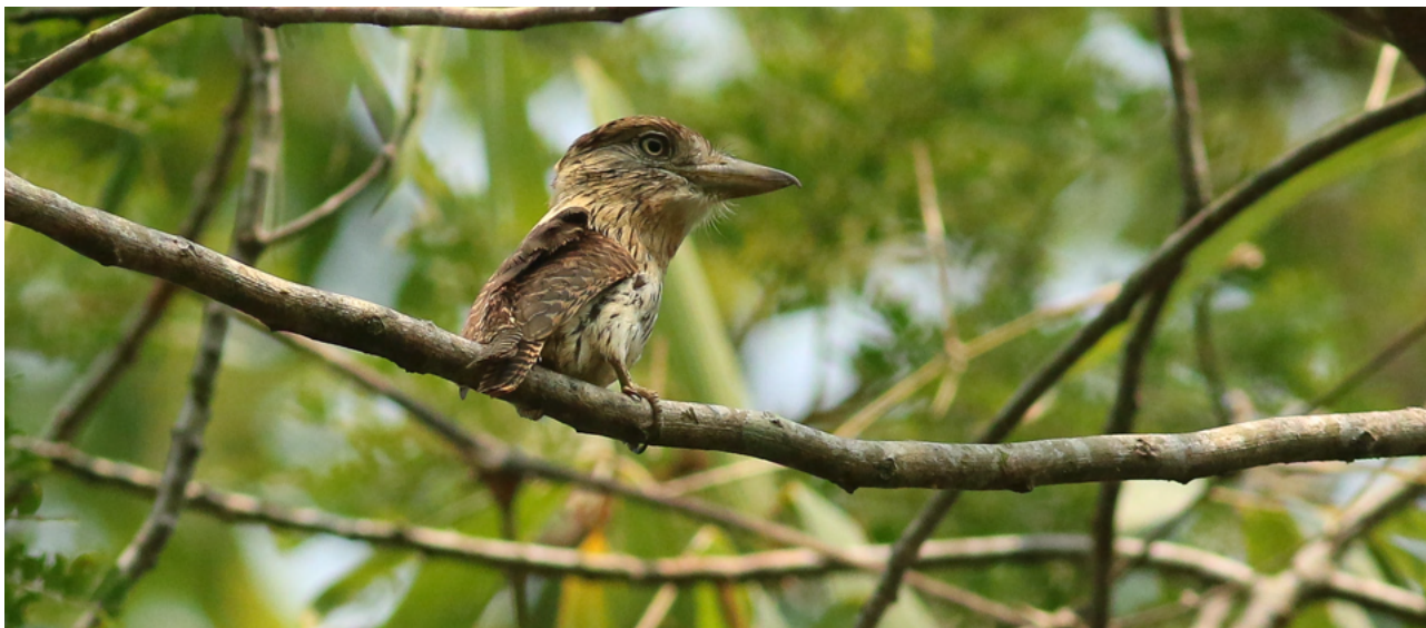
Western Striolated Puffbird Nystalus striolatus

We left the place and started to bird along the main road. First we found two Western Striolated Puffbirds (-12.9003, -71.3869) and in a bamboo patch a male Bamboo Antshrike gave fine views but we were distracted when suddenly a pair of Rufous-breasted Piculets popped up in the thick bamboo.