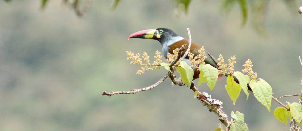
Grey-breasted Mountain -Toucan – Andigena hypoglauca