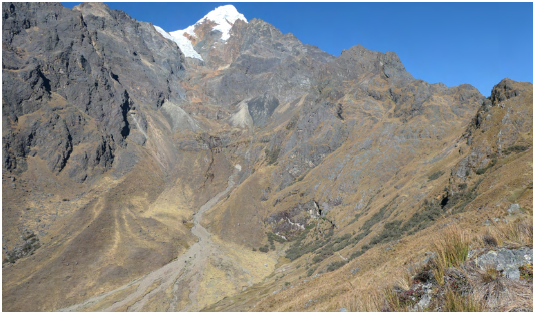
Mount Victoria – Abra Malaga

A report on birds seen on a trip to Peru 24 August – 23 September 2022