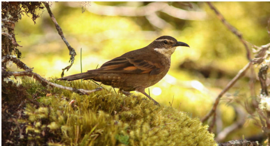
Royal Cinclodes Cinclodes aricomae