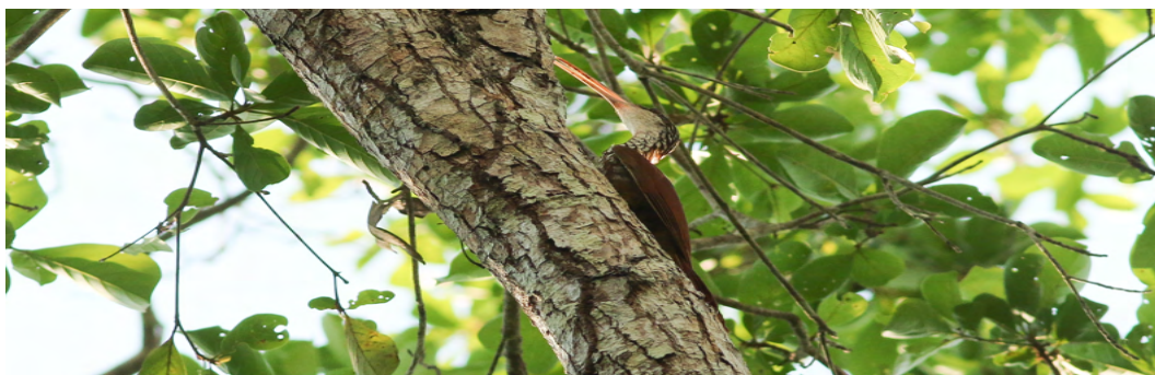
Long-billed Woodcreeper Nasica longirostris

Mid afternoon we returned to our boat and travelled back. During our walk along the board walk we had some great views of an impressive and very vocal Long-billed Woodcreeper .