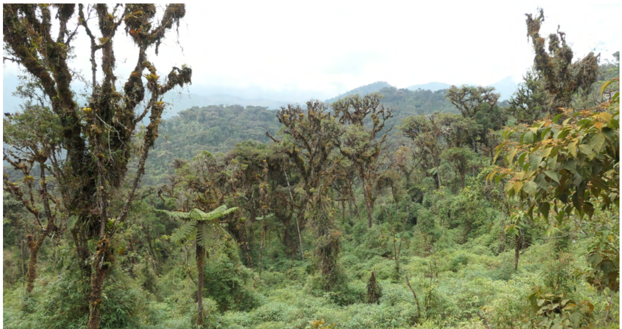
Nice habitat along this road. (CU-869)

The Vilcabamba Thistletail was the first species to surrender and the species gave exceptionally fine views. (-13.0336, -72.9578)