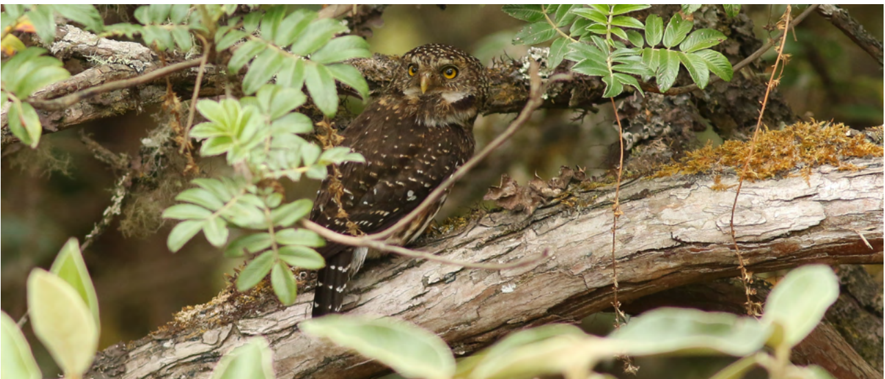
Yungas Pygmy Owl Glaucidium bolivianum