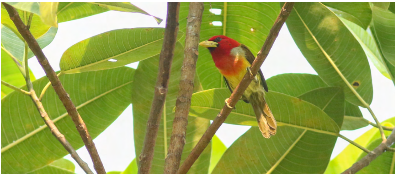
Scarlet-hooded Barbet Eubucco tucinkae

After this great success we continued our walk into the garden and the next hour we succeeded in getting views of Johannes Tody Tyrant , a pair of the scarce Scarlet-hooded Barbet (-12.8968, -71.3951) and Black-throated Toucanet .