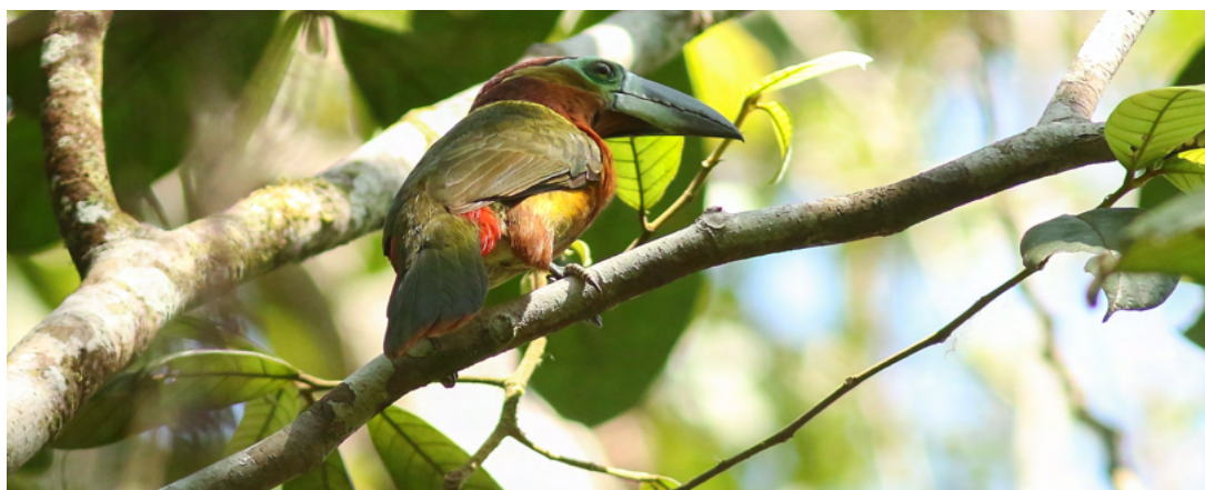
Golden-collared Toucanet Selenidera reinwardtii langsdorfii – female

White-bellied Tody-Flycatcher was found and a Ringed Antpipit walked on the trail in full view. A pair of Round-tailed Manakins showed at the end of our birding session.