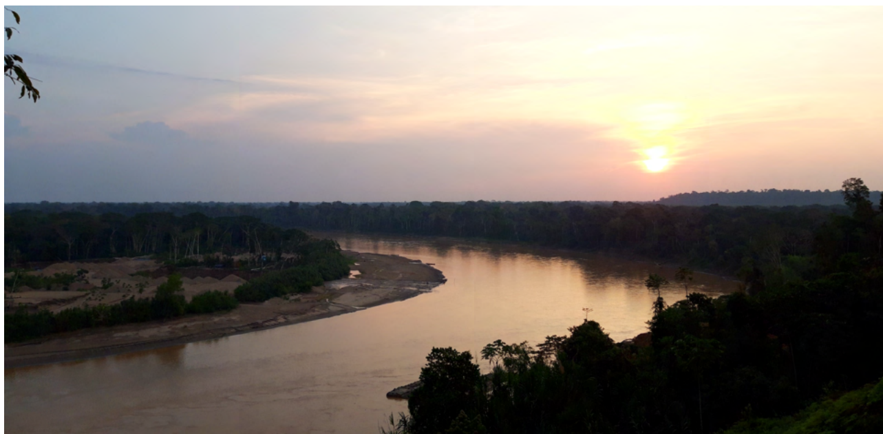
Sunset at Los Amigos, along the Rio Madre de Dios