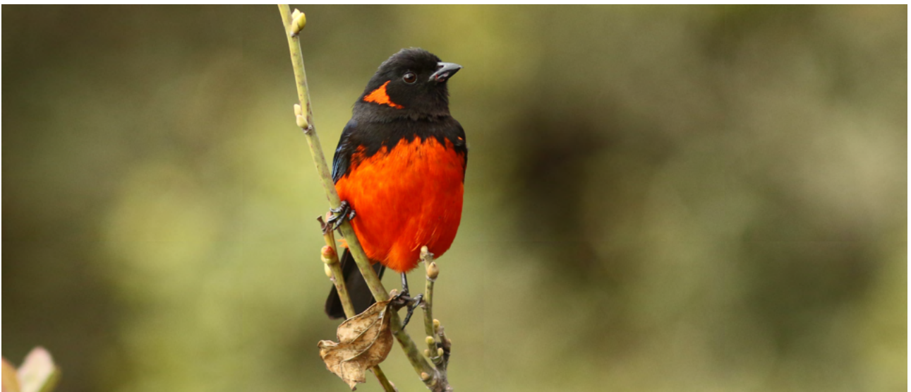
Scarlet-bellied Mountain-Tanager Anisognathus igniventris igniventris