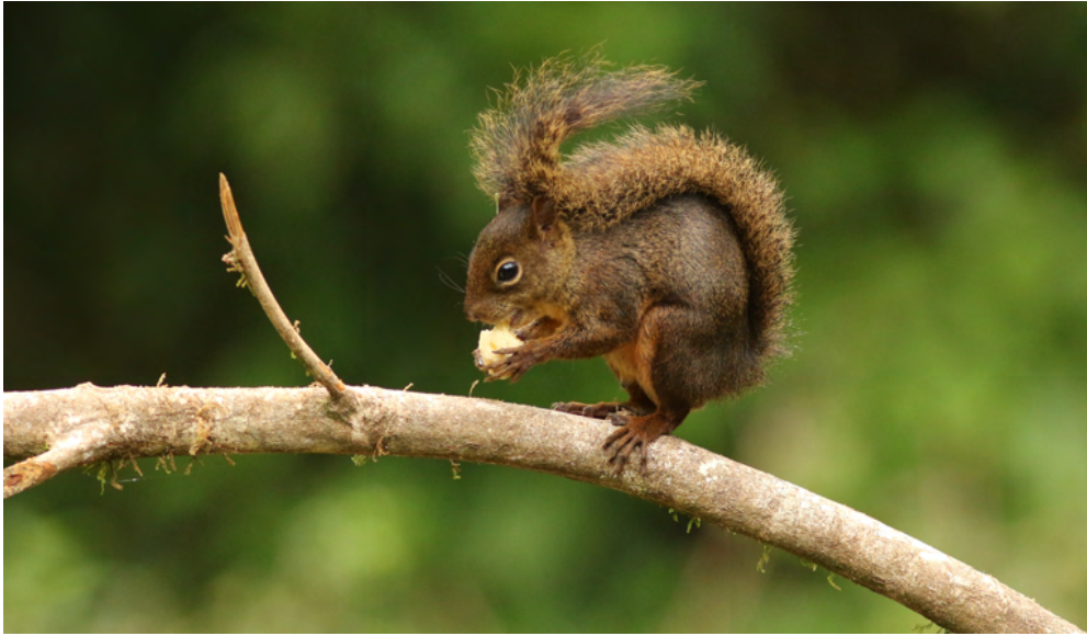
Bolivian Squirrel – Sciurus ignitus