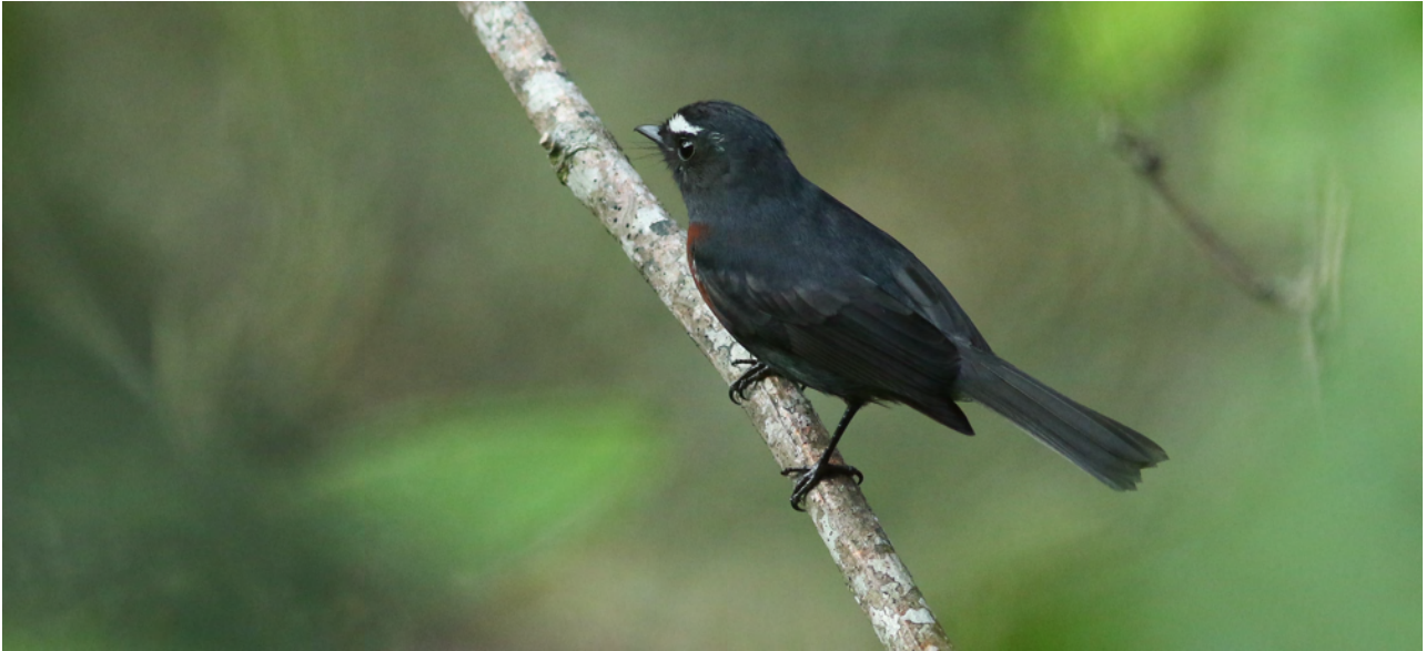
Maroon-belted Chat-Tyrant Ochthoeca thoracica