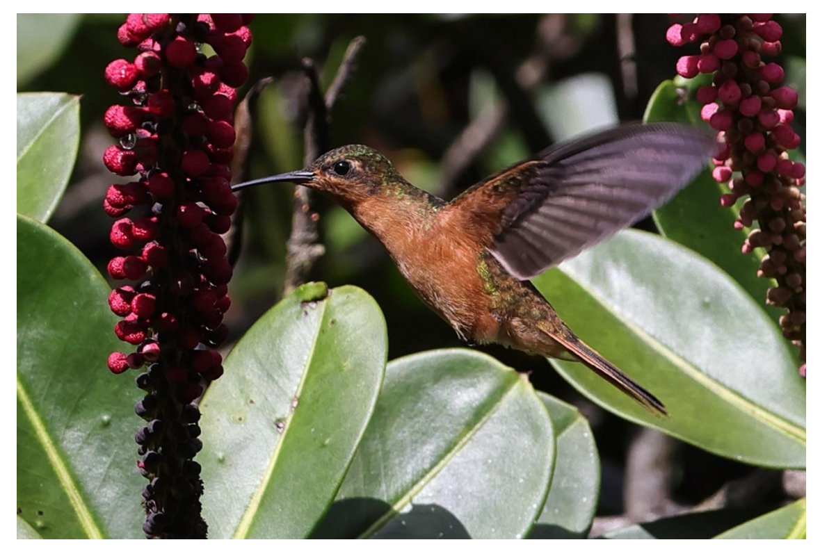
Rufous-breasted Sabrewing Campylopterus hyperythrus

Vista. El Niño coupled with climate change resulted in a drier season than it should and the fires in the Sabana showed the situation could deteriorate as the rains were late.