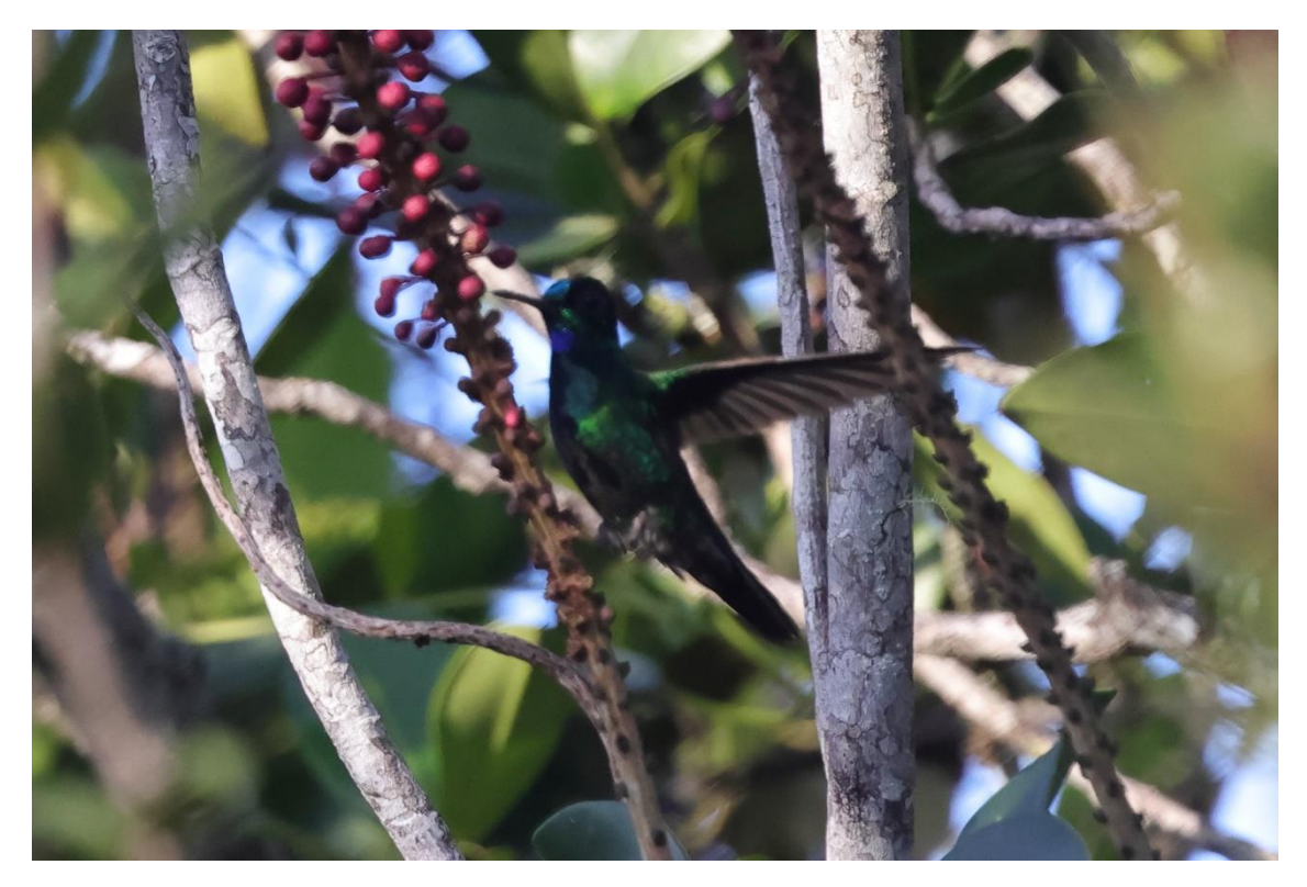
Velvet-browed Brilliant Heliodoxa xanthogonys

in Boa Vista, late afternoon in the touristy Orla de Taumanan by the (very low) Branco River for drinks and easy birds.