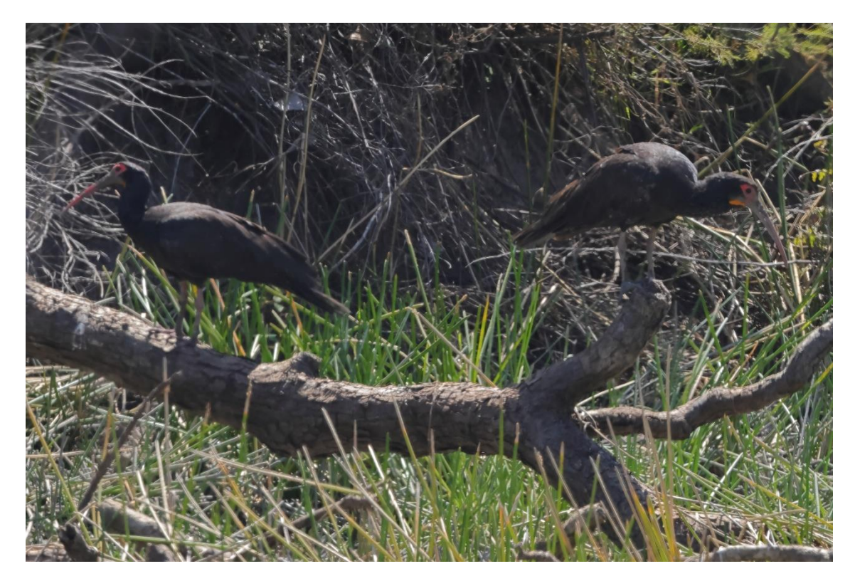
Sharp-tailed Ibises Cercibis oxycerca

Common Ground Dove Columbina passerina Ruddy Ground Dove Columbina talpacoti White-tipped Dove Leptotila verreauxi Smooth-billed Ani Crotophaga ani Squirrel Cuckoo Piaya cayana Common Pauraque Nyctidromus albicollis *Roraiman Nightjar Setopagis whitelyi – searched for at Soldado Pionero (we found only White-tailed Nightjar) and El Campamiento (not there). One seen briefly at the Guardia Nacional post. White-tailed Nightjar Hydropsalis cayennensis White-collared Swift Streptoprocne zonaris Fork-tailed Palm Swift Tachornis squamata Straight-billed Hermit Phaethornis bourcieri Sooty-capped Hermit Phaethornis augusti Blue-fronted Lancebill Doryfera johannae Brown Violetear Colibri delphinae