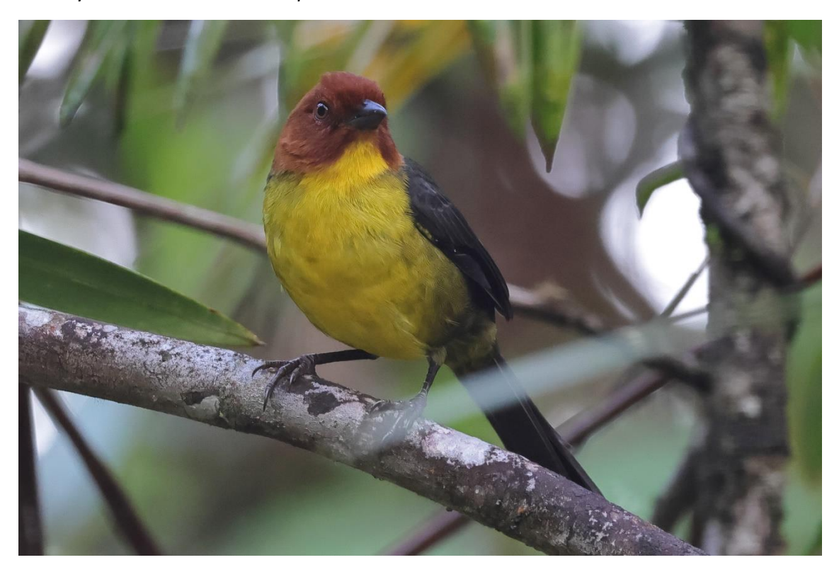
Tepui Brushfinch Atlapetes personatus

Pale-breasted Thrush Turdus leucomelas Yellow-legged Thrush Turdus flavipes White-necked Thrush Turdus albicollis Pale-eyed Thrush Turdus leucops