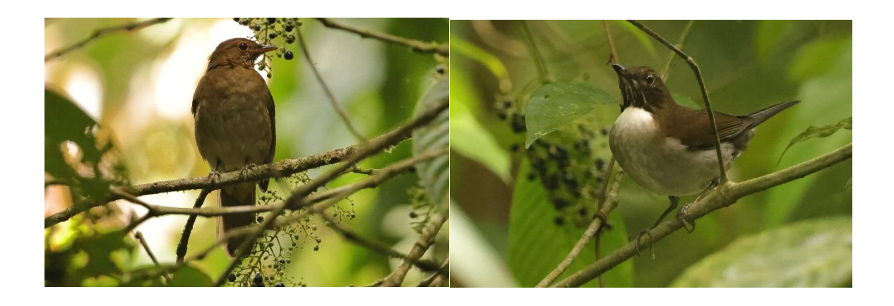
Rufous-brown Solitaire Myiadestes (or Cichlopsis ) leucogenys gularis and White-necked Thrush Turdus albicollis phaeopygoides , both are future splits.

It was a 40-45 minute drive from Kaimoran to the border between the Gran Sabana and the Sierra de Lema forests.