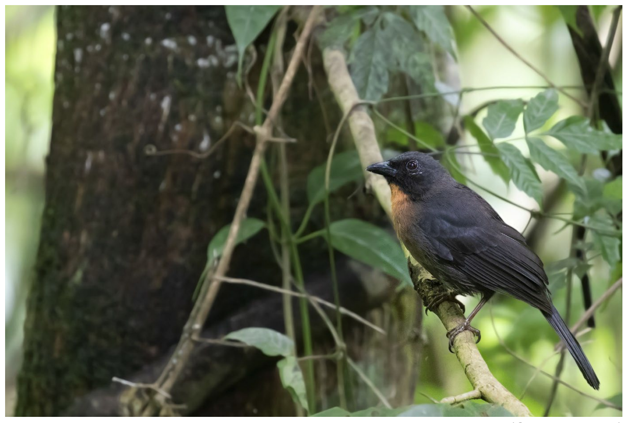
Black-cheeked Ant-Tanager