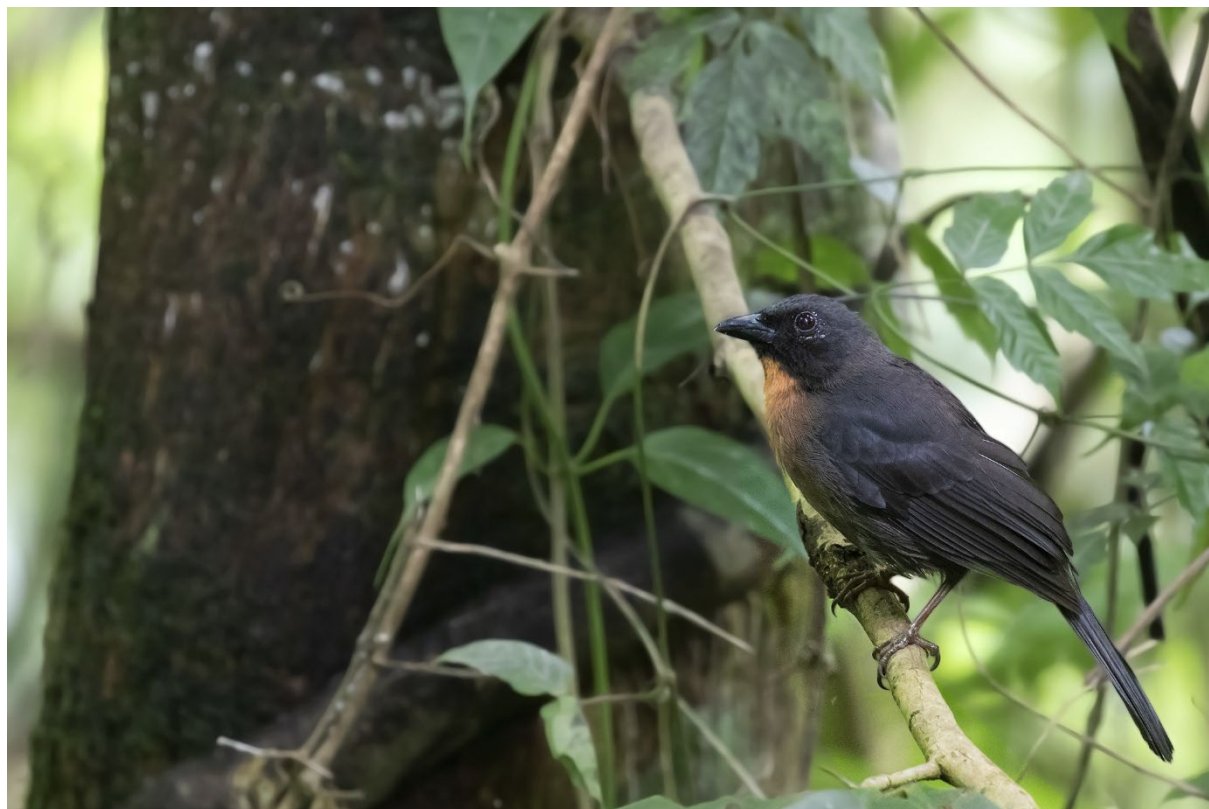
Black-cheeked Ant-Tanager