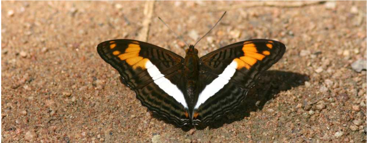
Capucinus Sister, one of Cristalino's abundant butterflies.