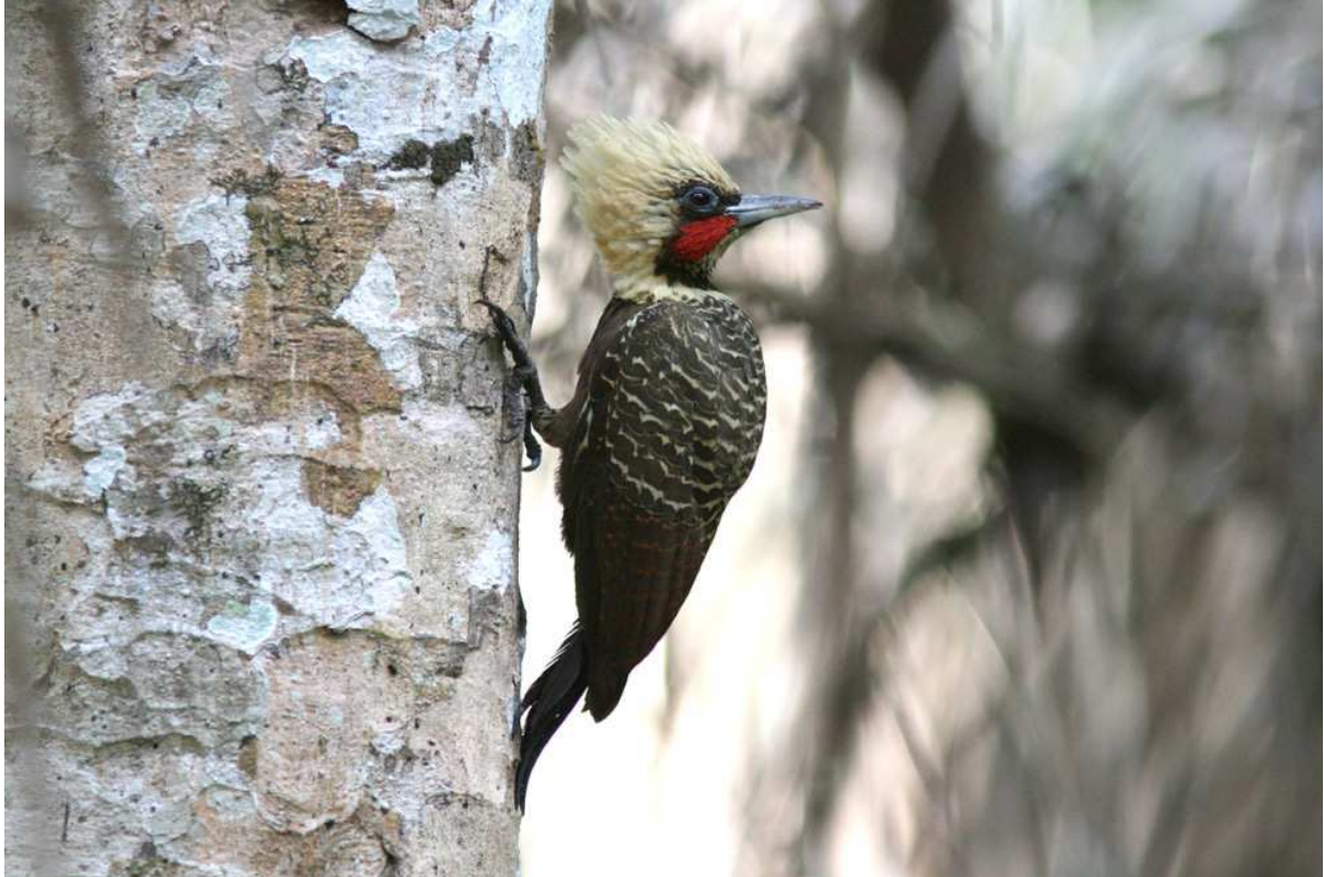
The beautiful Pale-crested Woodpecker at Canto do Arancuã.