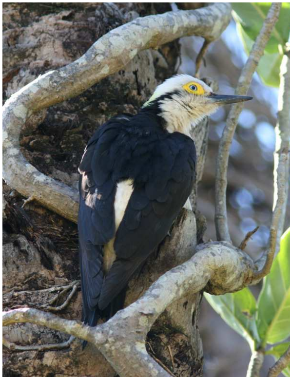
White Woodpecker, Emas.