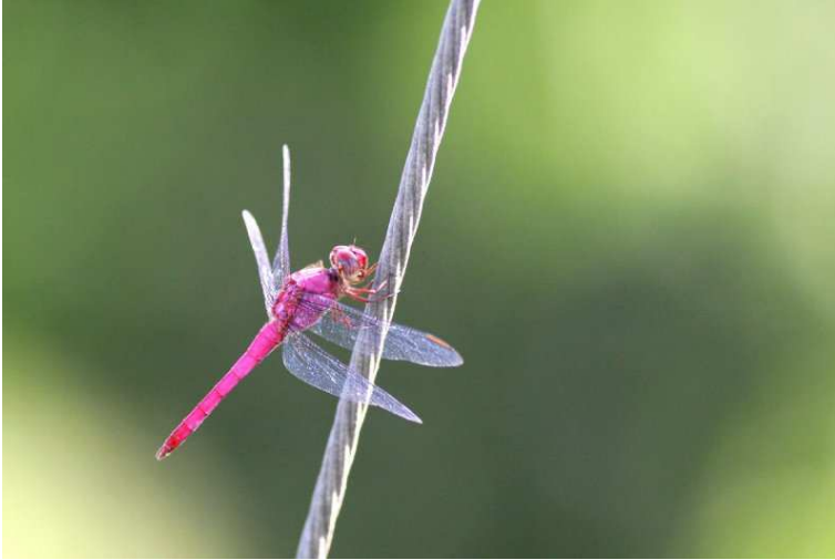
Dragonfly at Cristalino.