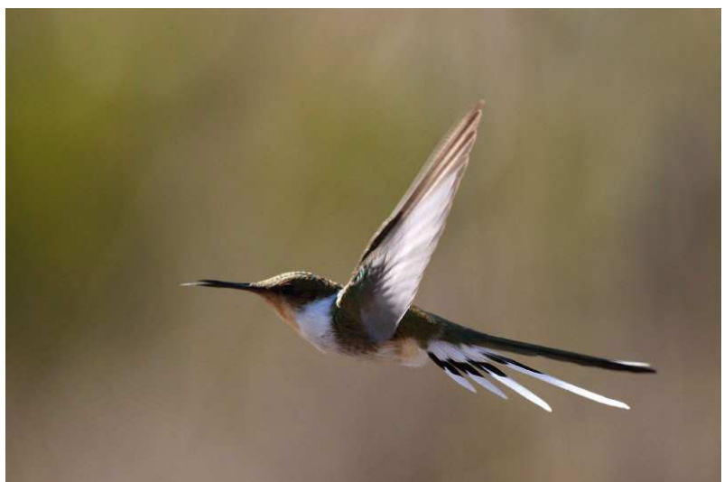
Female Horned Sungem.