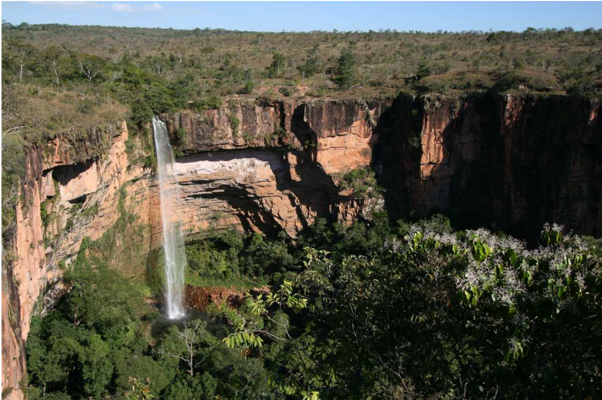
Véu de Noiva (Bridalveil Fall), Chapada dos Guimarães.