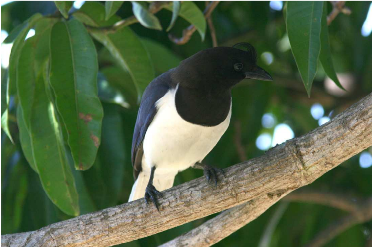
A curious Curl-crested Jay.

grounds. At 15.00 we walked towards the boardwalk that would take us into Cone-billed Tanager habitat. The Streamer-tailed Tyrants were at the exact same spot as last year! The first patch of dense riverine forest held White-striped Warbler (seen by a few) and Helmeted Manakin. On our way to the second forest patch the Cone-billed Tanager started to sing! It was a bit tumultuous before everybody got to see this first class rarity, but at least I carried the scope for a good reason! The last daylight time was spent in the burnt area where we'd seen the Campo Miners earlier. Now there were two pairs of miners, and we also found Black-masked Finch, singing Lesser Nothura and singing Collared Crescentchest (badly wanted by several participants). Our last birding effort was to try for the White-winged Nightjar. Spotighting was not permitted, so we had to rely on the old air strip. Unfortunately it was a bit too cool and we hardly saw any moths. It had been a very good start anyway, and we could enjoy a good dinner before it was time to make the list and go to bed.