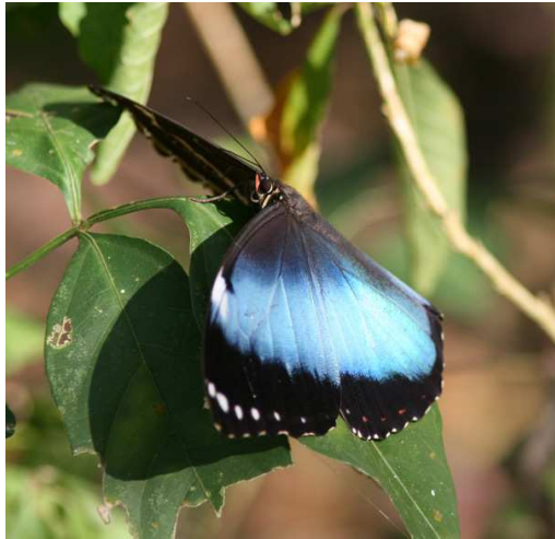
Helenor Morpho and Chestnut-eared Aracaris.