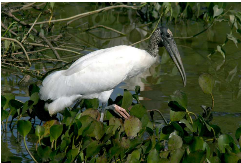
Wood Stork was a common species this year with several hundreds in total.