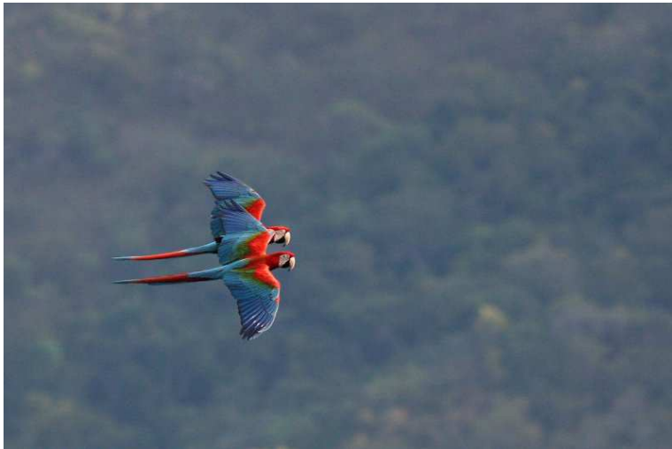
Red-and-green Macaws at Chapada.