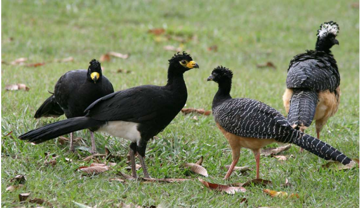
Wonderful Bare-faced Curassows in Emas.

the seedeaters, but it was mostly Marcus and Lori that got to see them. Most were Plumbeous but also Tawny-bellied and Capped Seedeaters were identified. André saw that one of the anteaters was coming up from the marsh so we walked away to see it cross the road. Success! And Lori then managed to find a couple of Collared Crescentchest in the final daylight, so everybody were very happy. We decided to stay a bit longer to try for Giant Snipe, and surely two birds started to display in response to playback! Without spotlighting they were nearly impossible to see, though. Our last try for White-winged Nightjar proved fruitless, but we were quite pleased with the evening anyway. Emas rocked!