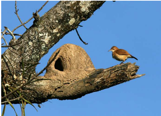
Rufous Hornero at nest and Sungrebe at Canto do Arancuã.