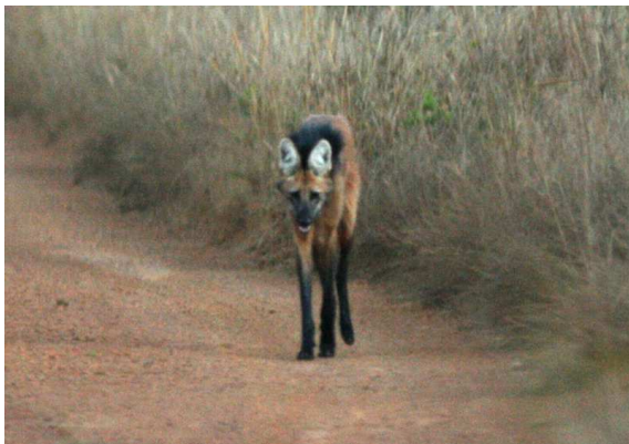
Maned Wolf through the front window.