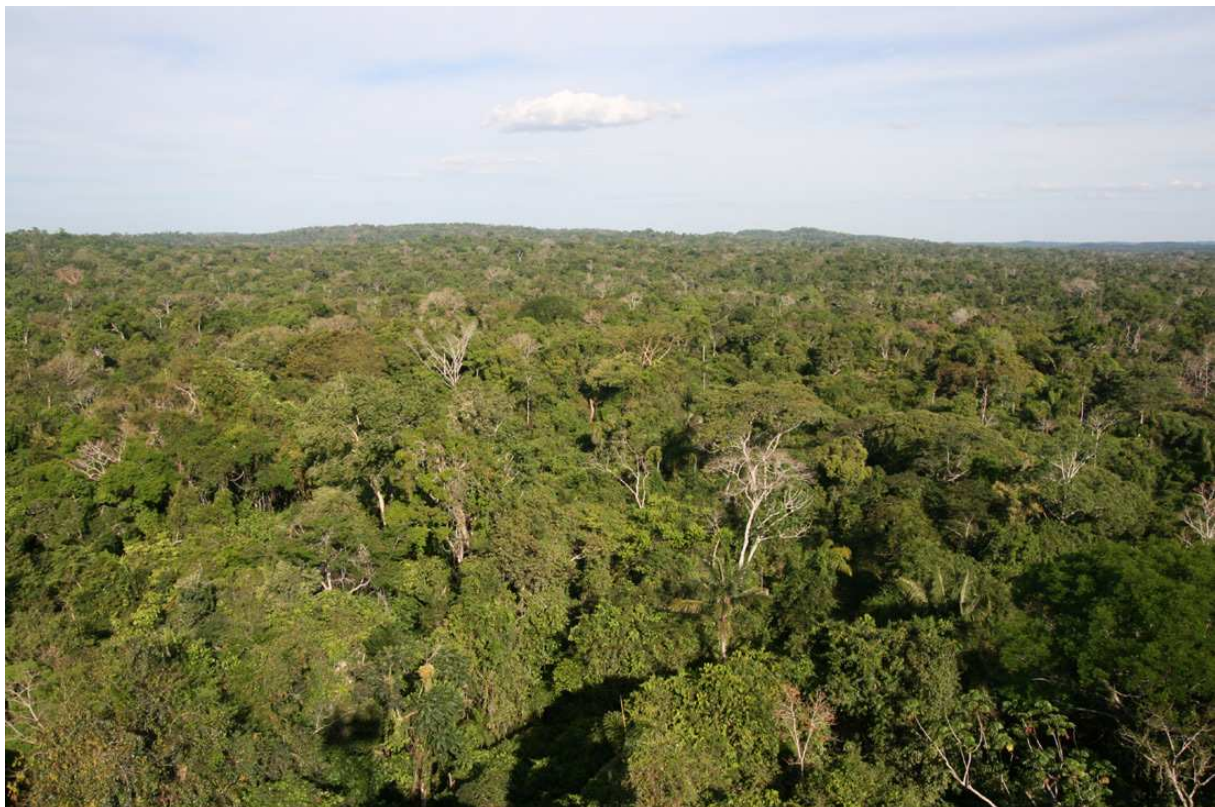
Unbroken Amazonian forest as seen from the top of Cristalino's canopy tower.

Breakfast today was scheduled at 05.15 and departure for the Castanheira Trail at 05.45. This beautiful forest trail is half an hour upstream. Along the river we recorded Capped Heron, Green Ibis, Black Caracara, Sunbittern and plenty of Blue-and-yellow Macaws. The Castanheira was a bit on the quiet side, but as usual it produced quality birds. Most of these were only heard, including Razor-billed Curassow, Barred Forest-Falcon, Pygmy Antwren, Chestnut-tailed Antbird, Chestnut-belted Gnatcatcher, Southern Nightingale-Wren and Tooth-billed Wren. Good species seen were foremost three stunning Bare-eyed Antbirds and a Golden-crowned Spadebill. Back at the boat we had four Crimson-bellied Parakeets by the river. A visit to a nearby forest stream gave White-crowned Manakin, Thrush-like Schiffornis, Cream-colored Woodpecker, Bronzy Jacamar (heard) and a funny group of Spider Monkeys. Also the beginning of Kawall trail was on the morning's itinerary, so there we went to hear Flame-crested Manakin and Zimmer's Tody-Tyrant despite trying hard to see both of them with the help of playback. From the river we found three King Vultures and a White Hawk on the way back to the lodge. Lunch and siesta followed. At 15.00 we walked towards the Canopy Tower . At the Rocky/Caja intersection playback was attempted for the uncommon and difficult-to-see Banded