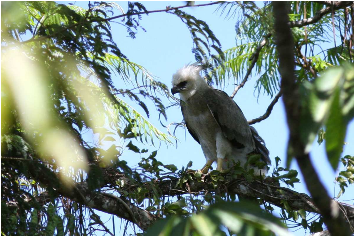
The newly fledged Harpy Eagle at Alta Floresta.