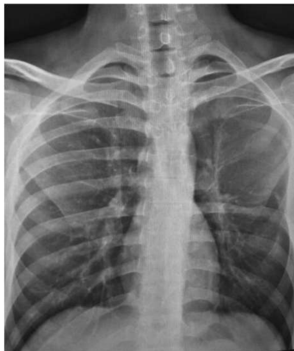
Fig. 1. Chest x-ray showed that the fourth to sixth ribs were missing in the left hemithorax.

Herein, we present the case of an adult man who presented with the symptomatology and clinical features of VBD, the diagnosis in this case being made after excluding other secondary causes of osteolysis. VBD is a rare bone disease of uncertain etiology and is characterized by extensive monostotic or polyostotic spontaneous bone resorption. Exact figures on the incidence and prevalence of this condition are hitherto unknown. It is characterized by the proliferation of lymphatic and vascular channels that results in massive osteolysis of the involved bones, and histopathology reveals the presence of fibrous tissue with blood vessels, with the marrow replaced with fibrovascular tissue or abundant vascular