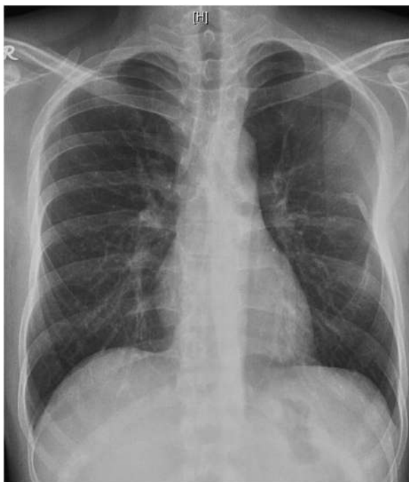
Fig. 3. Chest x-ray showed no radiographic progression of the disease.

presented with dyspnea and recurrent episodes of pleural effusion following a blunt trauma of the chest who was later diagnosed to have VBD with massive osteolysis of the ribs. He required treatment with local radiotherapy with monthly infusions of pamidronate with thalidomide. His condition remained stable after 7 years of medical therapy with mild pleural thickening and fibrosis. 14