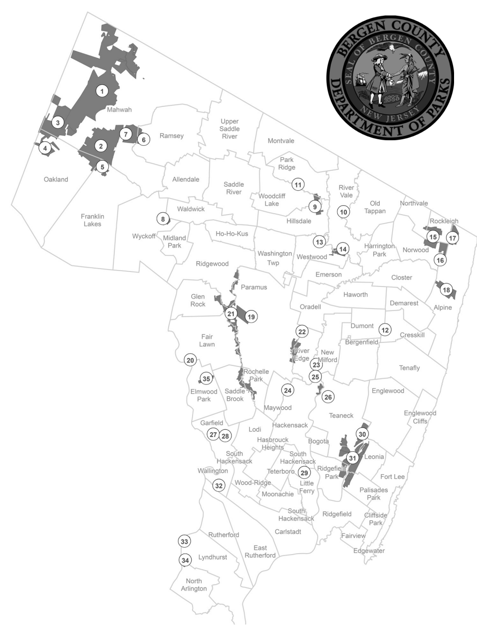
Most parks open dawn to dusk...

...Exceptions are made for lighted tennis courts and ice skating areas while the lights are on, for lighted ball games, for overnight camping (with permit), for the Environmental Center exhibit hall, for the Bergen County Zoological Park, and for these fee facilities: Campgaw Mountain Ski Center, Darlington Park during the swim season (opens at 10 a.m.), Bergen Equestrian Center and Saddle Ridge horseback riding facilities, the Van Saun Park railroad and pony rides, and the six golf courses - Darlington, Orchard Hills, Overpeck, Rockleigh, Soldier Hill and Valley Brook.