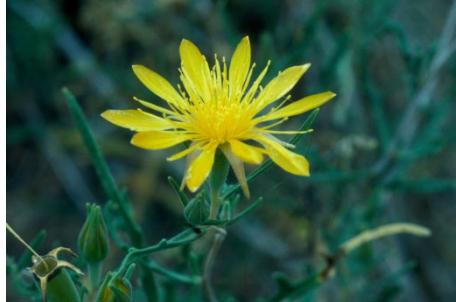
Close up of Nuttallia densa