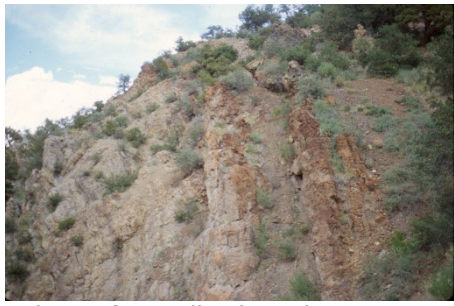
Habitat of Nuttallia densa by Susan Spackman Panjabi