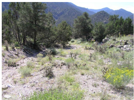
Habitat of Nuttallia densa by Stephanie Neid

Mentzelia densa occupies dry open areas in washes, roadsides, naturally disturbed sites, and steep rocky slopes. Plants grow in gravel, scree, or on cliffs formed from Precambrian granodiorite and gneiss. The species occurs in pinyon-juniper woodland and lower montane shrubland communities with a poorly developed understory and an open canopy. It may dominate in very open, disturbed sites such as sandy washes. It occurs as scattered individuals generally occupying 5% or less of the total vegetative canopy. The associated species are Pinus