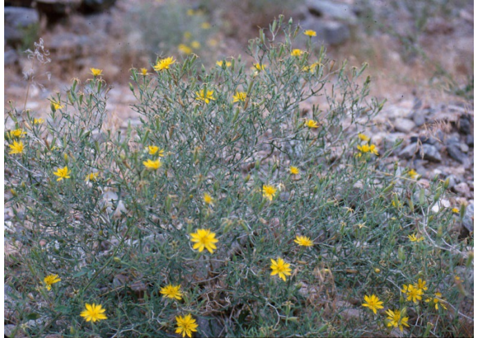
Close up of Nuttallia densa

Nuttallia densa (Arkansas Canyon stickleaf) Loasaceae (Blazingstar Family)