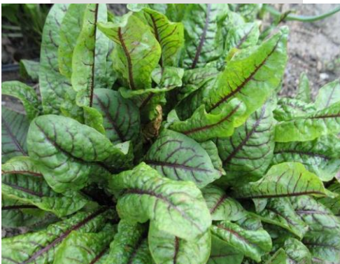
Bloody Dock , (photo courtesy of Missouri Botanical Garden)

We cannot sell yellow iris, floating heart, or parrotfeather because they are included on the invasive plants list ( see the note below ). We do need to know what the plant is, so please help us out by labeling your plant, or find a volunteer and tell them what the plant is. Every year we end up with some plants off to the side that no one knows what they are or where they came from. We really need the plants to come on Saturday morning so that we can get them labeled, priced, and ready for Sunday. We will offer fish if there are any donated. If you have fish to donate, please let us know ahead of time so we can be sure and provide a place for them.