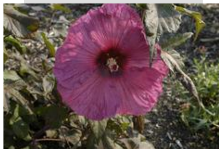
Hibiscus 'Plum Crazy'