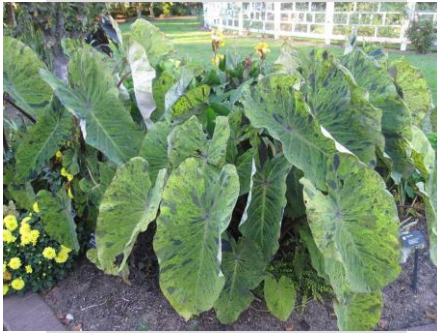
Taro 'Mojito' , (photo courtesy of Missouri Botanical Garden)