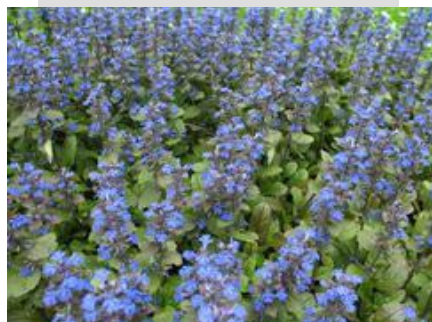
Bugleweed , (photo courtesy of Missouri Botanical Garden)