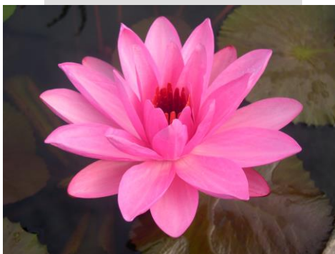
Tropical Water Lily 'Piyalarp'