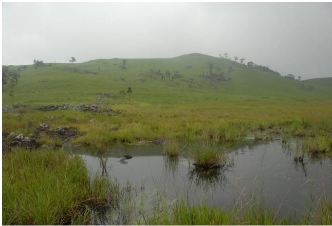
Veal Thom grassland in Virachey National Park.