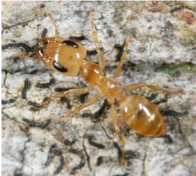
Gesomyrmex worker found during the RAP survey.

Considering this find, and the ecological isolation of the study area, a number of new species of ants are expected among the collected specimens. Most of the species will be new records for Cambodia, as only 22 species from 6 genera are currently listed as present in this country.