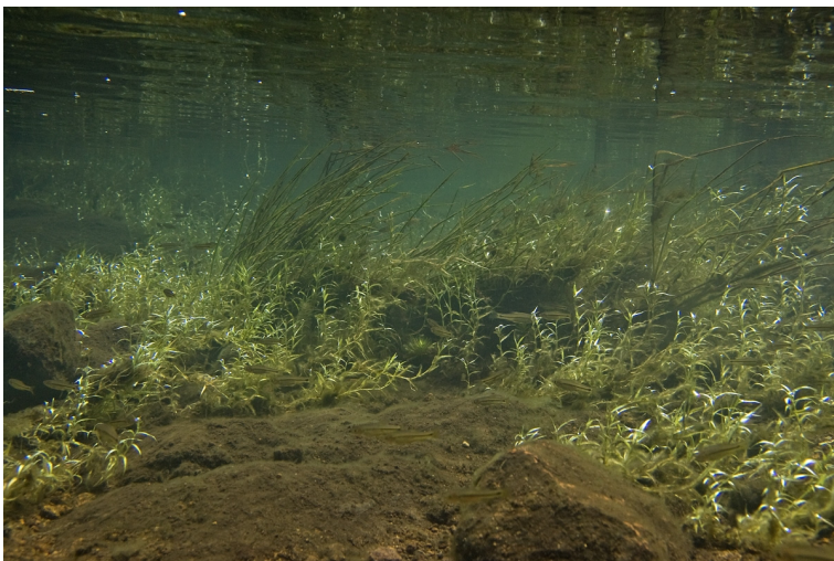
Hill stream, viewed below the surface.