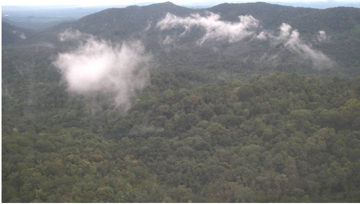
Aerial view of Virachey National Park.