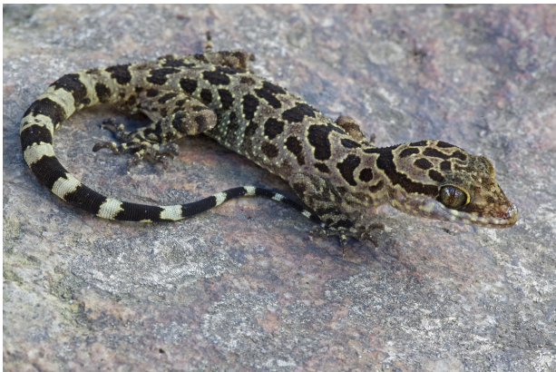
Undescribed gecko caught in Virachey NP during the RAP survey.