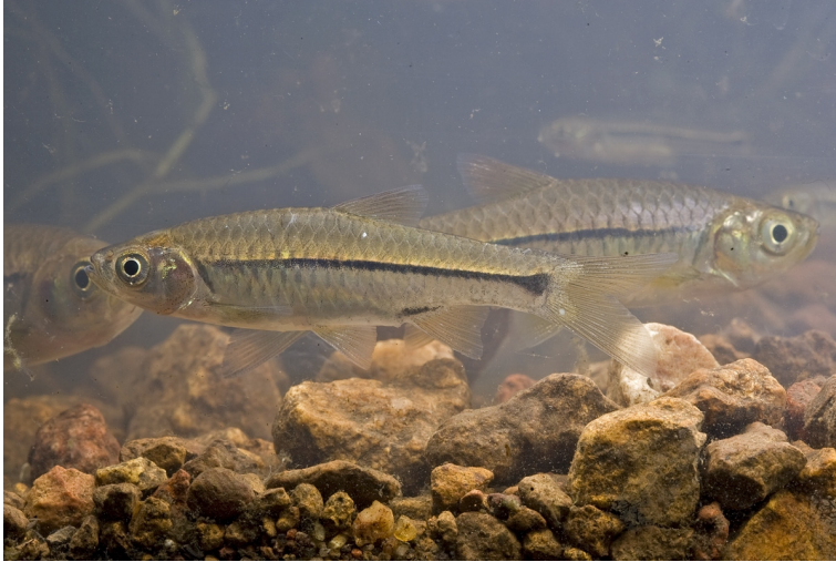
Freshwater fishes found in streams near Veal Thom.