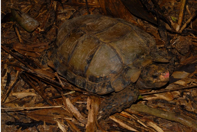
An Endangered Impressed Tortoise Manouria impressa observed during the RAP survey.