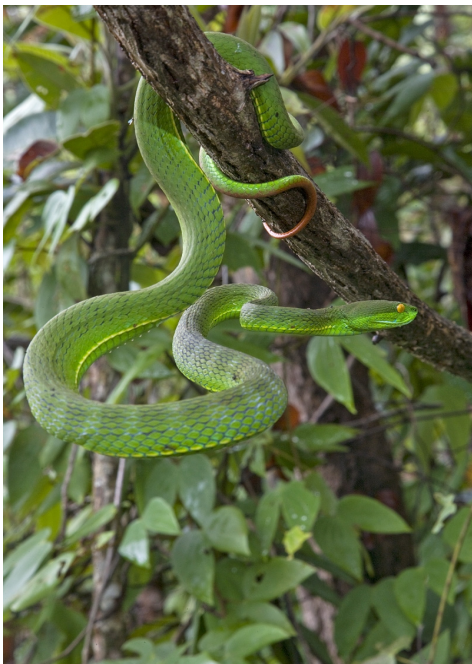
Green tree viper ( Trimeresurus albolabris ) found during survey.