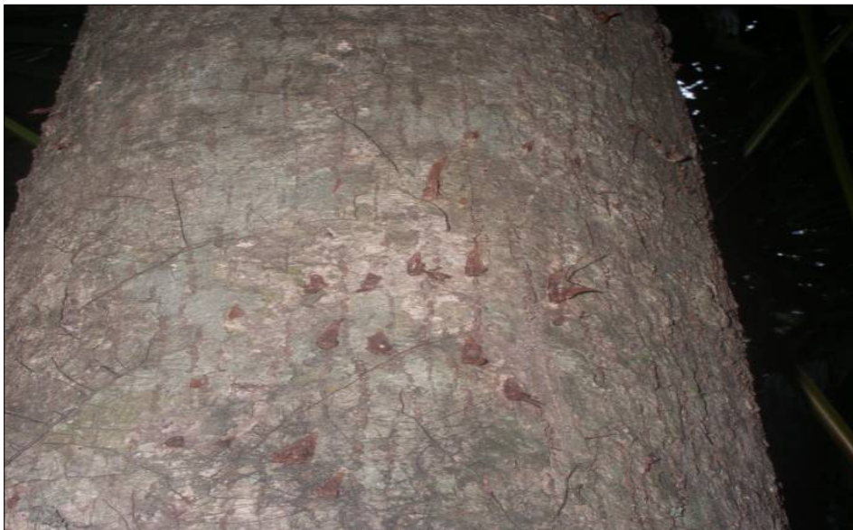
Tree with bear claw marks observed during Virachey RAP survey.

Although relatively few snares were found, it is important that the park rangers maintain high levels of enforcement within the park. There are borders both with Laos and with Vietnam, so the risk of cross-boundary poaching is fairly high. The remoteness of the site and lack of infrastructure currently protects the biodiversity, but this may change as development plans for Ratanakiri Province include road and infrastructure development in and around the national park.