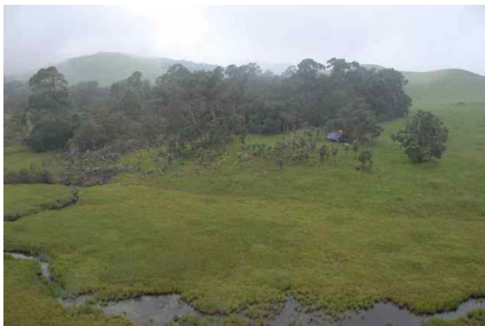
Camp site location in Virachey National Park.

The team flew via helicopter into Virachey National Park from the provincial capital, Banlung, and surveyed throughout the area for 15 days. The objective of the survey was to gain a better understanding of the biological importance of Virachey National Park and highlight its importance for biological conservation both in Cambodia and globally. The RAP survey will lead to the production of a detailed report for the Ministry of the Environment. This report will help the ministry to raise funds to protect and conserve the unique biodiversity of Virachey National Park.