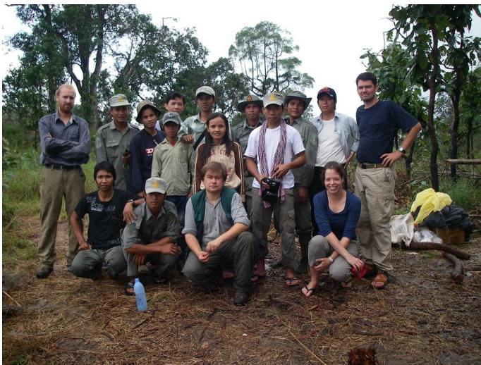
RAP team, Virachey National Park, 2007.