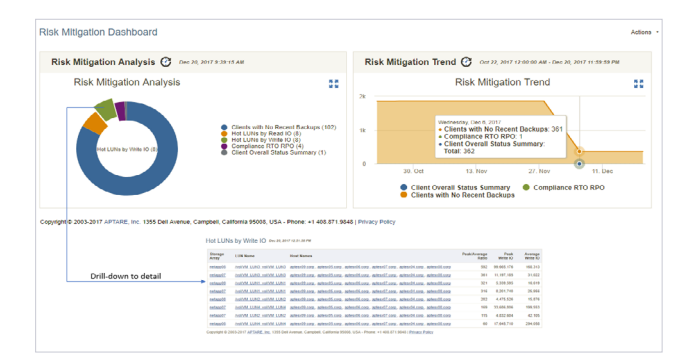
Figure 2. APTARE IT Analytics' risk mitigation dashboard tracks data from end-to-end as it flows through the data center, identifying events that could impact SLAs.