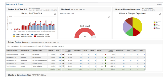
Figure 3. Backup Manager dashboard that offers real-time insights to easily identify backup failures and trends.

APTARE IT Analytics includes out-of-the-box compliance reports to meet internal SLAs and pass external regulatory audits. Reporting tools are also available to create custom reports. Compliance features include: