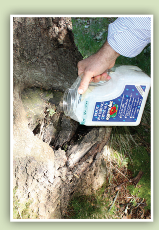
Examine trees for holes or cavities and add water absorbing polymer crystals if needed.

An adult female tree hole mosquito is able to lay hundreds of eggs which can remain dormant for months, even if the tree hole dries up. Eggs hatch after the tree hole is re-filled with water and the weather gets warm enough for the mosquito larvae to survive.