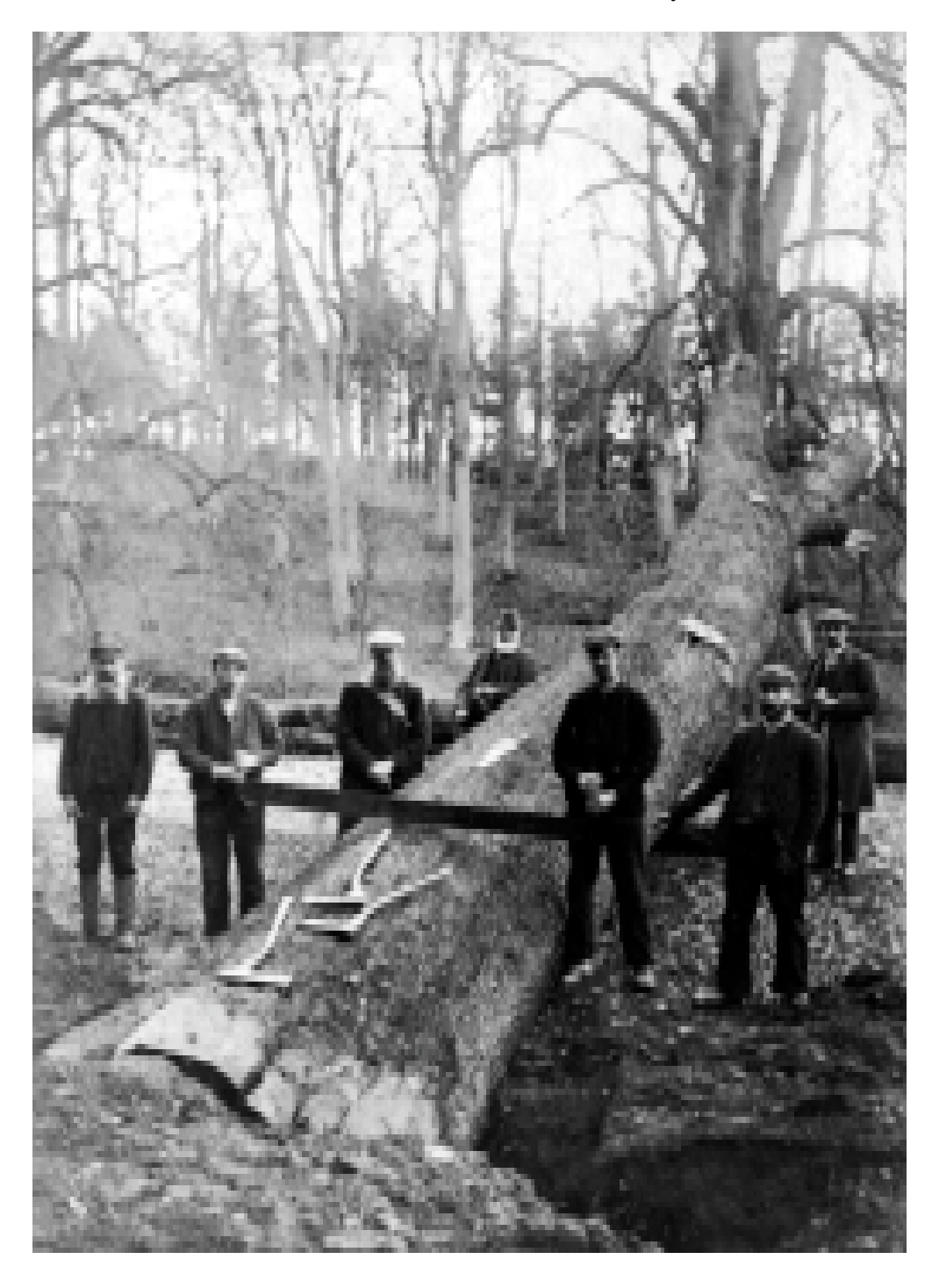
The photograph of this magnificent oak and the band of sawyers who felled it probably dates from around 1900. Note the four-man sawing team in the foreground. Two will pull on the saw itself while two heave on ropes attached to each end of the saw.