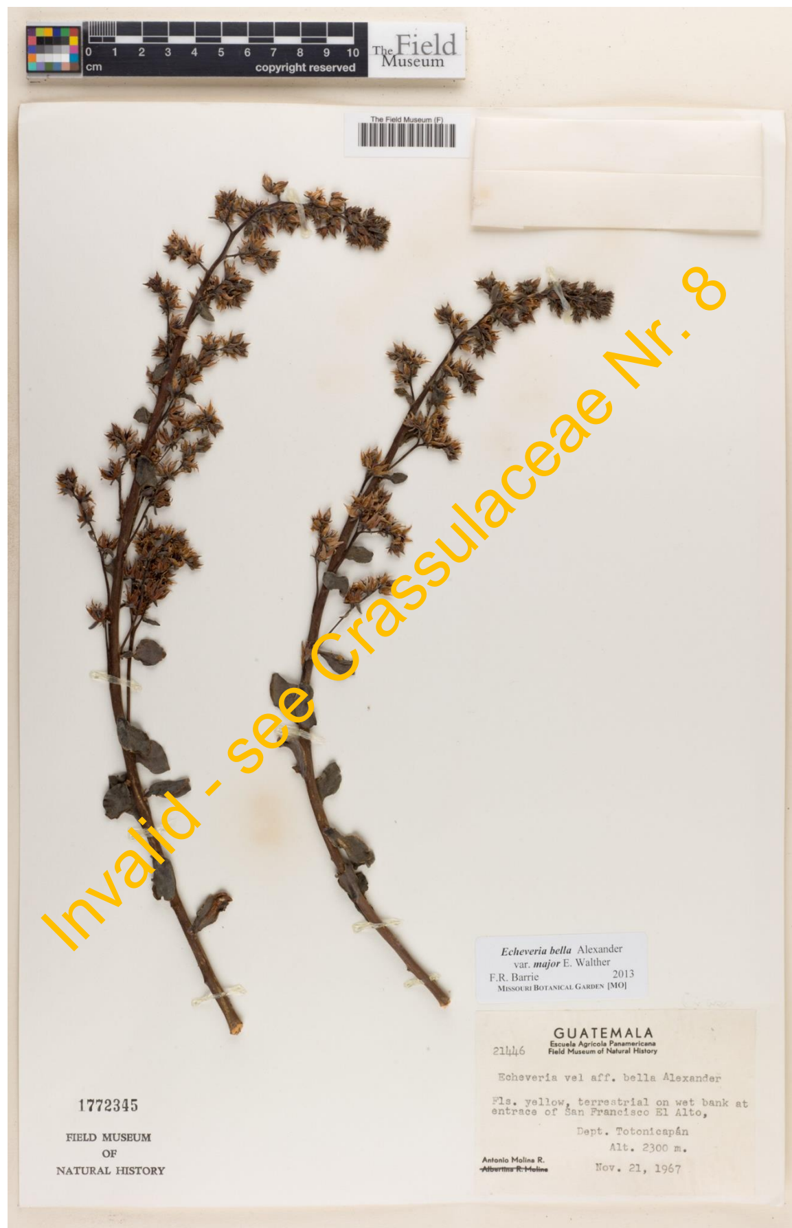
Fig. 7. Specimen collected in Guatemala, wrongly identified as E. bella fa major .