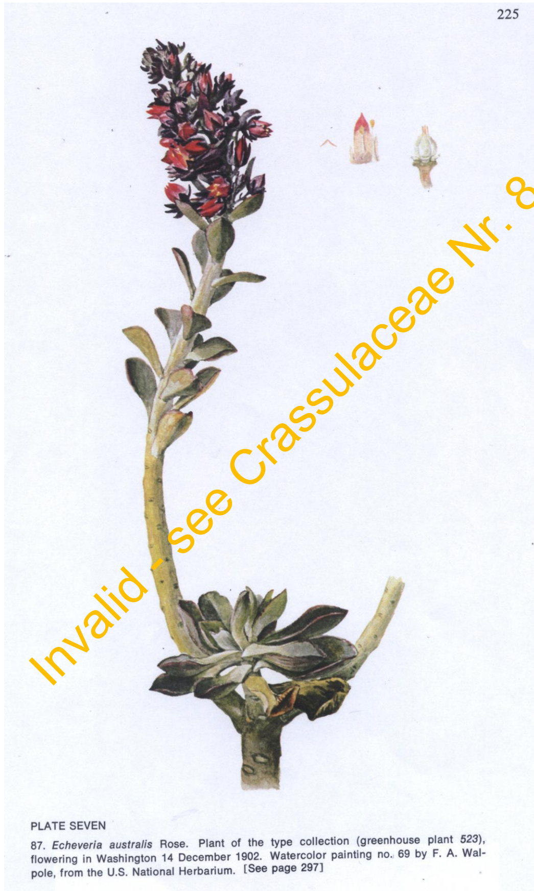
Fig. 3. Copied from E. Walther, Echeveria 225, 1972.