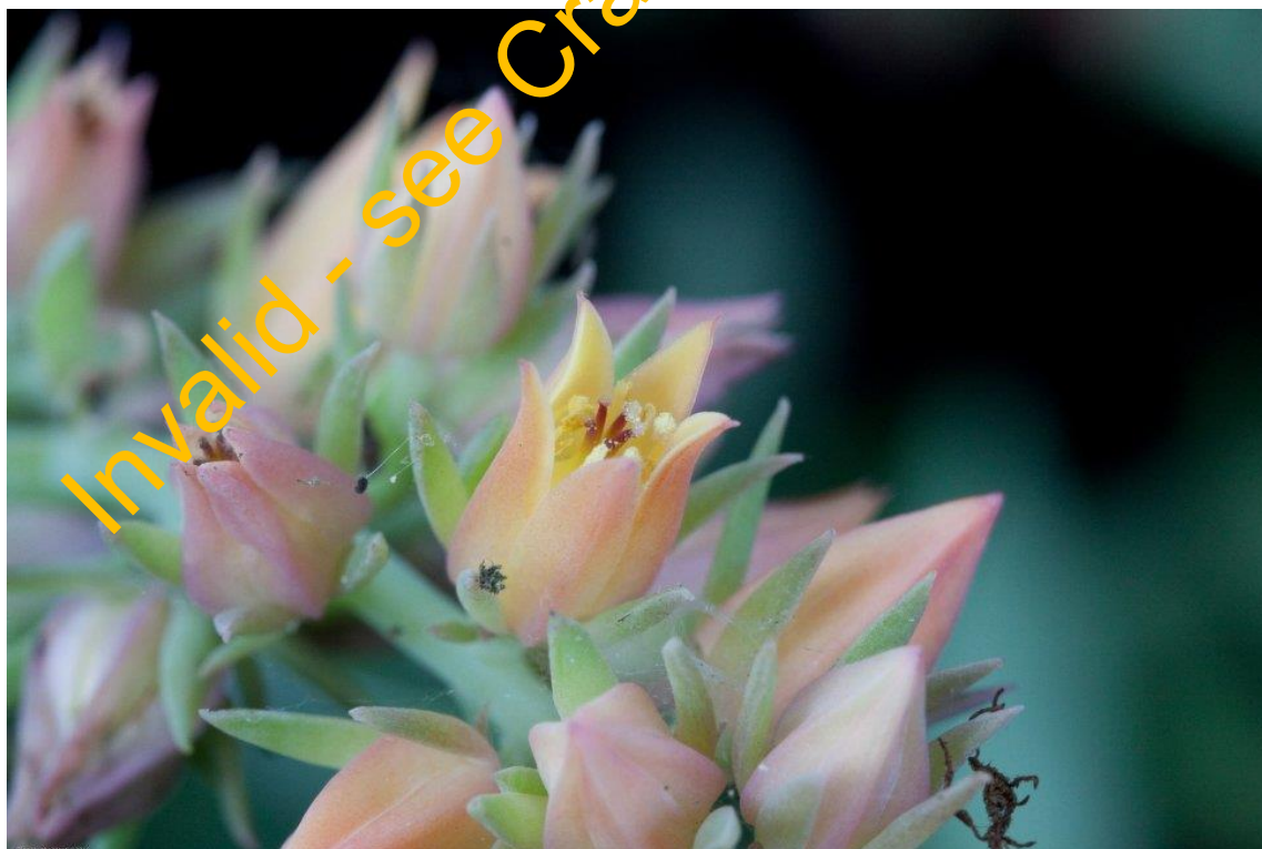
Fig. 2. Photo published in Flora Mesoamericana online, wrongly determined as E.australis .