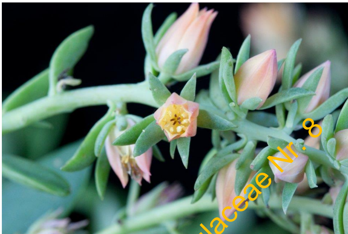
Fig. 1. Photo published in Flora Mesoamericana online, wrongly determined as E.australis .