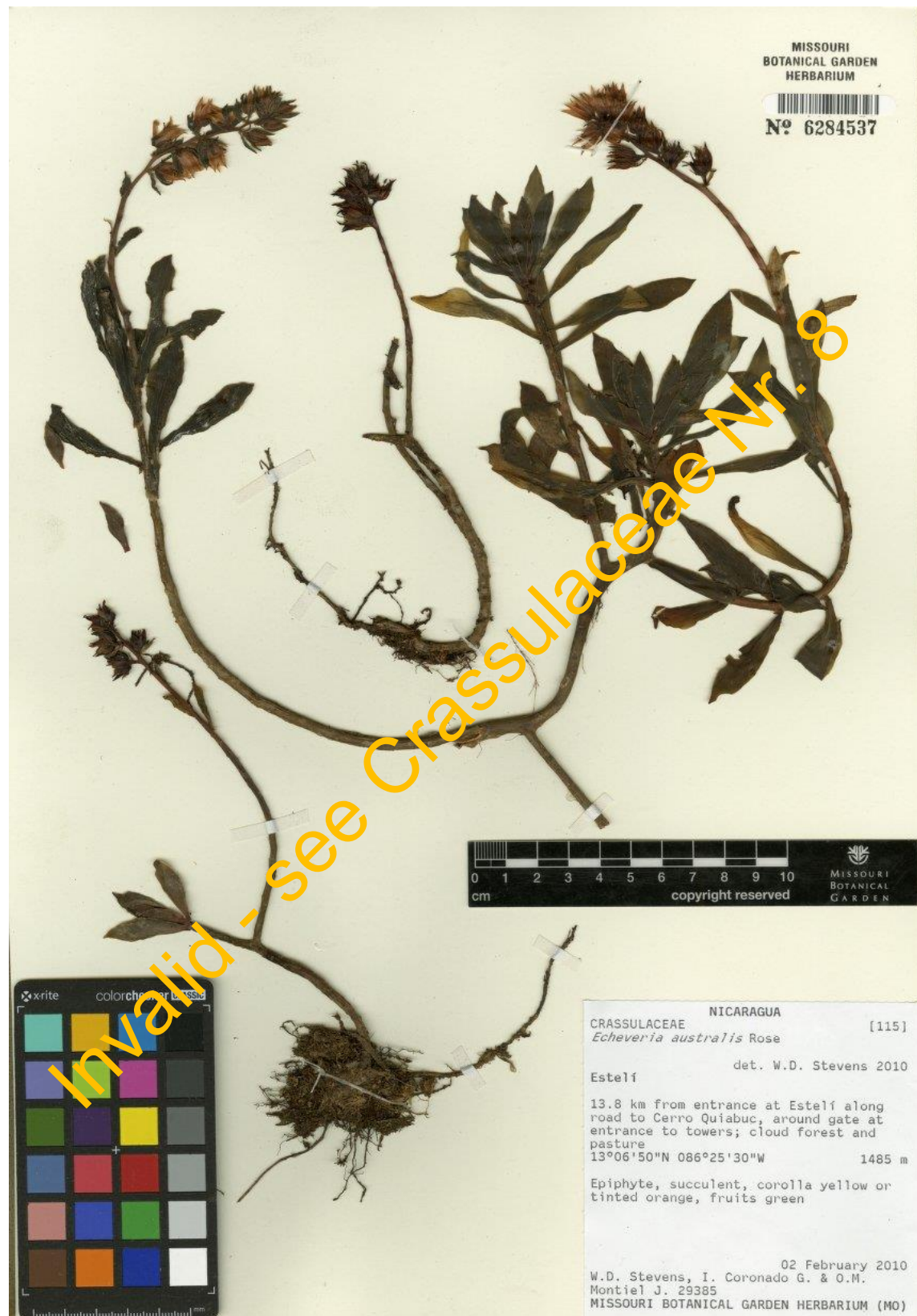
Fig. 5. E. guatemalensis Rose, wrongly determined as E. australis Rose.