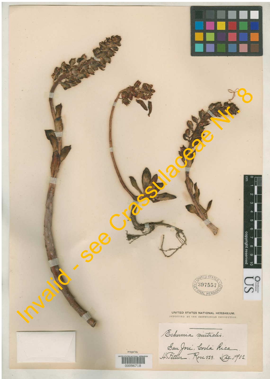
Fig. 4. Type specimen of E. australis Rose.