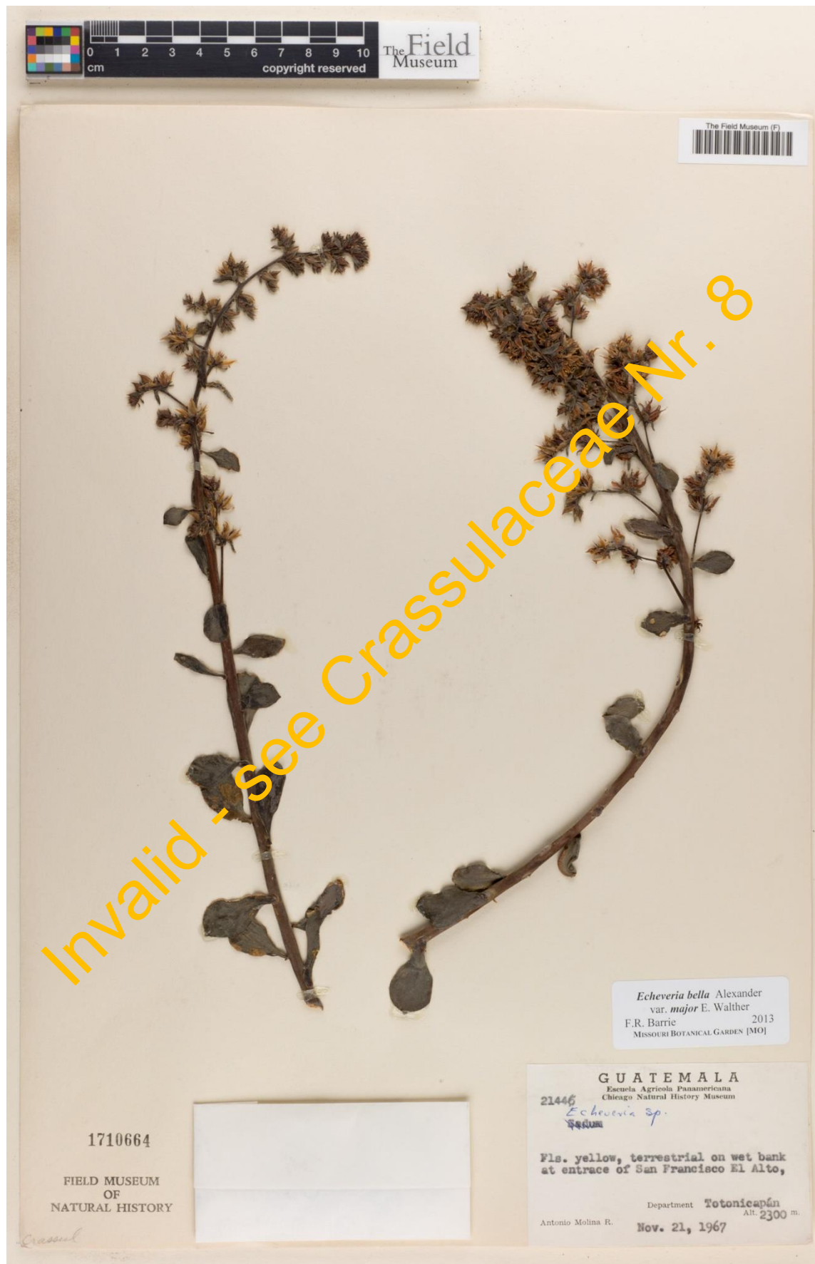
Fig. 8. Specimen collected in Guatemala, wrongly identified as E. bella fa major .