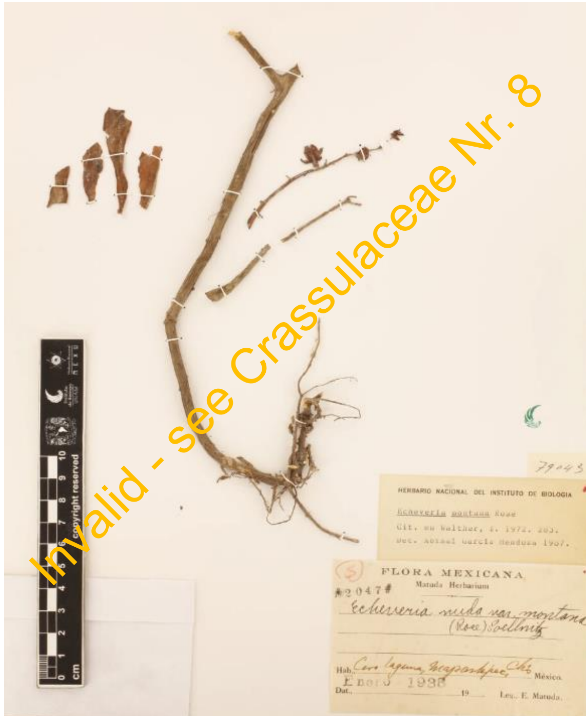
Fig. 9. Matuda 2047 – no proof for the presence of E. montana in Chiapas.