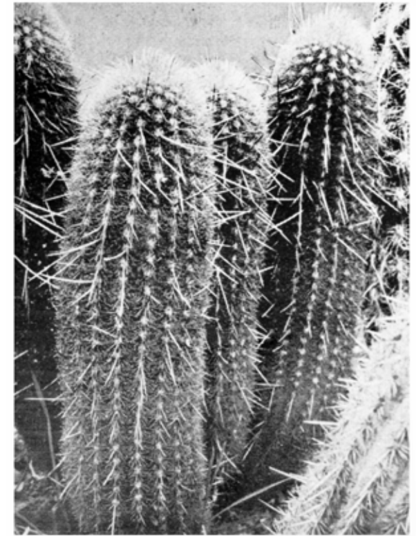
Cereus pseudomelanostele Werd. et Bckbg nov. spec.

Ref: Haageocereus kagenekii (C.C.Gmel.) Mottram.