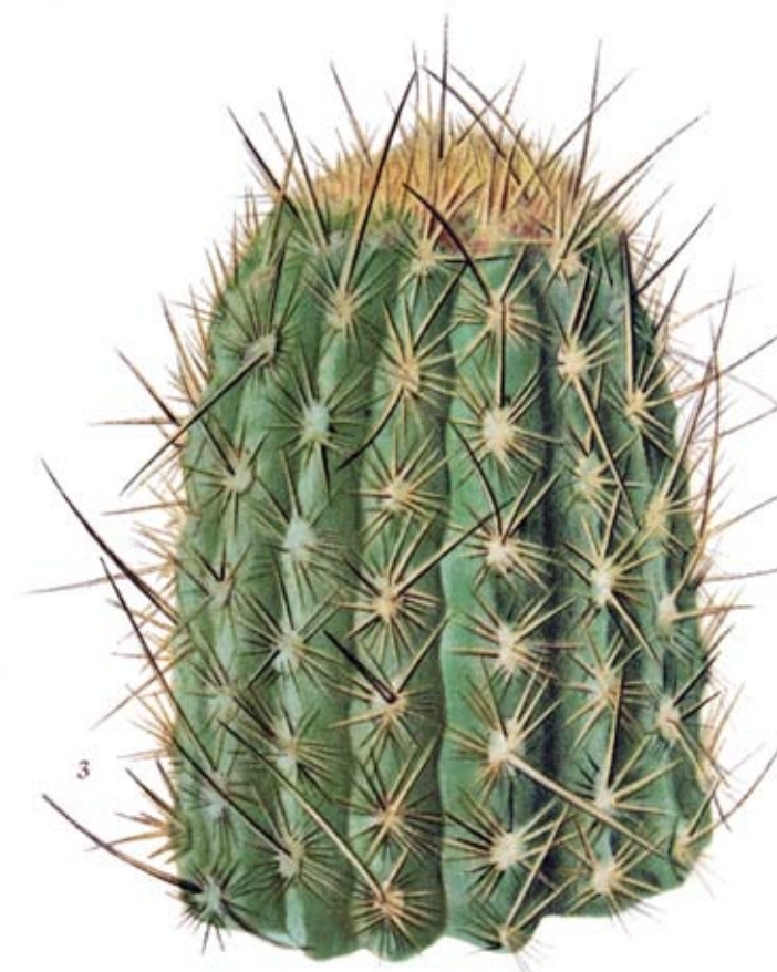
3. Top of branch of Binghamia melanostele . (Natural size.)

Fig. 7 Britton & Rose material associated with Binghamia melanostele : Sketch of a fruit based on a photo taken at Santa Clara.