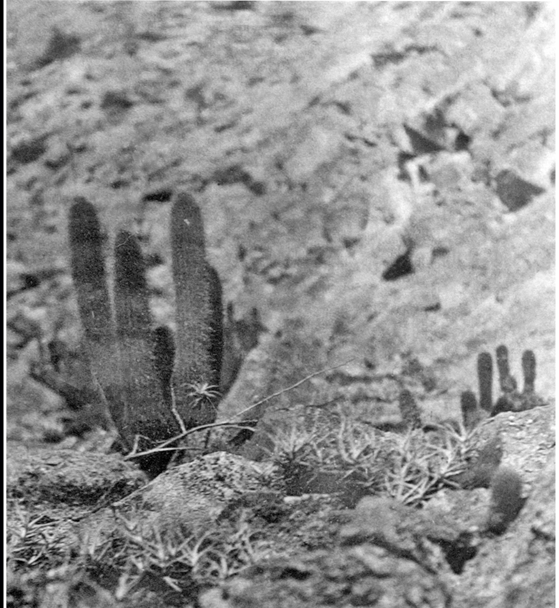
Fig. 13. Binghamia melanostele : Peru, Dept. Lima, Larigancho-Chosica Distr., vicinity of Chosica; 30 Jun 1914, Mr. & Mrs. Joseph N. ROSE 18533; NY 02219096.