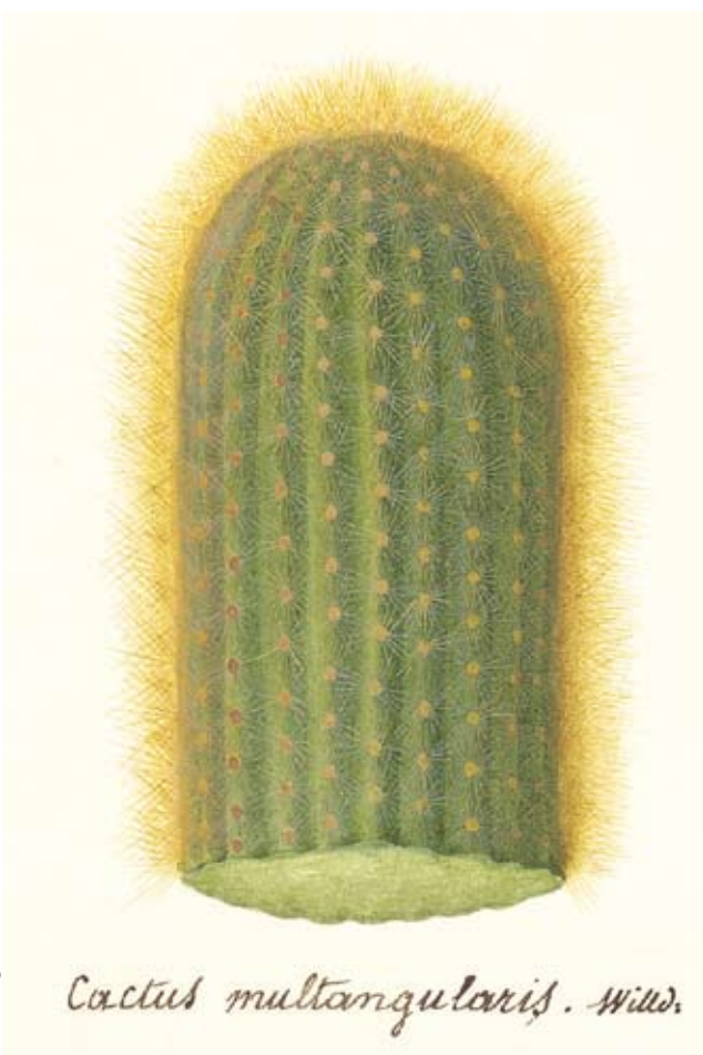
Cactus multangularis . Willd.

Reproduced in Rowley (1999: 15, t.19). Leuenberger (2004: 317-319) misapplied the name Weberbauerocereus winterianus F.Ritter to this illustration, misled by the golden spination which was somewhat crudely depicted. Ritter's plant was not discovered until 1953 at locations nowhere near Dombey's routes.