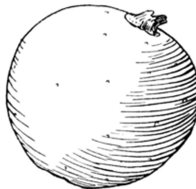
FIG. 238.—Fruit of B. melanostele . X0.6.

Fig. 6 Britton & Rose material associated with Binghamia melanostele : Photo of Rose 18558 in the vicinity of Santa Clara, near Lima, taken by Rose in Jul 1914.