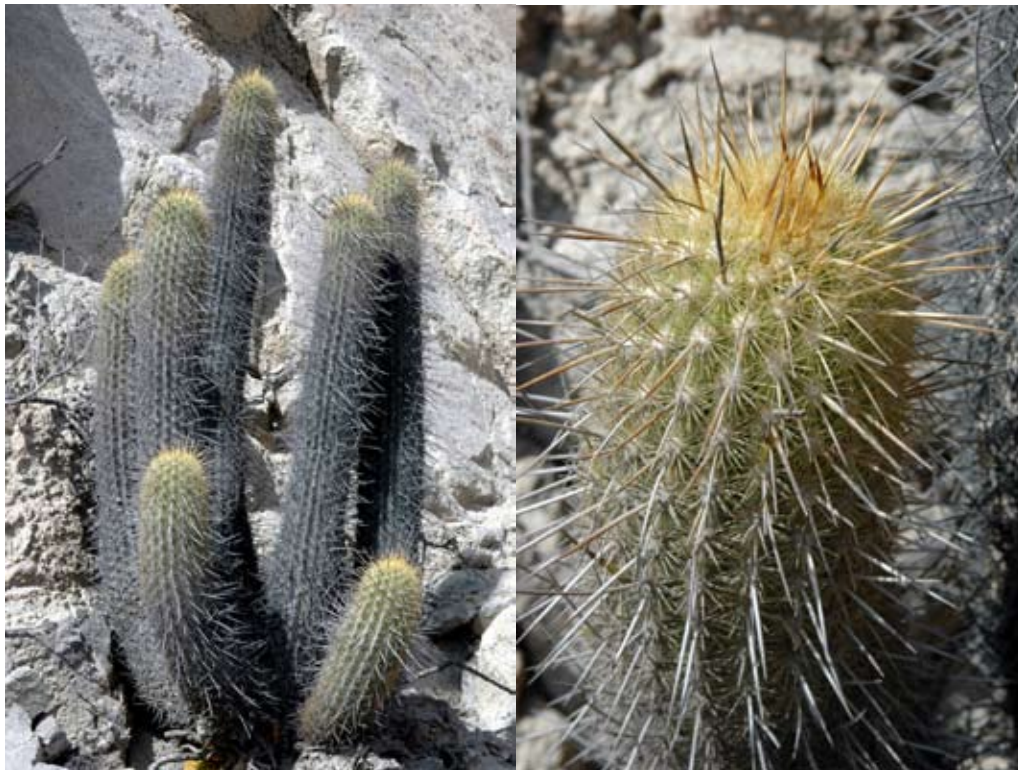
Fig. 15 Modern photos of Haageocereus kagenekii from near the type locality of Binghamia melanostele PH773.02 (Peru, Rio Rimac valley, California, near Chosica, 990m., 21 Jul 2008).