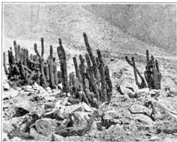
FIG. 236.— Binghamia melanostele .

Notoriously, Britton & Rose (1920: 167) misapplied the name Cephalocereus melanostele Vaupel to this plant, under an illegitimate new genus, later synonymising it under the earlier name Cactus multangularis Willd. in the Appendix to their work (1923: 279) under their illegitimate generic name Binghamia . (Fig. 6-9).