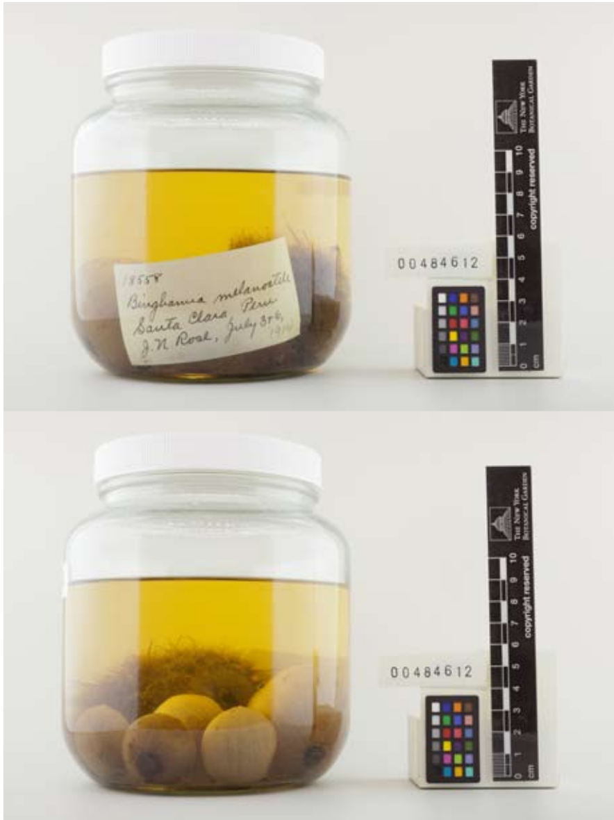
Fig. 10 ROSE 18558 NY 484612 . This contains two separate gatherings making it ineligible as a type.

Then follows another long history of confusion as to whether multangularis or pseudomelanosteles was its correct name, with the latter usually winning because of uncertainty about the identity of the former. Thankfully, this long concatenation of mistakes can now be swept aside and the earliest and demonstrably correct name applied.