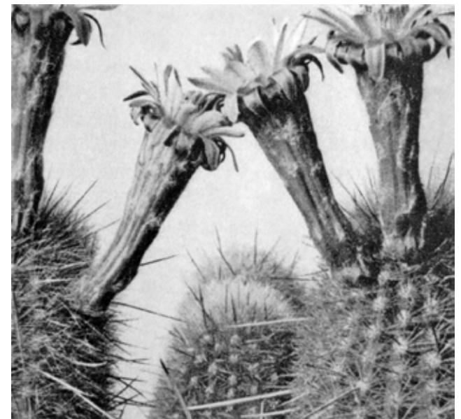
Fig. 11-12 Cereus pseudomelanostele (Peru, Dept. Lima, near Cajamarquilla) Photographed by Backeberg at the Cajamarquilla Inca ruins, not far from Lima city, and later flowering in Europe).