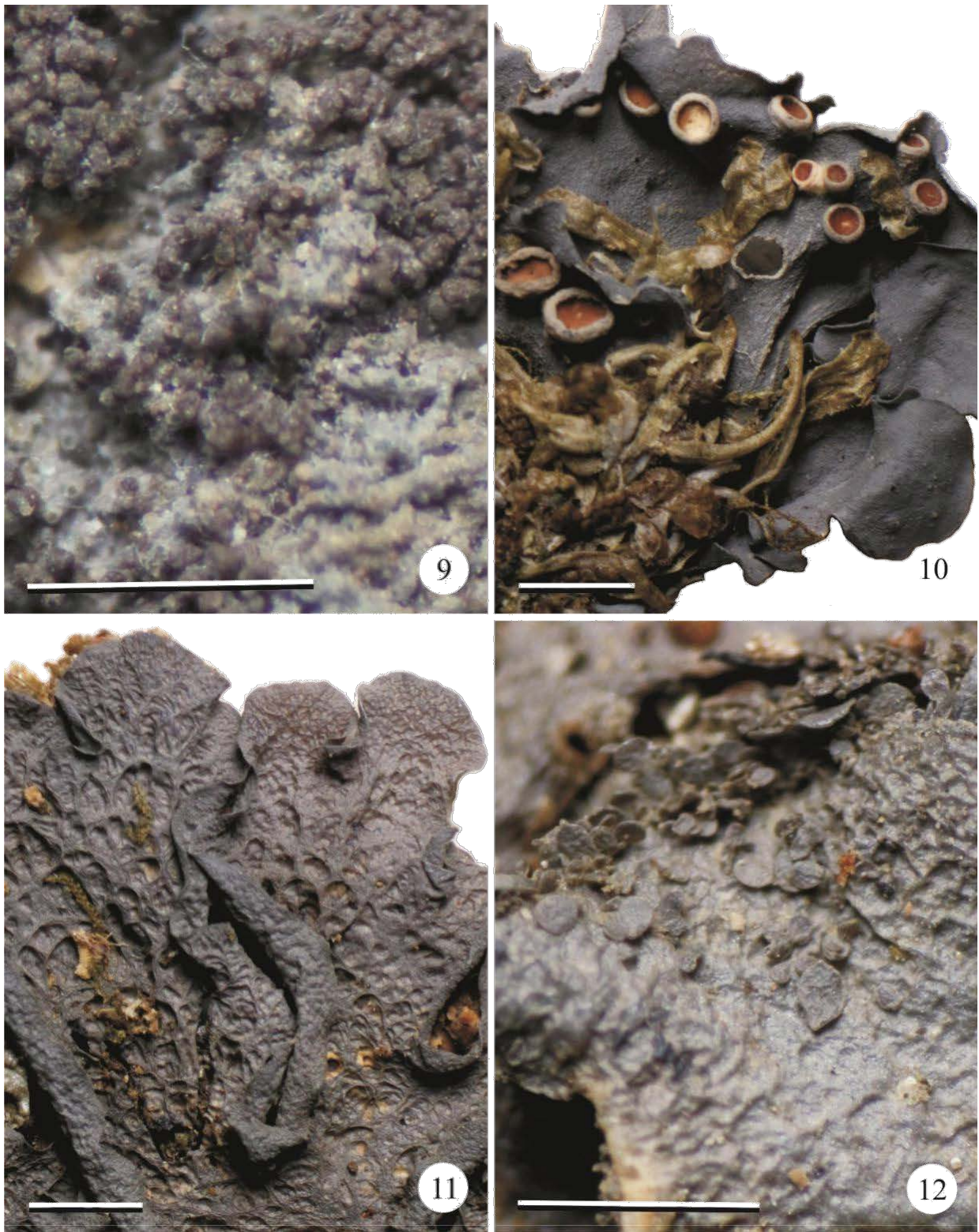
Figs 9–12 – Leptogium species. 9 Details of granular isidia of L. milligranum . 10 Subpedicellate apothecia of L. moluccanum (SP 466596). 11, 12 L. sulcatum (SP 466563). 11 Details of surface. 12 Lobules on the furrow. – Bars: 9, 12 = 0.5 mm; 10, 11 = 2 mm

precise descriptions, and difficulty of recognizing species. We have yet not examine all types related to the studied species and their synonyms, and concordant names were used to identify found species. Therefore, we are aware that several names can change with a more throughout revision of the genus.