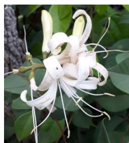
Fig 1. Spiranthera odoratissima leaves and flowers (Rutaceae).

RI exp : Retention index relative to n -alkanes (C 8 –C 20 ) in the Rtx-5MS column; RI lit : Retention index found in the literature [6]. RA%: relative area. (–) = not detected.