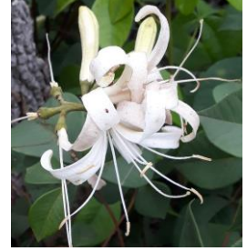
Fig 1. Spiranthera odoratissima leaves and flowers (Rutaceae).

RI_{exp} : Retention index relative to n -alkanes ( C_8-C_{20} ) in the Rtx-5MS column; RI_{int} : Retention index found in the literature [6]. RA%: relative area. (–) = not detected.