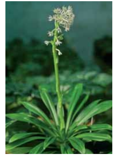
Ypsilandra yunnanensis var. fansipanensis , inflorescence (top) and habit (above)

yumanensis, but differs in the regular shape, size and greater number of leaves, longer stamens that often slightly exceeded the tepals, and capitate inflorescence with more flowers.