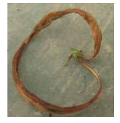
The epiphytic Lilium eupetes in fruit, growing wild in north Vietnam (above left). The maroon flowers (top right) are usually solitary and the scaly bulb (above right) is about 2.5cm in diameter - any larger and it might have difficulty remaining on the tree. One of the most distinctive features of this new species is the aerial dispersal of the bulbils (right): they are buoyed on air currents by the dead leaf