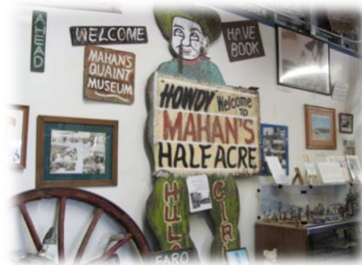
Route 66 Museum in Victorville, California

In a place such as California, which Chassey feels is "notorious for tearing things down," he states that the museum's main goal is to save whatever it can for the benefit of future generations. 8 When there are large historical pieces they are unable to save, such as buildings, the museum endeavors to document such artifacts in pictures and written descriptions. In this way, they are preserving as much history as they possibly can, and providing the community with a sense of its origins and its importance. It is likely that, in their absence, much of the cultural artifacts and knowledge that they have accumulated would have been lost forever. Despite their considerable contribution to the community, the Victorville Route 66 Museum faces several challenges with regard to finances, community support, and adequate numbers of volunteers. 9 Hopefully the museum can continue to achieve its goal and survive, as its presence in the High Deserts constitutes fully half of the area's museums.