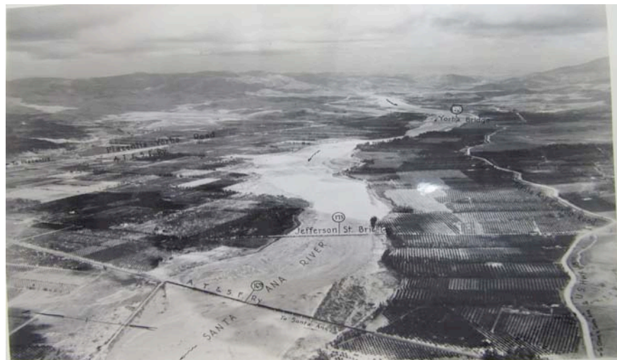
Figure 12. Photo taken 3/3/1938. View looking northeast on Santa Ana River. Note the arrow pointing to Yorba Bridge. Compare the two photos, the size of the Santa Ana River and permanent developments encroaching on the floodplain as to agricultural land.