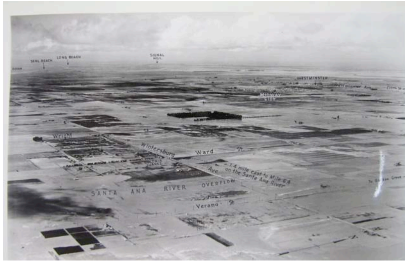
Figure 10. Reproduced from the Holdings of the National Archives at Riverside. Picture was taken 3/3/1938 by the Army Corps illustrates widespread flooding over Northern Orange County looking northwest. Notice the flood waters reflection-covering most of the County.

The 1938 March flood devastated southern California. These images are just snap-shots of the areas affected by the Santa Ana River and its tributaries, but the flood's destructiveness impacted the Los Angeles community as well. Total damage and loss of life figures vary depending on which source one examines. The San Mateo Times headlines on March 4, 1938 read, "Death Toll Now Near 250." 83 The Nevada State Journal claimed 400 dead on March 6, 1938. 84 In recent years the death toll is still debated. An article appearing in The Press-Enterprise indicates that the number of dead was at least 175 people, but recognizes that the "death toll is difficult to pin down." 85 The reporter refers to Suzie Earp, 86 who at the time (2003) was a master's student at