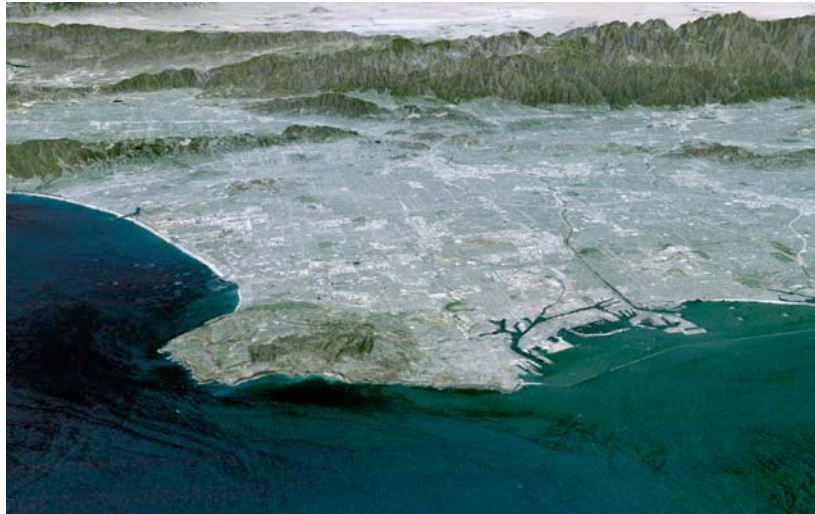
Figure 1. Enhanced Satellite Photo from Jet Propulsion Laboratories (JPL) depicting steep transverse mountain ranges in comparison to the relatively flat land of southern California.

Nevertheless, the enhanced satellite image, as a visual aid, illustrates the formation of a basin in relation to steep mountain ranges. Notice the Los Angeles River right of center next to the L.A. Harbor as it makes its way to the San Gabriel Mountains and the Santa Ana River at the far right. High elevations allow the water to run off quickly and then form natural waterways. These waterways or tributaries converge to form rivers like the Santa Ana and Los Angeles River. Much like the ancient expression, “All roads led to Rome,” all the Inland Empire’s tributaries lead to the Santa Ana River, making it a formidable and potent river when heavy rain occurred.