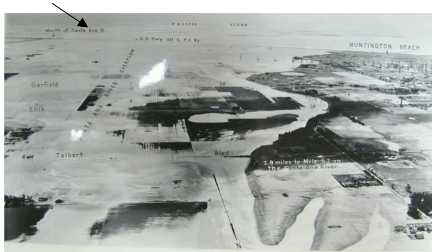
Figure 9. Photo taken 3/3/1938. View from Orange County looking west. Notice the mouth of the Santa Ana River to the top-left.