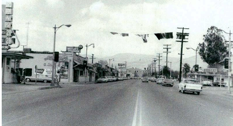
Figure 1. Mount Vernon Avenue facing North during the 1950s. San Bernardino, CA