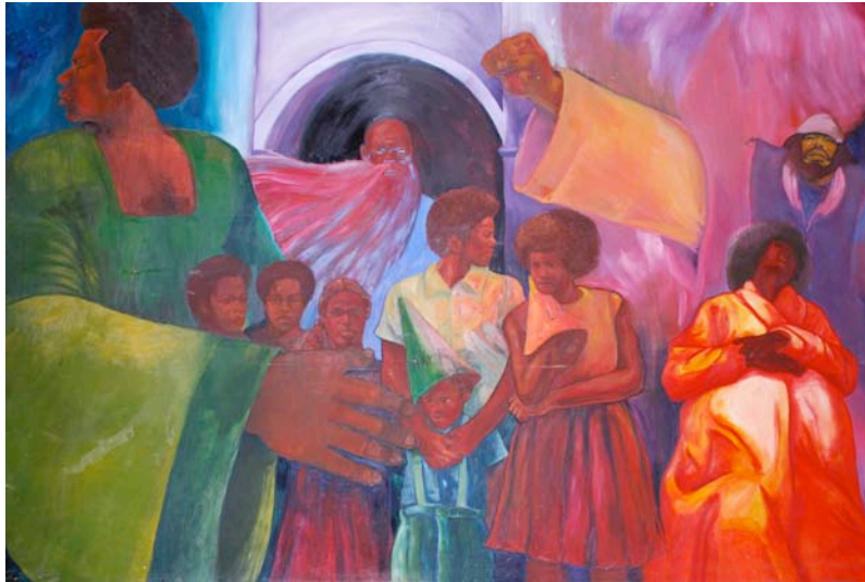
Untitled , 1971. Los Angeles, CA. Mural by Richard Wyatt and Guillermo Anderson.

The exhibit effectively uses its vibrant and evocative visual media to supplement its history. An example of this historical narration using visual media can be seen in the photo series, “Life in a Day in Black L.A.,” which documents the grim repercussions of the Los Angeles Riots in 1992 for L.A.’s black communities.