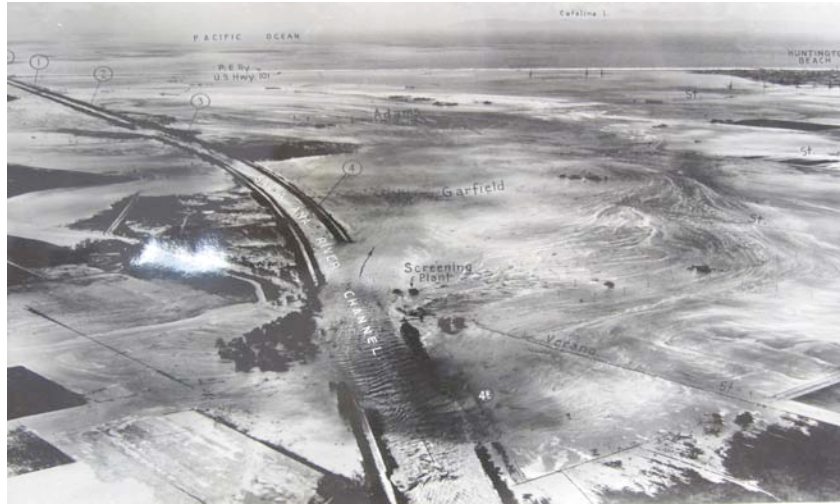
Figure 8. Photo taken 3/3/1938 View from Orange County looking west. Notice the breach in the levy submerging nearby cities in water.