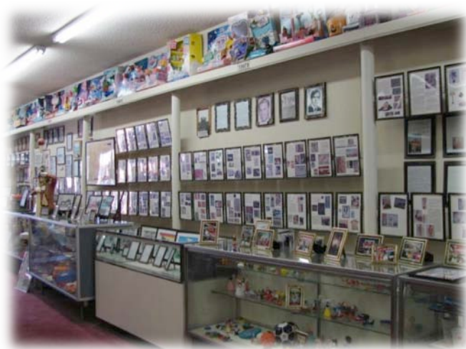
"Unofficial" McDonald's Museum

One such institution engaged in this noble pursuit is the Unofficial McDonald's Museum on E Street in downtown San Bernardino. Built on the site of the original McDonald's Hamburgers restaurant, which opened in 1948, the unassuming building boasts the large sign that drew customers into the first drive-through establishment beginning in 1953. Though the building itself is not original, as the restaurant was torn down in 1972, it marks the very spot where the birth of a pop culture icon and the fast food industry took place. Inside, visitors find a veritable mountain of material, including photos, retired playground equipment, advertising signage, Happy Meal toys, and literature. As is often the case with small institutions such as this, every available corner and surface is utilized to display the abundant artifacts.