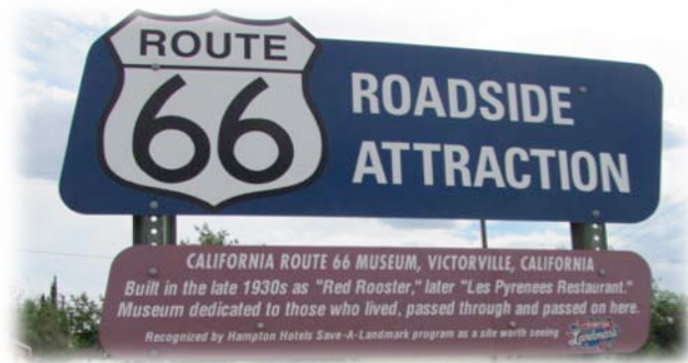
Signage outside the Route 66 Museum in Victorville, California (personal photo by author) 5