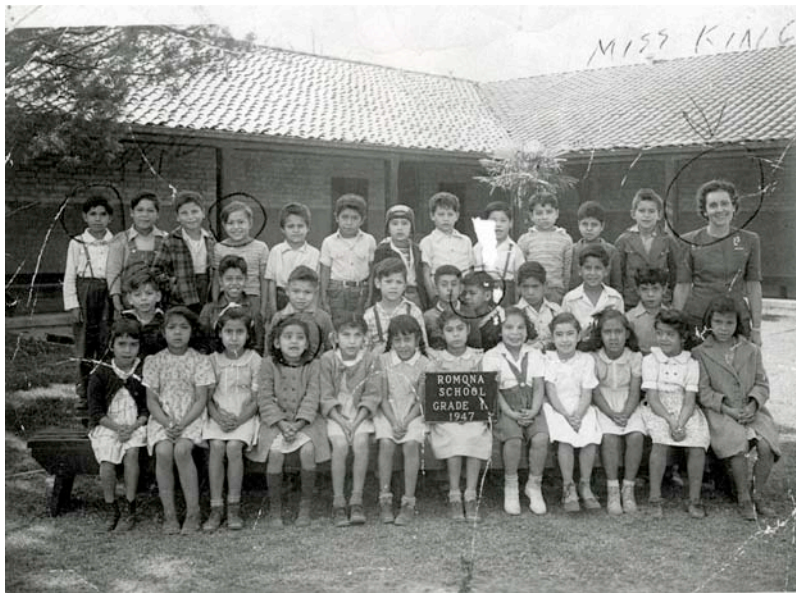
Figure 2. Ramona Elementary Class photo, 1947. San Bernardino, CA, (Courtesy of Manuel Delgado).

subjects” and “vocational opportunities [might] open [them to] become interested in remaining in school in order to make furniture or cook and sew.” 32 Gilbert Gonzales has also noted that educators who advocated segregation supported vocational training that could Americanize the children in a controlled cultural and linguistic atmosphere and train them for occupations that Anglos considered best suited for them. 33 Ramona Elementary offers an example of the effort to provide vocational training in a segregated environment.