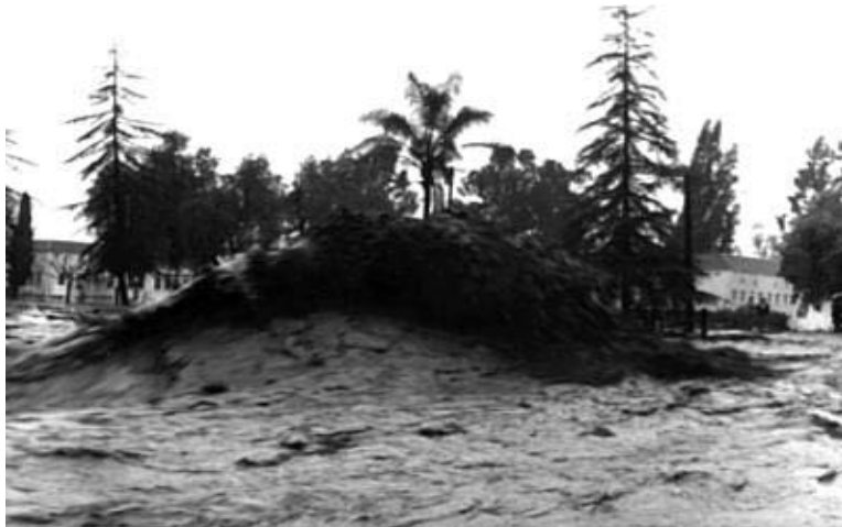
Figure 2. Flood of February 1969. “Wave action approaching Anderson Street Bridge” in Loma Linda, CA

However, it is not the only factor contributing to regional floods. Flooding affects regions miles away from the Santa Ana River. Tributaries are the veins of the Santa Ana River and also unleash havoc on local residents. Case in point, the San Timoteo Creek is a tributary to the Santa Ana River. The two converge near the I-10 and I-215 freeways in the city of San Bernardino. Even within the San Timoteo Creek other creeks converge on it like Wilson and Wildwood Creek. When the region experiences heavy rainfall the San Timoteo Creek overflows its banks and/or undermines manmade levees, which leaves the residents of Loma Linda and surrounding communities in turmoil. The photograph below depicts a large wave as it approaches the Anderson Street Bridge in Loma Linda during the February 1969 floods. 1