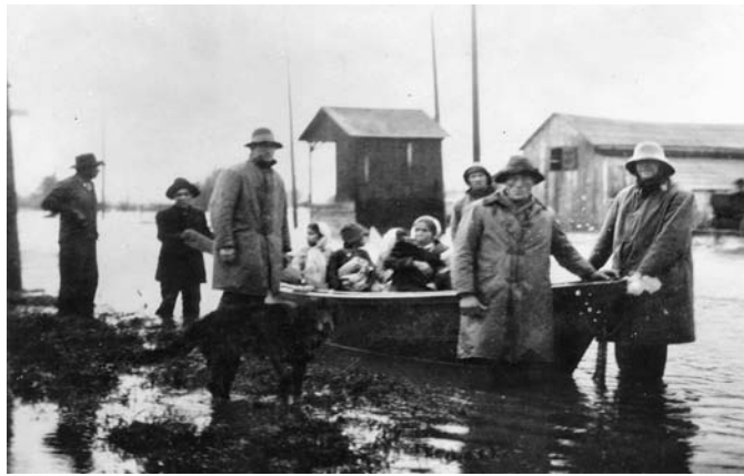
Figure 3. “Evacuating the Mexican quarter, 4 th and Artesia, Santa Ana, CA.”

flood eliminated all means of communication and transportation. 14 Disneyland, referred to as, “the happiest place on earth” would simply not exist in Anaheim if flooding persistently devastated the city. The picture below is an example of how the population coped with flooding.