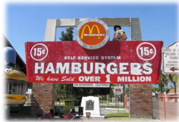
Original sign at the first McDonald's Restaurant 1