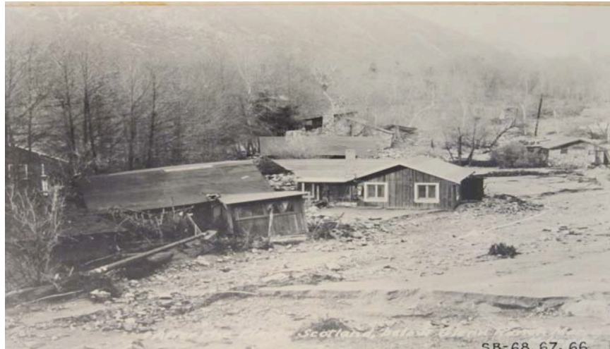
Figure 6. "Upstream view of damage in Lytle Canyon at 17.8 miles below Glenn Ranch, after March 1938 flood."