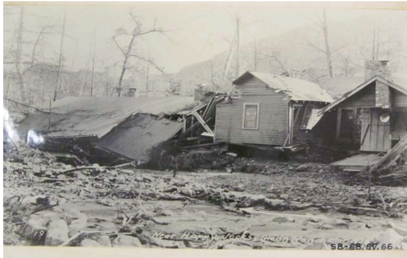
Figure 5. “View of damaged cabins in Lytle Creek below Glenn Ranch, after March 1938 flood.”

where the flood destroyed between 200 and 300 homes. 80 In San Bernardino County a hundred bridges collapsed and two miles of railroad track were undermined, crippling the rail system. 81 The flood not only brought quick moving destructive water, but vast amounts of debris that adversely affected the communities. The Army Corps gathered hundreds of photos of the Santa Ana River and tributaries flooding devastation and compiled them in a report titled “Photographs of Damage from Storm of February 27-March 3, 1938.” 82 The photos themselves provide an excellent pictorial record, capturing the detail and widespread damage incurred by the March flood.