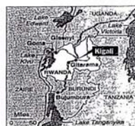
Rebel forces control positions in the hills around Kigali.

Aid workers say the militiamen are preventing Tutsi civilians from being rescued from the camps, churches and hotels where they have sought protection. "This is one of the reasons why we're hopeful the Security Coun-