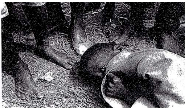
A young Tutsi, one of more than 1,000 who have taken refuge in a seminary from Hutu carrying out "ethnic cleansing," huddling under a blanket. The seminary, in the Rwandan capital, is surrounded by Hutu soldiers.