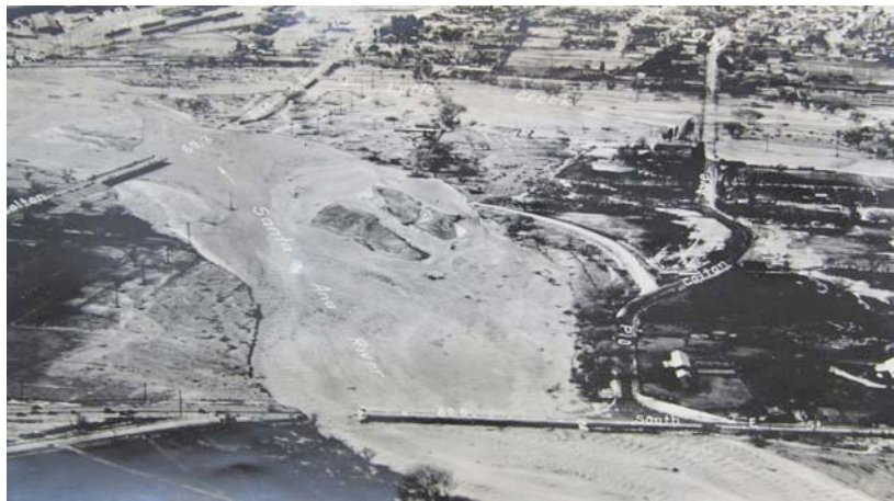
Figure 7. Photo taken 3/3/1938. Merging point of Lytle Creek and Santa Ana around the City of Colton. Notice the bridge failures.