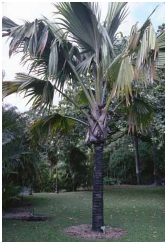
Lodoicea maldivica (coco-de-mer)