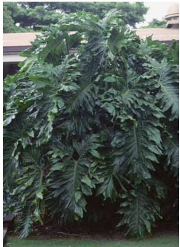
Philodendron bipinnatifidum (selloum philodendron)