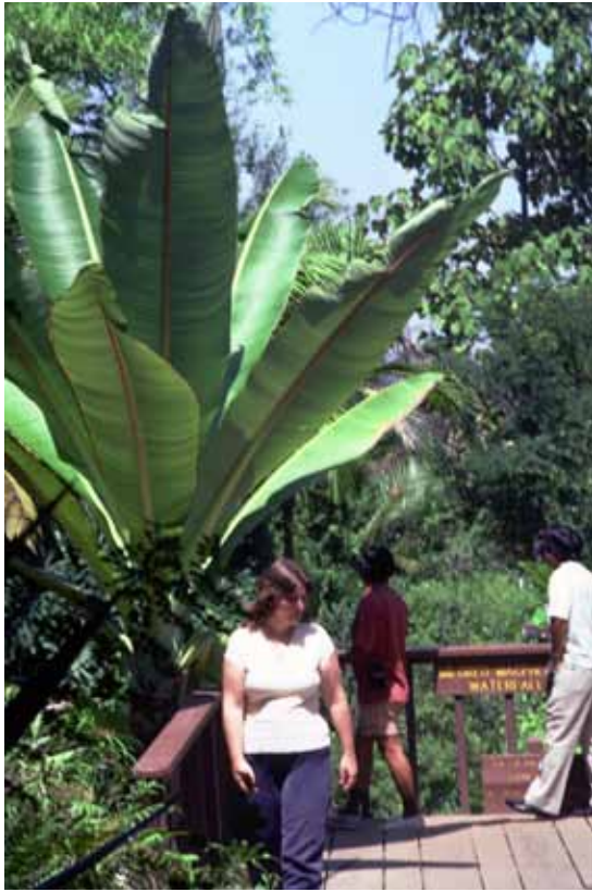
Ensete ventricosae (ensete banana)