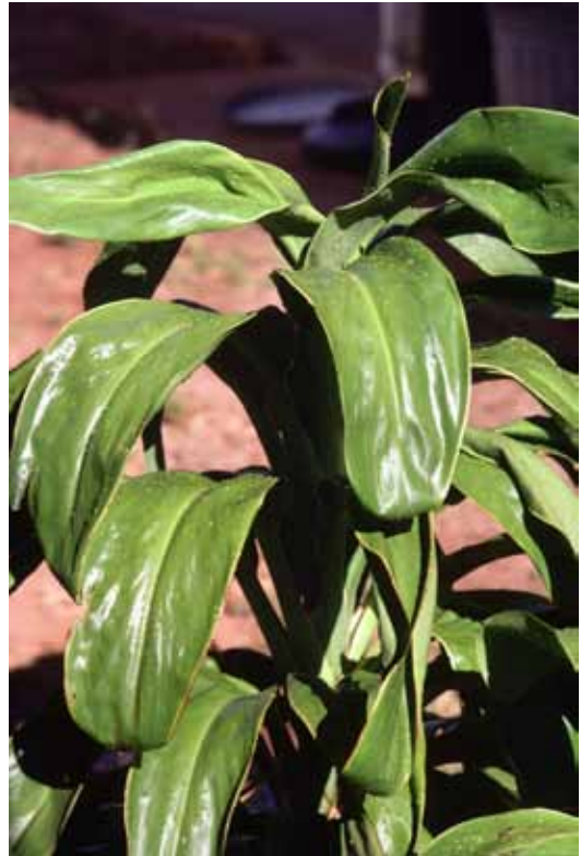
Cordyline fruticosa 'Floppy'