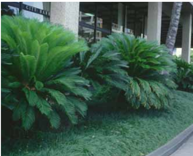
Cycas revoluta (Japanese sago palm)