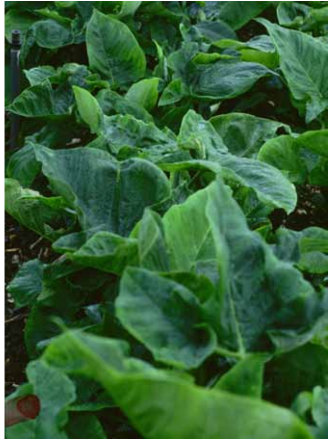
Xanthosoma brasiliense (Tahitian taro)