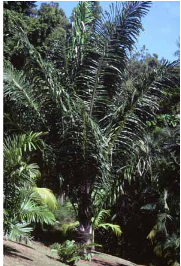
Arenga pinnata (sugar palm)