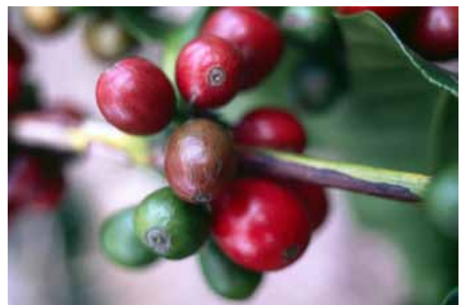
Coffea arabica (coffee)