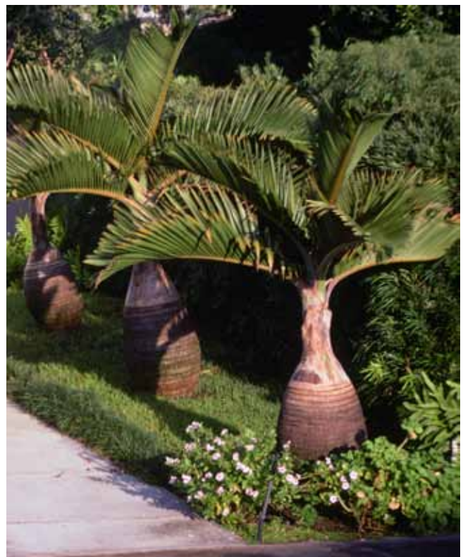
Hyophorbe lagenicaulis (bottle palm)