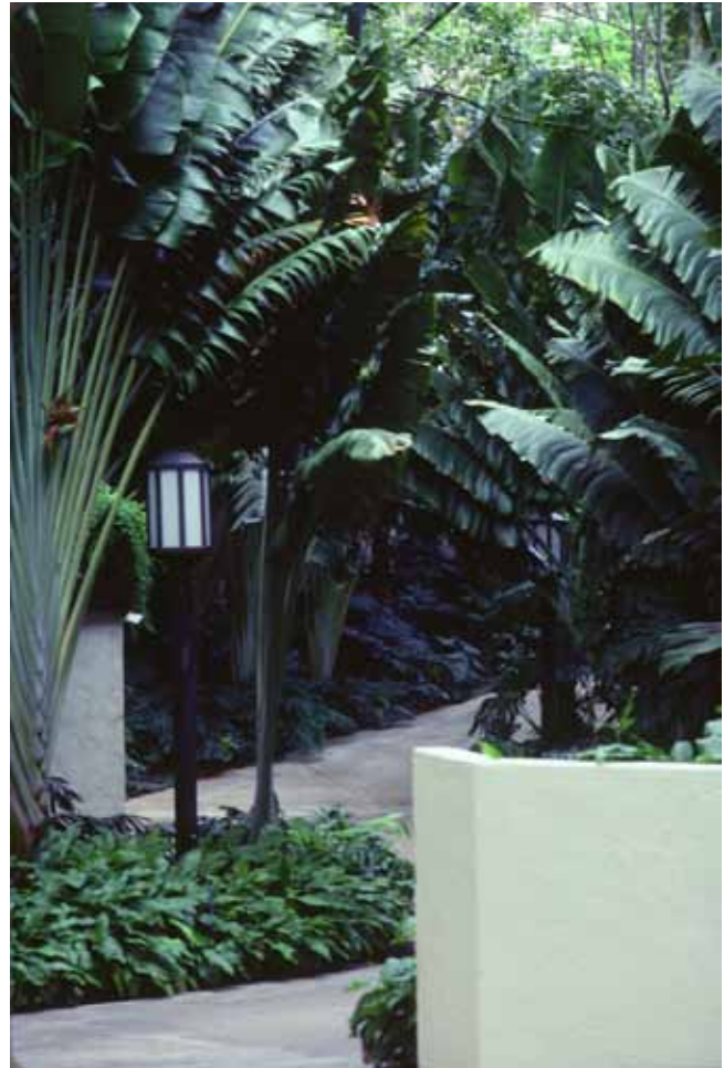
This view of Maunaluan Condominium, O'ahu, is dominated by traveler's palms.