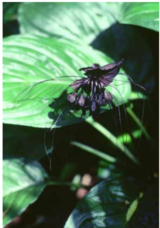
Tacca chantrieri (bat flower plant)