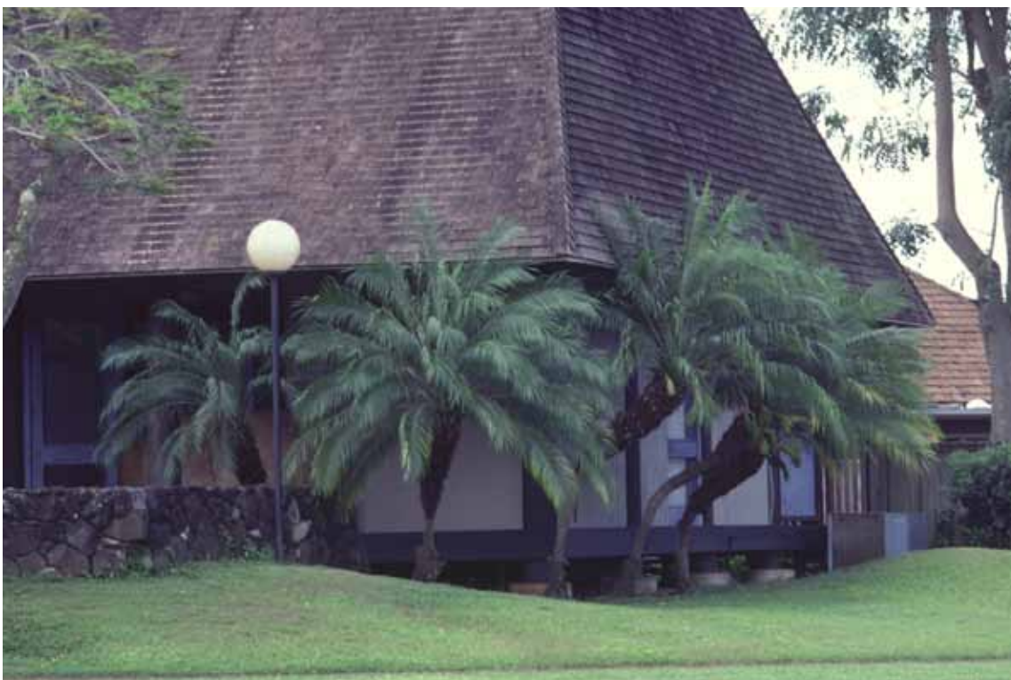
Phoenix roebelenii (dwarf date palm)