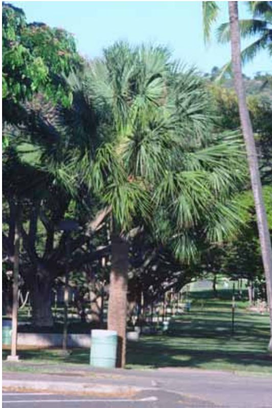
Sabal palmetto (palmetto palm)