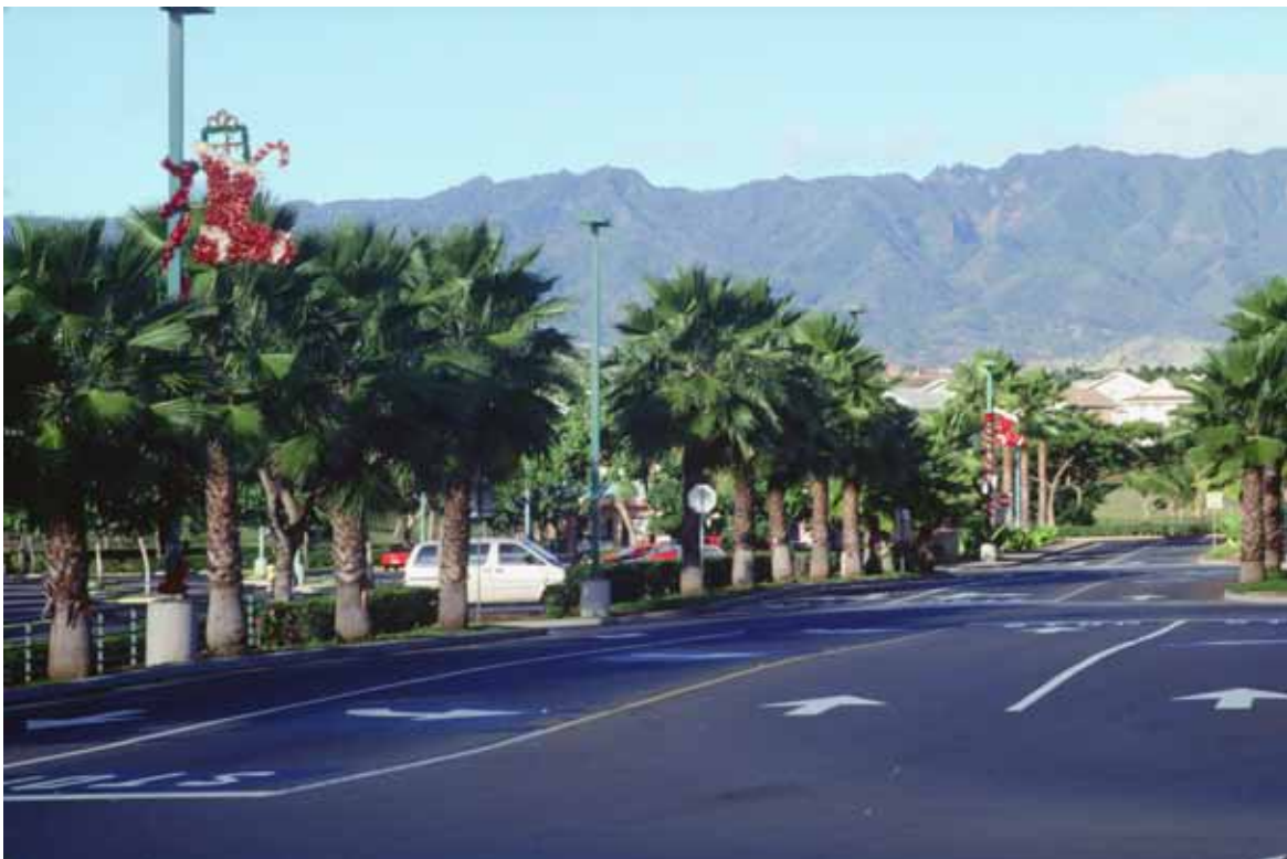
Washingtonia robusta (Mexican fan palm)