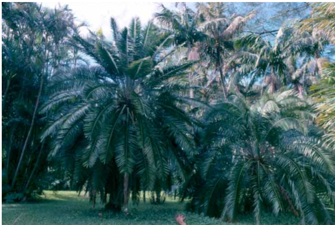
Phoenix rupicola (cliff date palm)