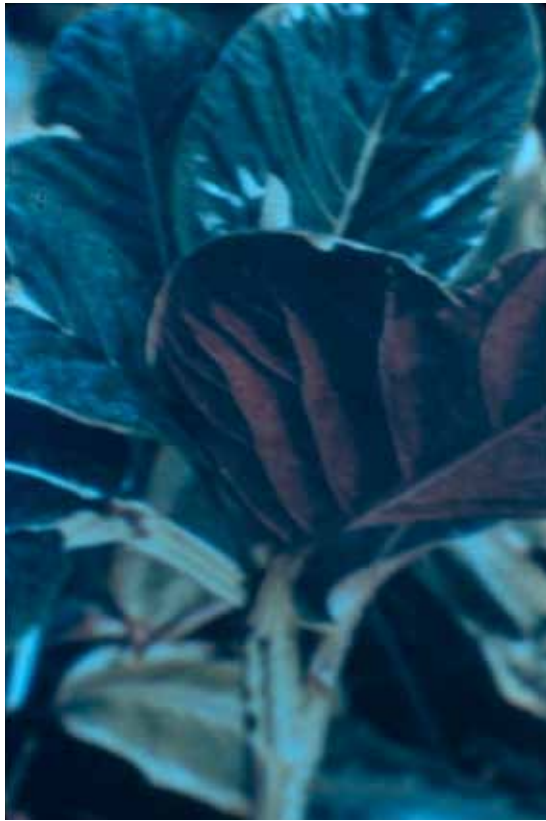
Piper magnificum (lacquerd pepper tree)