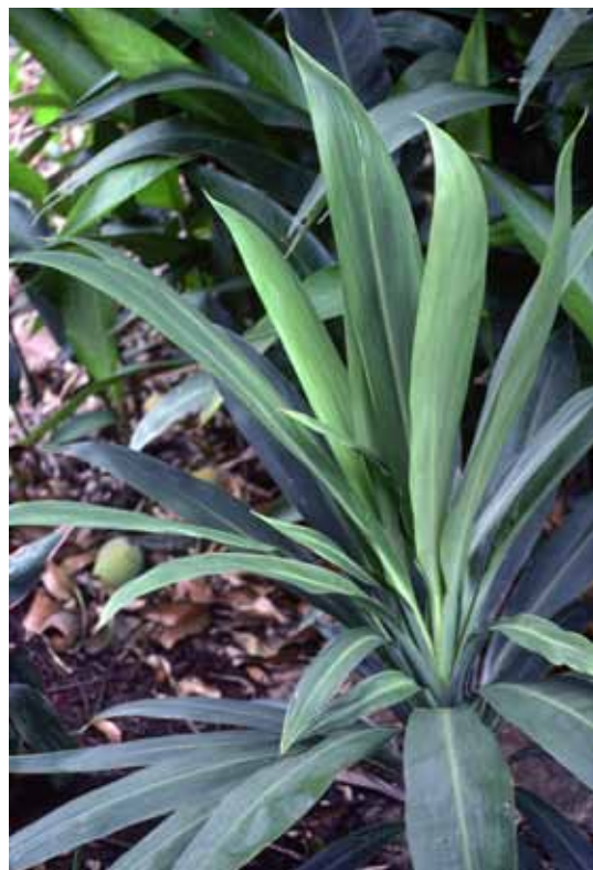
Cordyline fruticosa 'Green Flat'