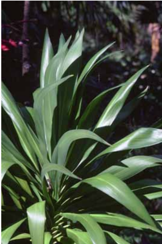
Cordyline bausei (bausei ti)