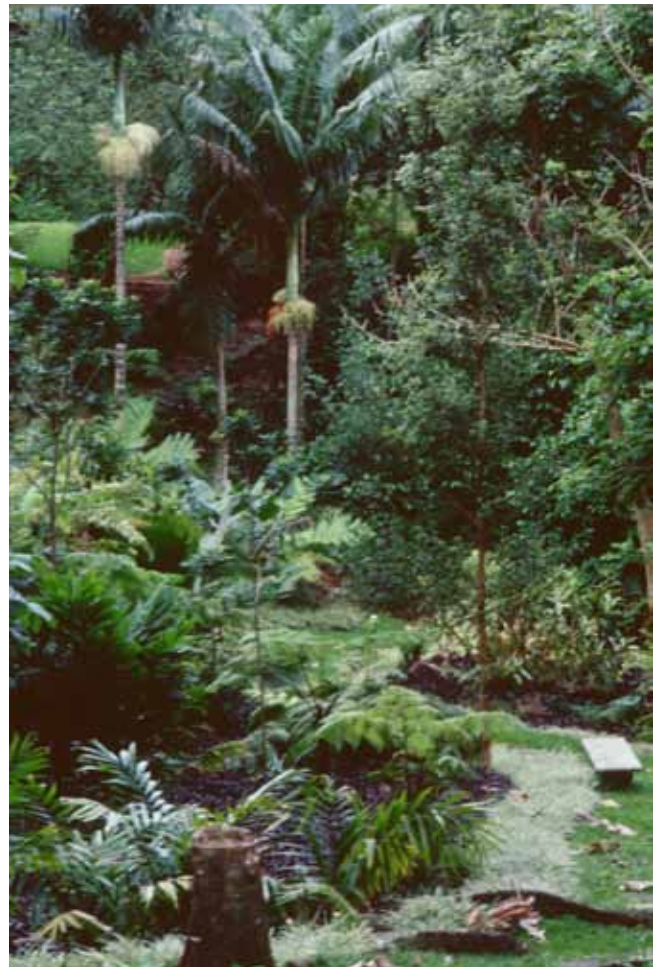
Lyon Arboretum, O'ahu

The following list of plants reflects the author's preferences. To make an effective all-green tropical landscape you do not need many plants, but the key is to choose plants that go together well.