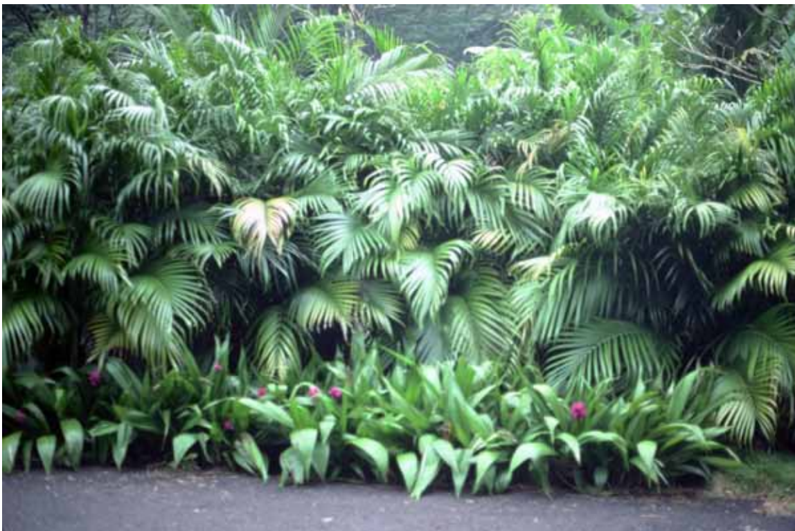
Chamadorea cataractorum (cascade palm)