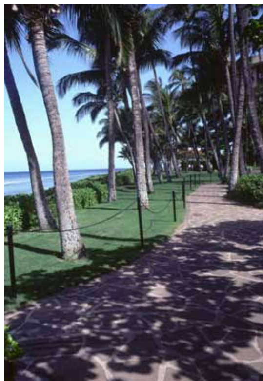
Cocos nucifera (coconut palm)