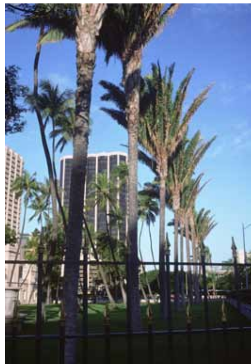
Attalea cohune (cohune palm)