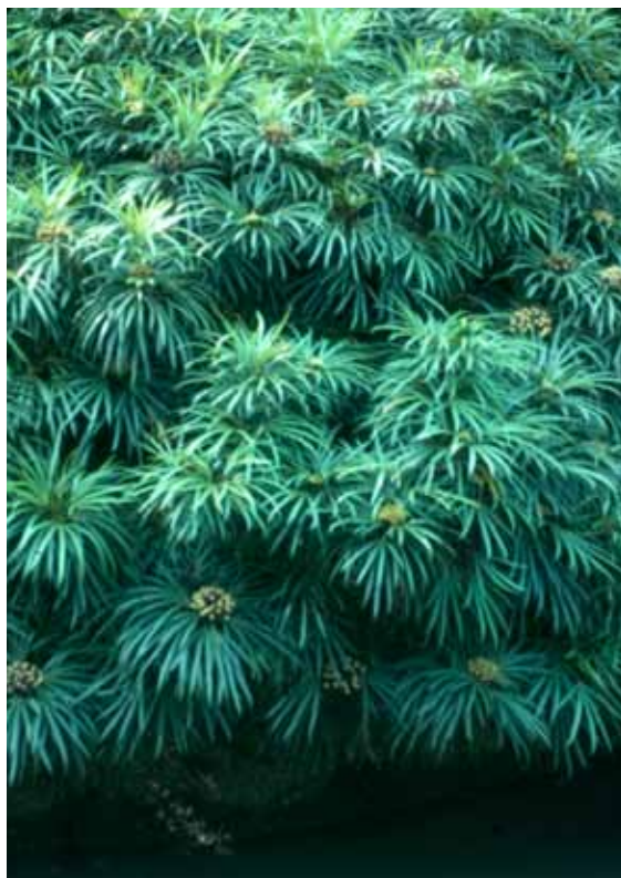
Osmuxlon lineare (Miyagos bush)