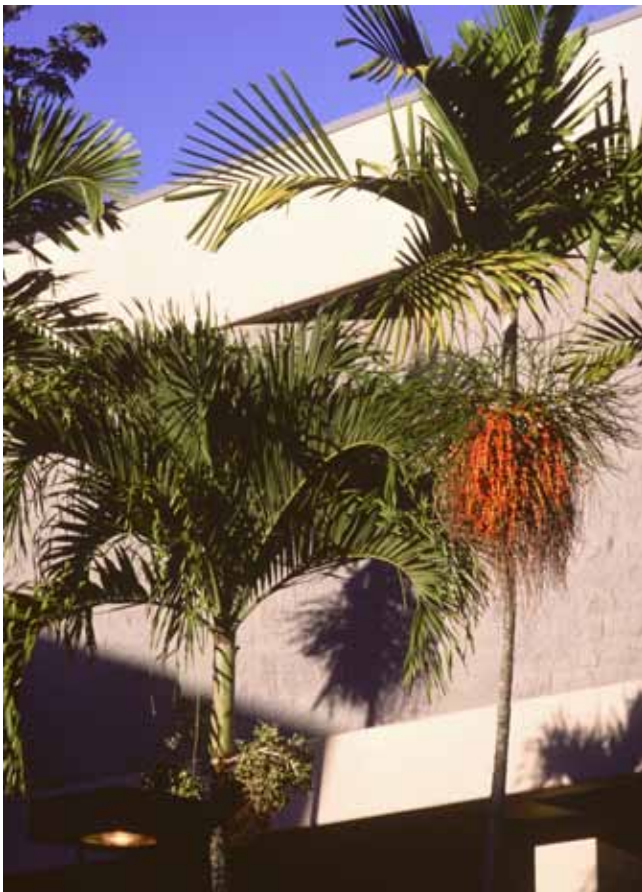
Ptychosperma elegans (solitaire palm)