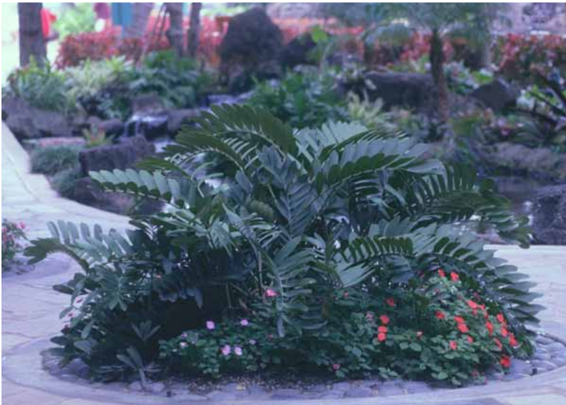
Zamia furfuracea (cardboard palm)