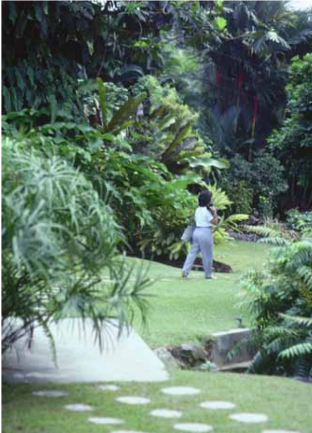
Mandai Orchid Garden, Singapore