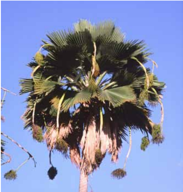
Pritchardia thurstonii (Masai palm)