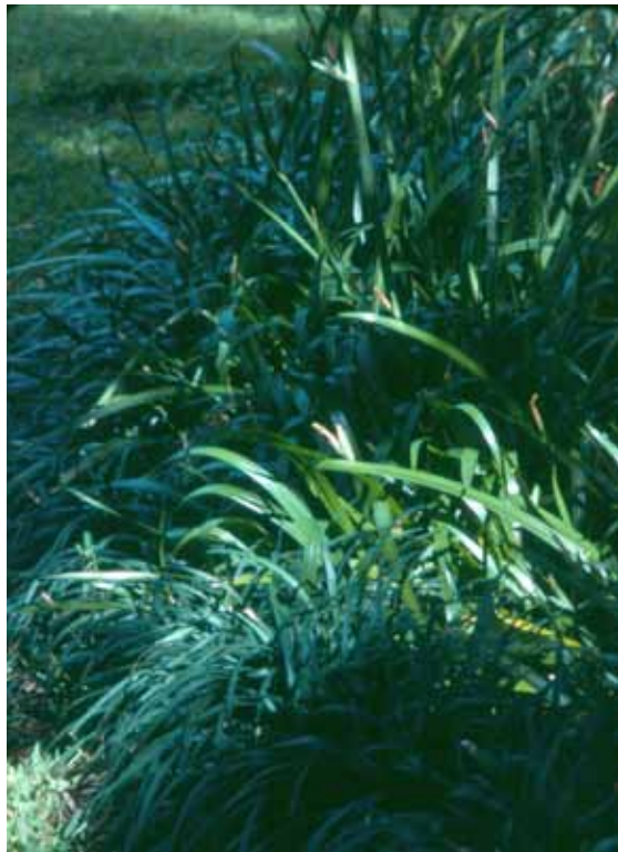
Neomarica gracilis (walking iris)