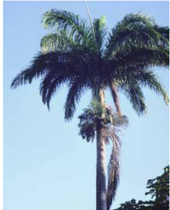
Roystonea oleracea (Carribbean royal palm)