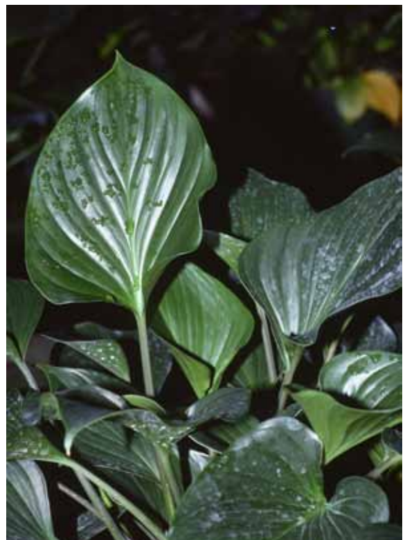
Alocasia cucullata (Chinese taro)