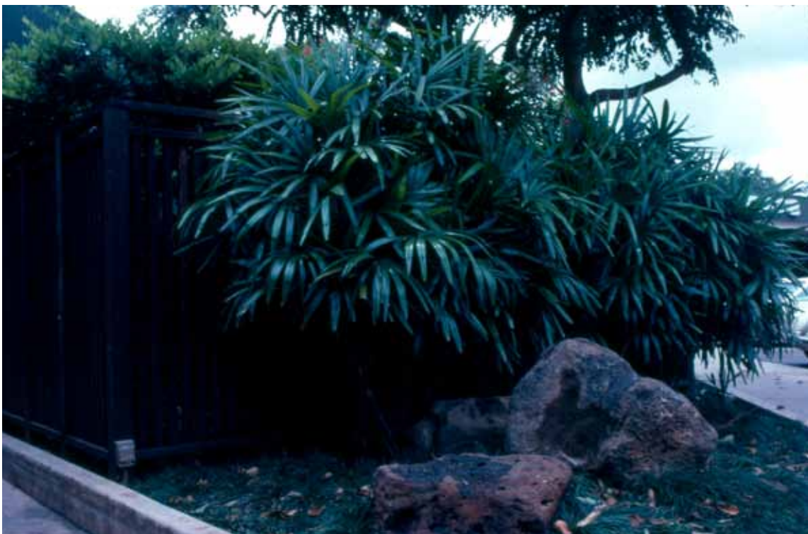
Rhapis excelsa (lady palm)