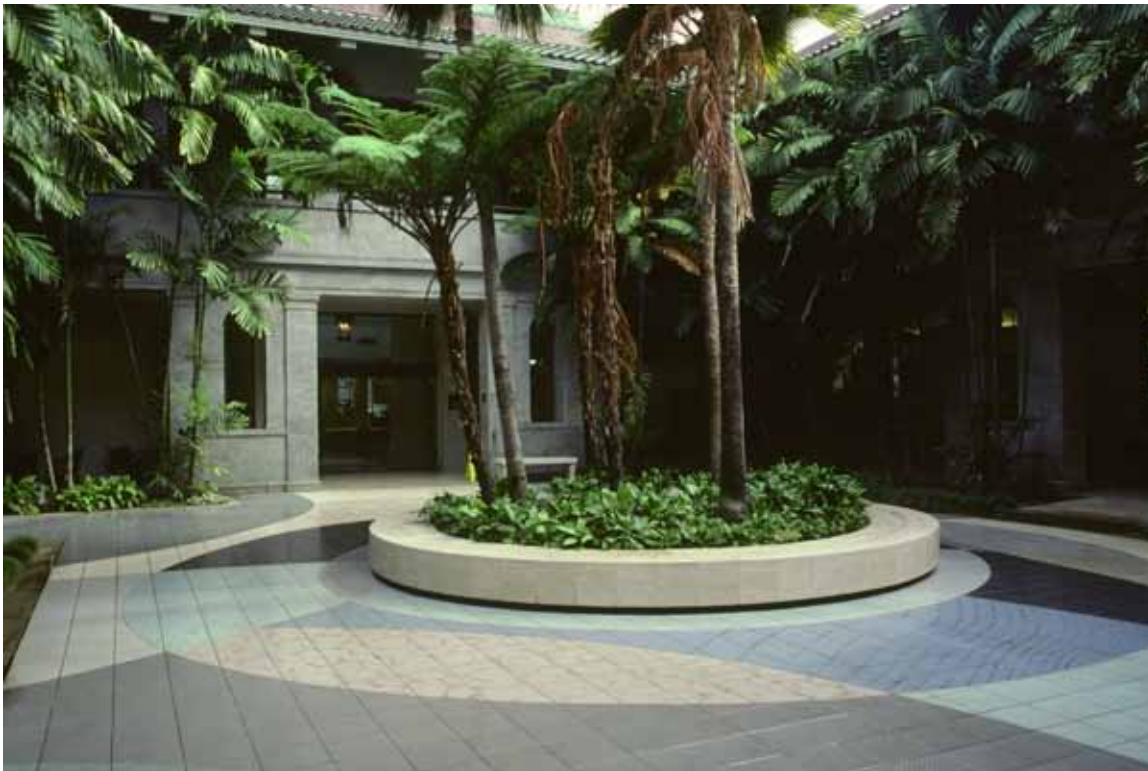
Ptychosperma macarthurii (Macarthur palm)