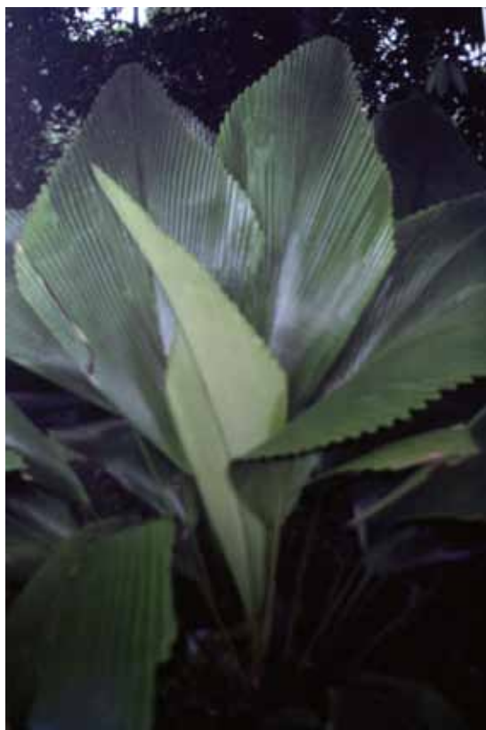
Johannesteijsmannia altifrons (litter-collecting palm)