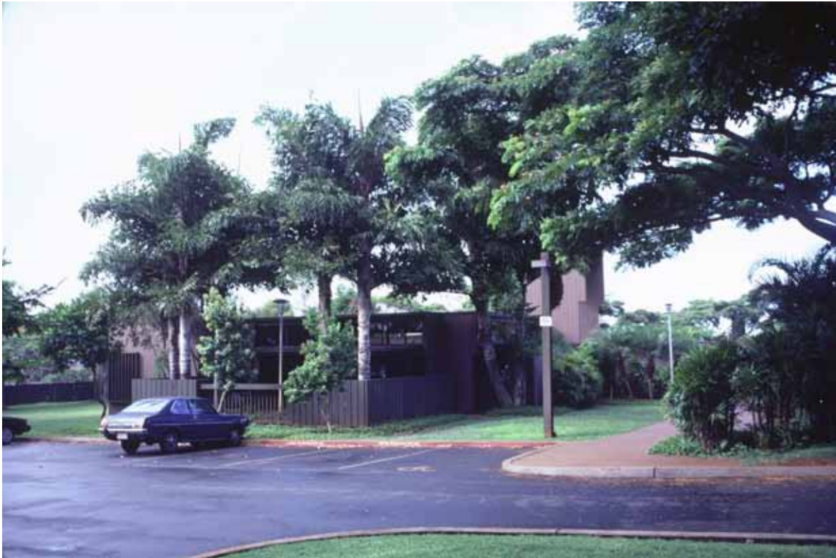
Caryota urens (wine palm)