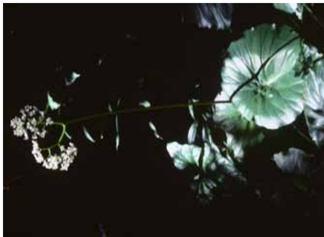
Begonia nelumbiifolia (lily-pad)