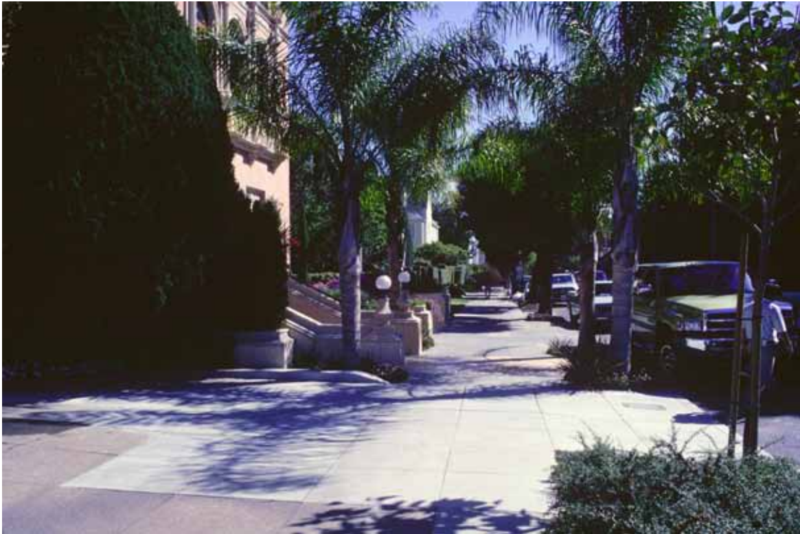
Syagrus romanzoffiana (queen palm)