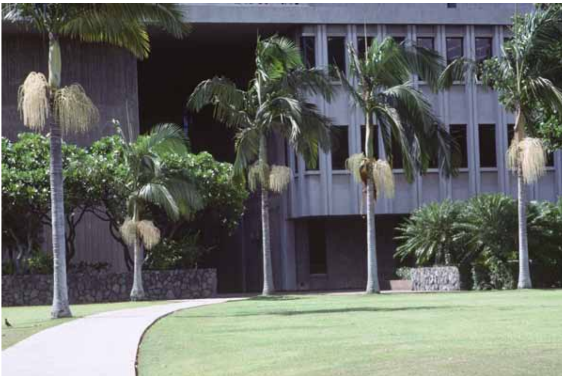
Archontophoenix alexandrae (alexandrae palm)