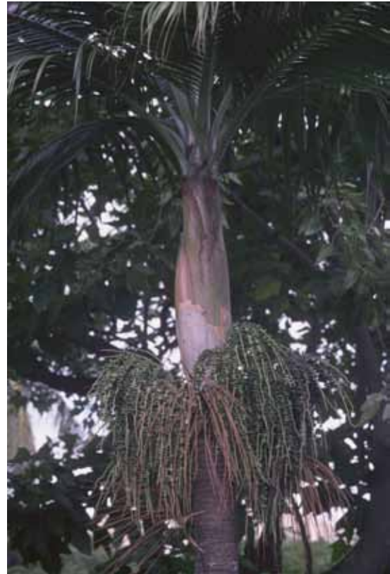
Dictyosperma album (princess palm)