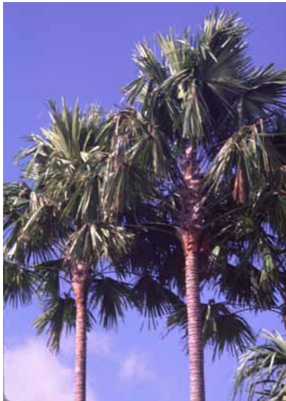
Livistonia rotundifolia (footstool palm)