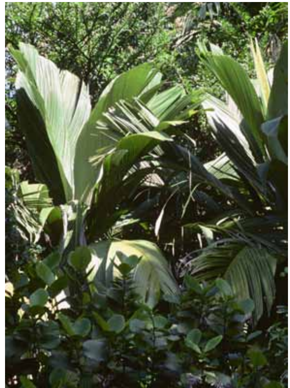
Pelagodoxa henryana (vahane)