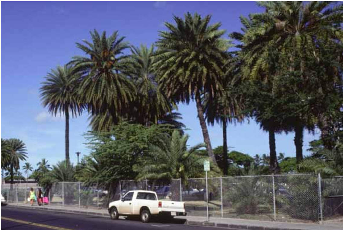
Phoenix dactylifera (date palm)