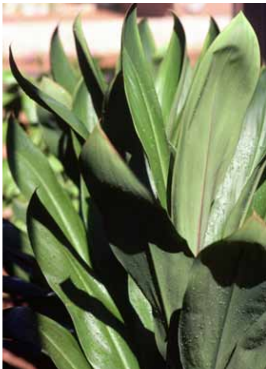
Cordyline fruticosa 'Kamehameha'