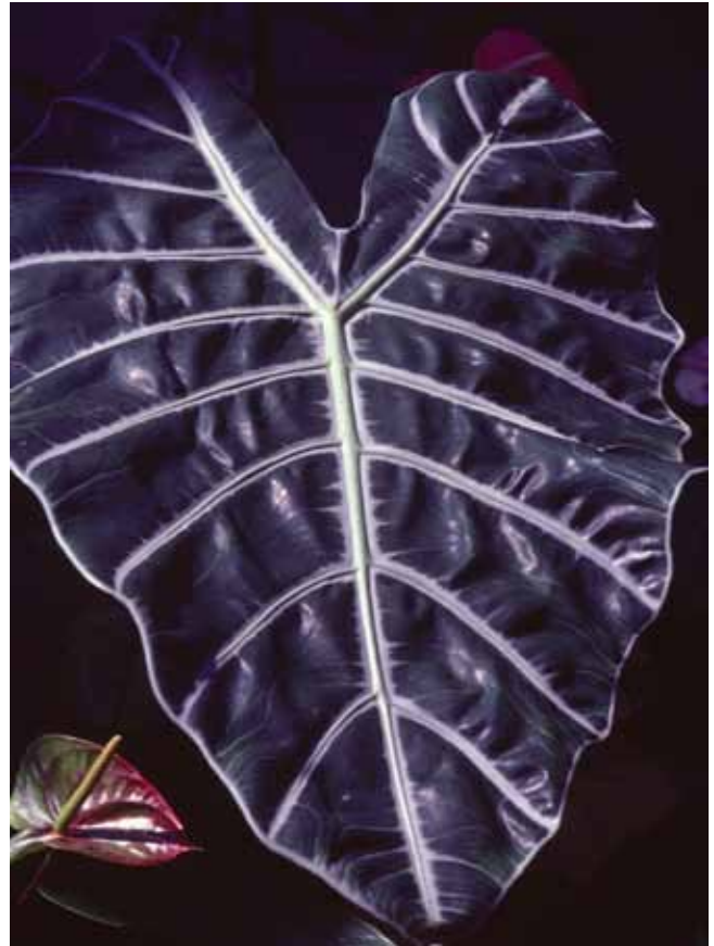
Alocasia spp. (alocasia)