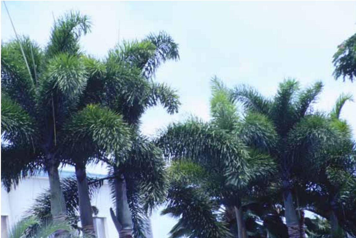
Wodyetia bifurcata (foxtail palm)