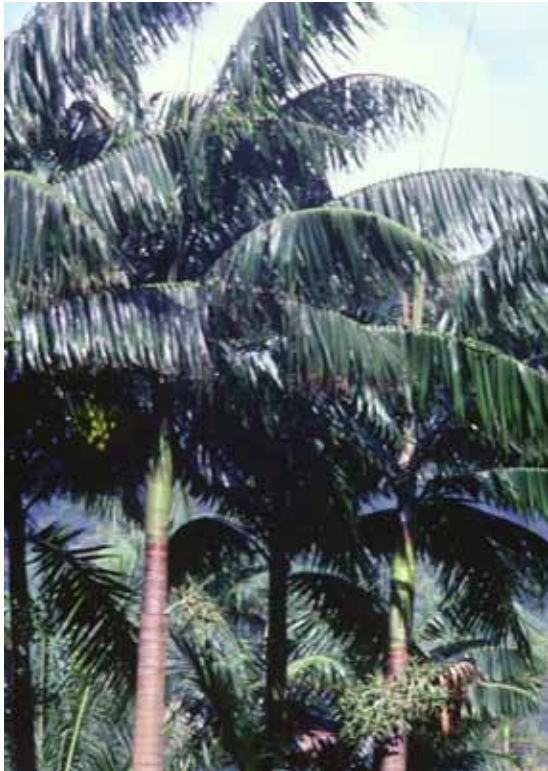
Veitchia joannis (Niusawa palm)