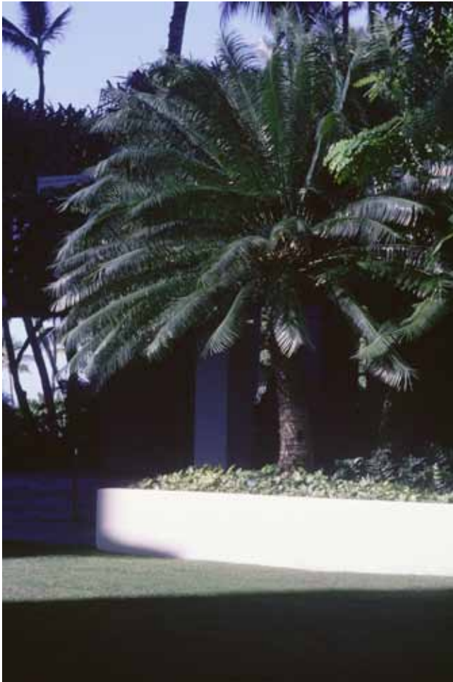
Cycas circinalis (queen sago)