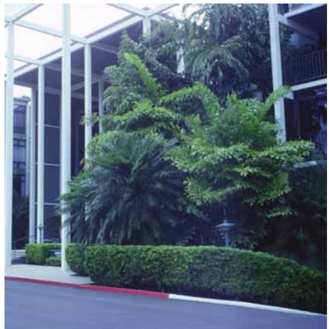
Landscaping at the Kahala Apartments, O'ahu, achieves a "tropical" effect using mostly palms.