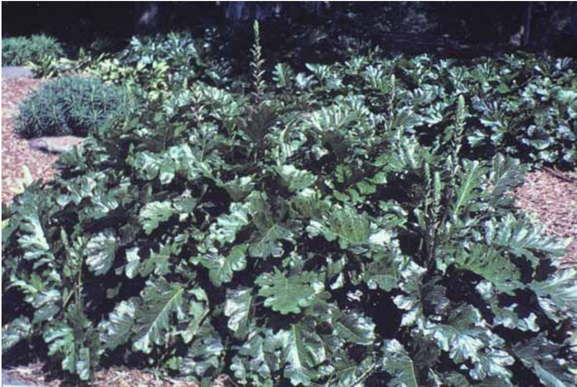
Acanthus mollis (Bear's breech)