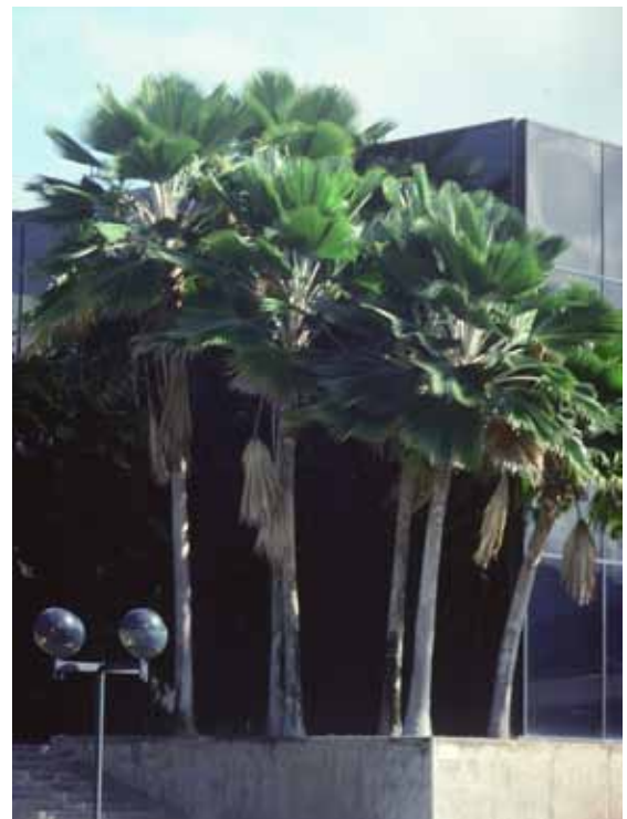
Pritchardia pacifica (Fiji fan palm)