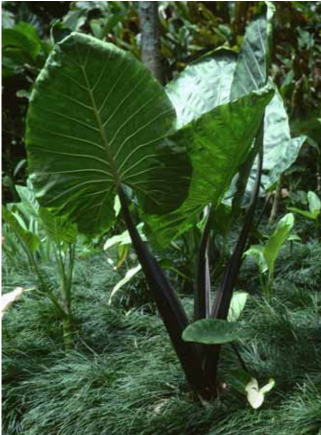
Alocasia macrorrhiza (ape)