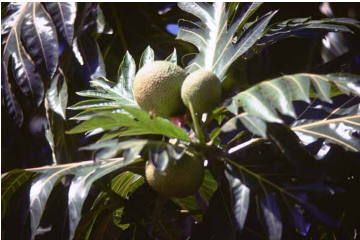
Artocarpus altilis 'Tahitian' (Tahitian breadfruit)