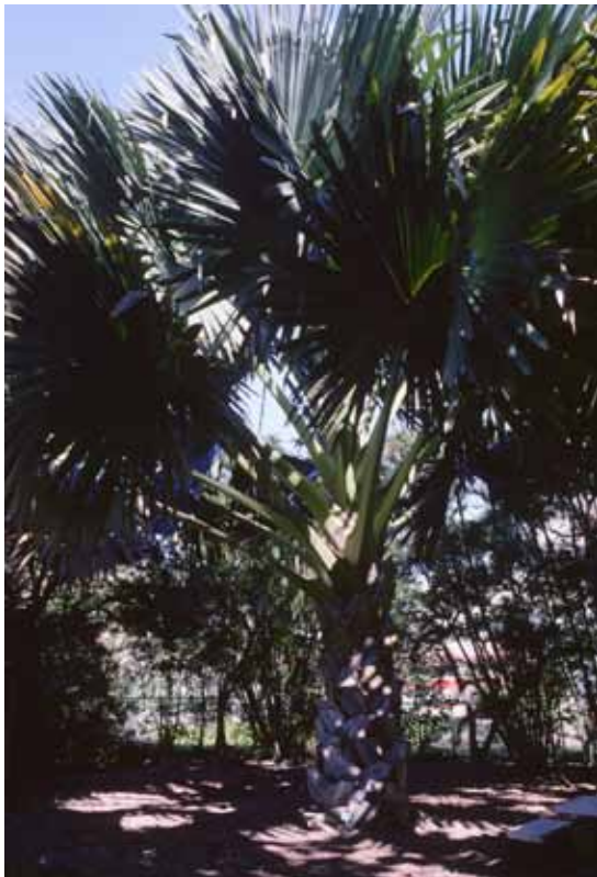
Corypha umbraculifera 'Talipot'