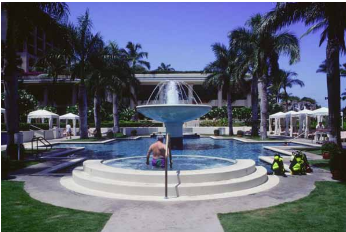
Roystonea regia (Cuban royal palm)