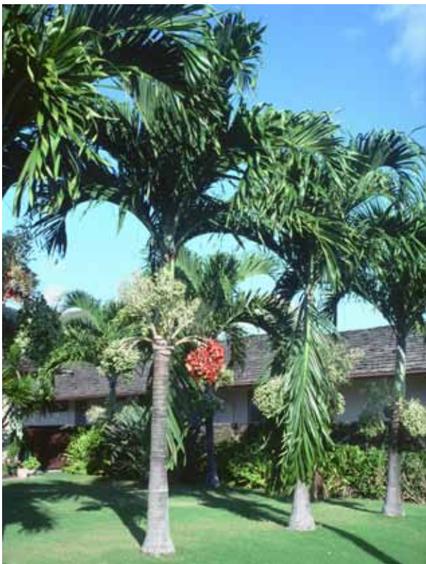
Veitchia merrillii (Manila palm)