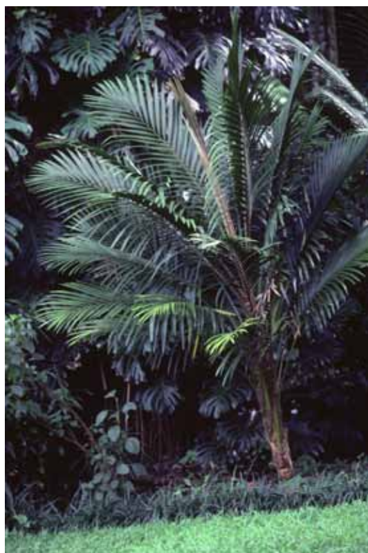
Laccospadix australasicus (Atherton palm)