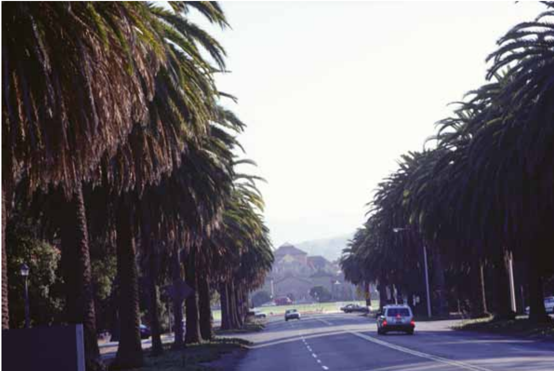
Phoenix canariensis (Canary Island date palm)