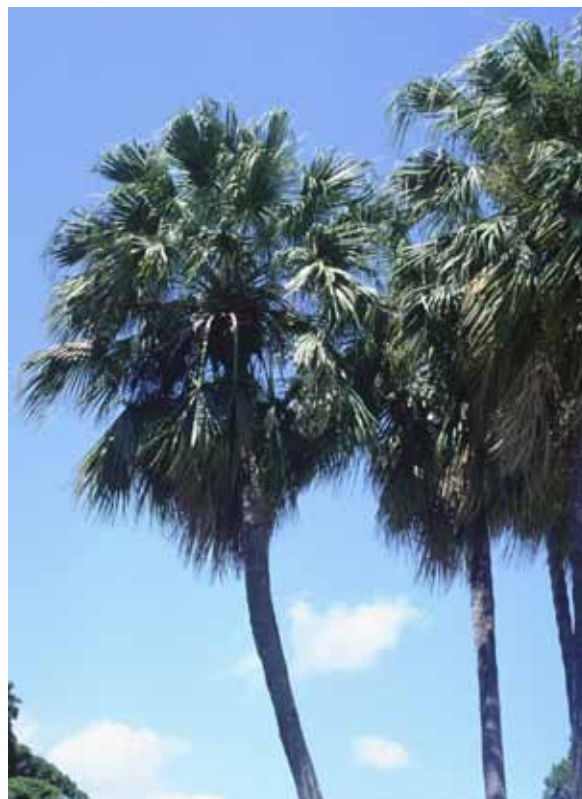
Livistonia chinensis (Chinese fan palm)