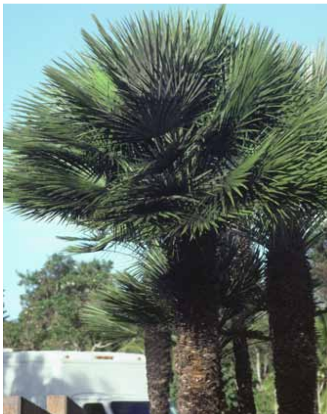
Chamaerops humilis (European fan palm)