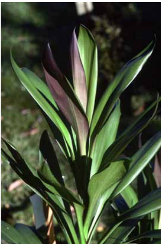
Cordyline braziliensis (Braziliansis ti)