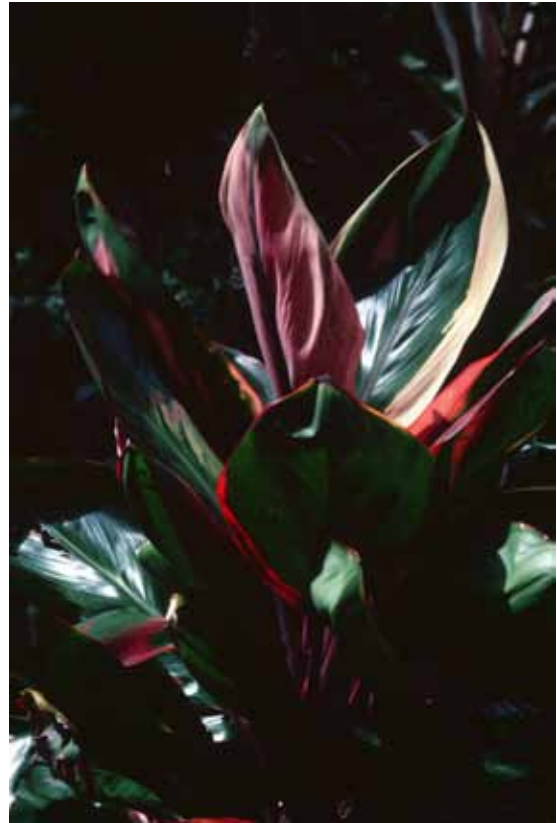
Cordyline fruticosa 'Tutu Elena'