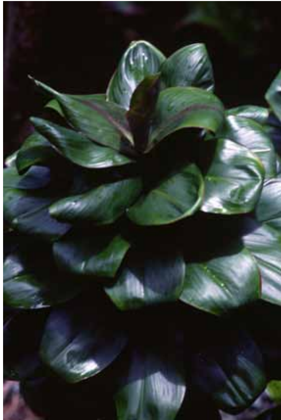
Cordyline fruticosa 'Green Spoon'