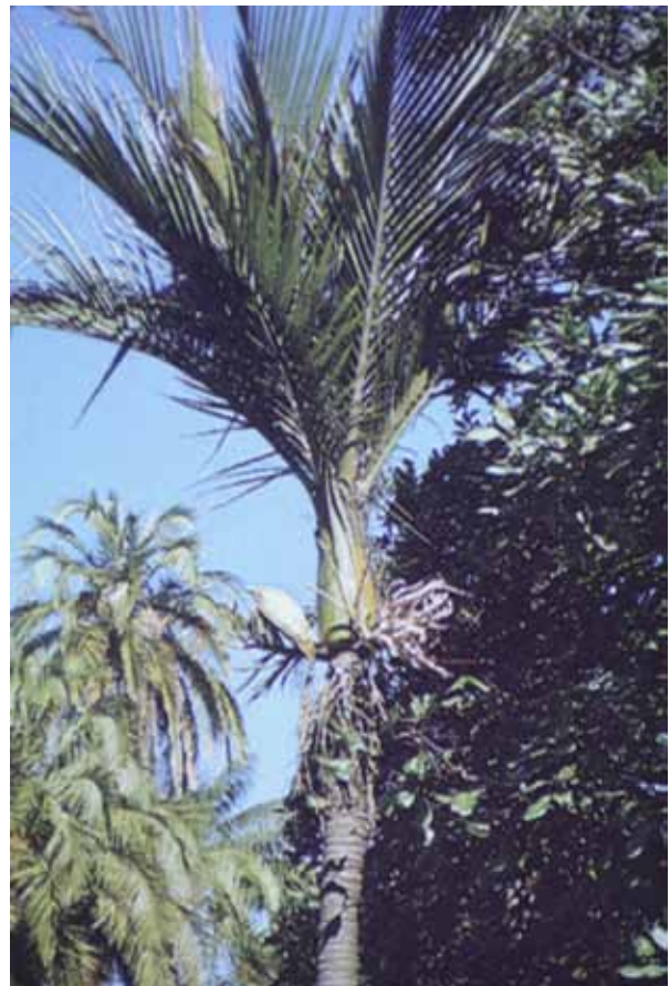
Rhopalostylis sapida (Nikau palm)