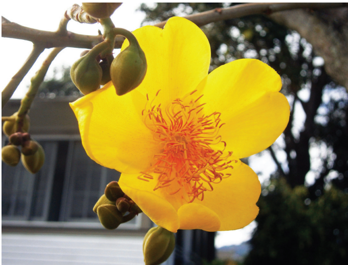
Figure 1. The buttercup yellow flowers contribute the name for this flowering tree.

This showy flowering tree is native to Mexico through Central America into northern South America. A rapid grower, it reaches about 50 ft in height with a rounded crown about 20 ft in diameter, but tends to be sparsely branched. The stout trunk has attractive gray bark. A double-flowered form from Puerto Rico is more widely grown than the single form.