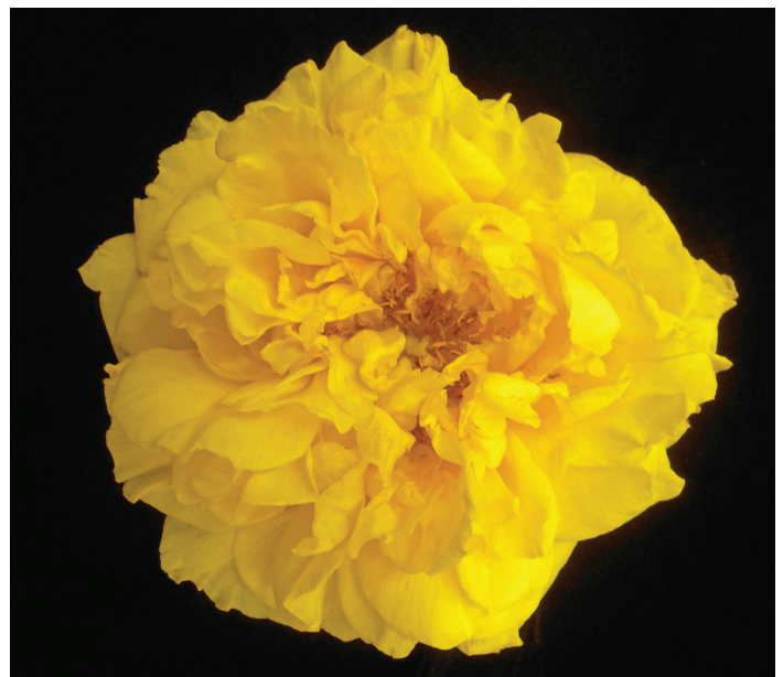
Figure 2. The double form is also known as Flore Pleno.