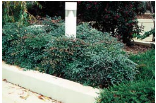
‘Harbour Dwarf’ nandina is an excellent bedding plant for this curbside location.