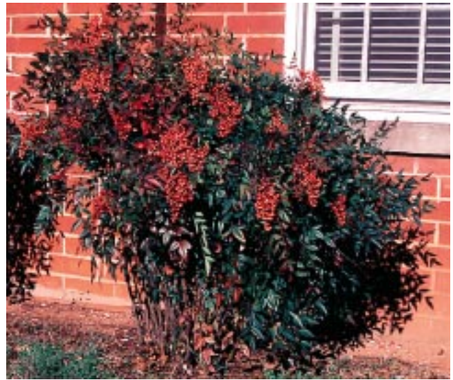
General form and growth habit of a common nandina.